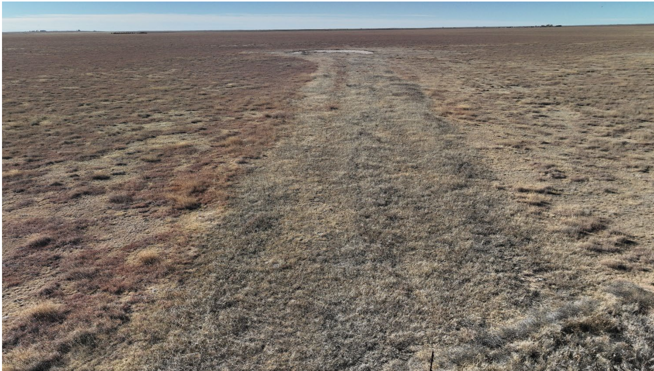
Photo 2. Drone aerial photo facing southwest along the former access road. This portion of the road has re-established desirable perennial vegetation. The lighter colored vegetation is Sand dropseed and Blue grama.