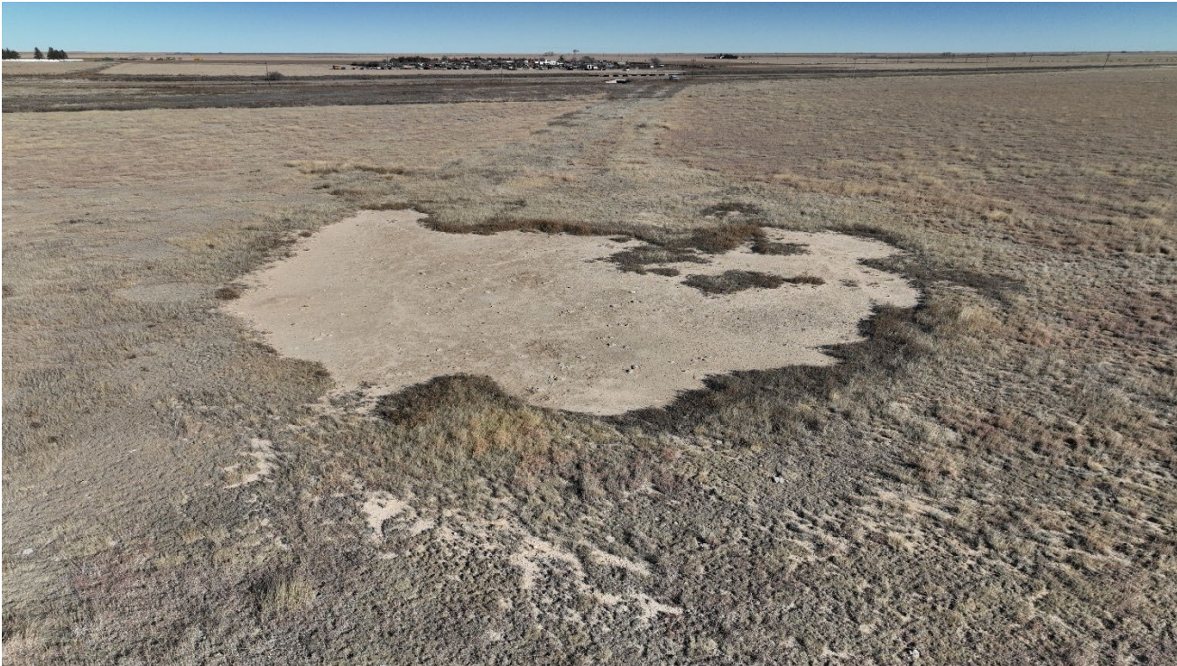
Photo 4. Drone aerial photo facing northeast at the former wellsite. The area is bare of vegetation and appears to be impacted from a historical spill from wellsite operations.