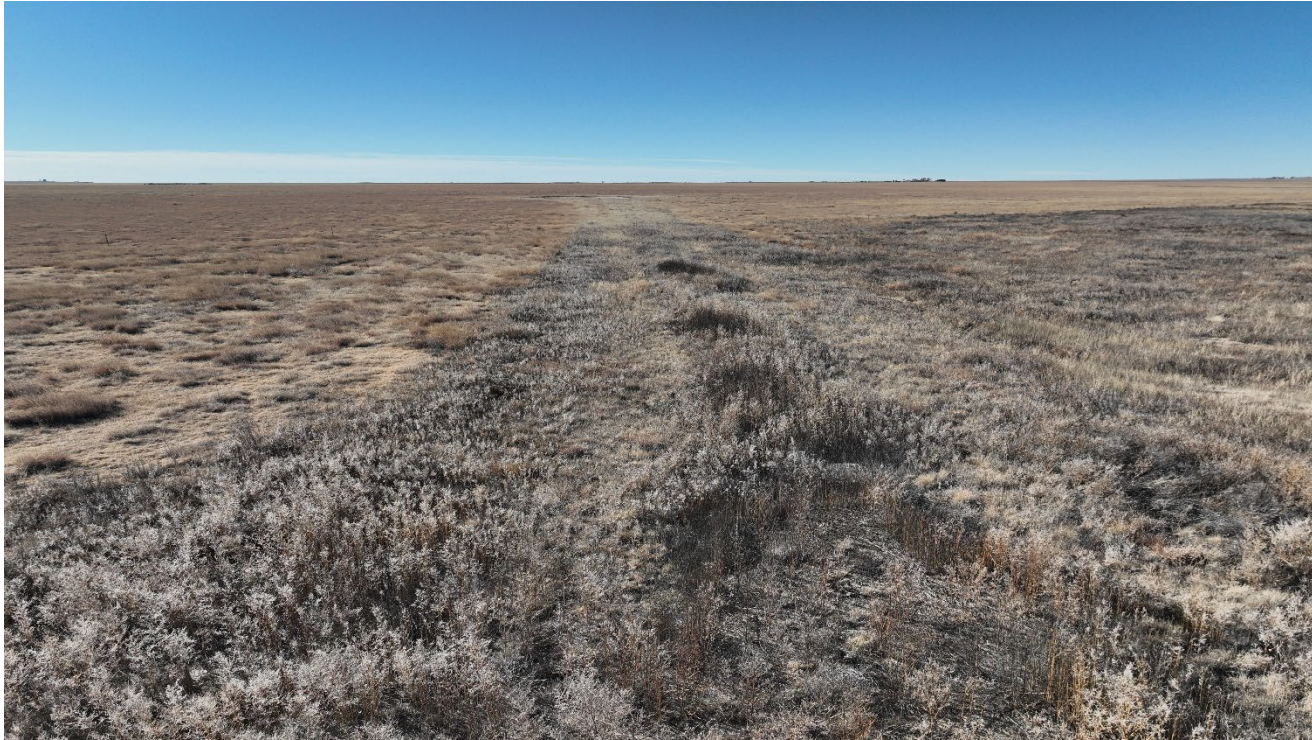
Photo 1. Drone aerial photo facing southwest toward the access road. The dark vegetation in this area is undesirable weeds (Kochia).