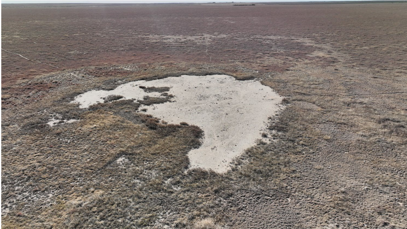
Photo 3. Drone aerial photo facing southwest at the former wellsite. The area is bare of vegetation and appears to be impacted from a historical spill from wellsite operations.