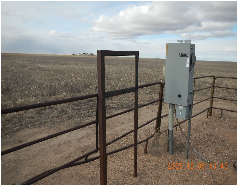
1. Lease sign missing from frame at well location.