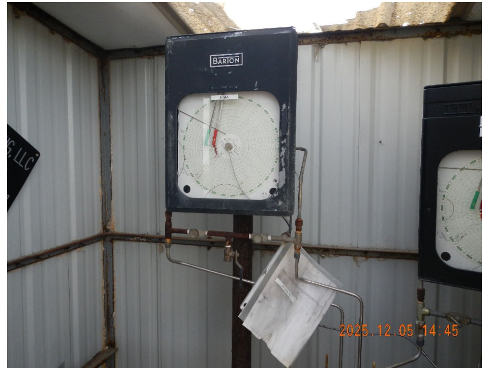
6. Gas Meter inside Meter Shed.