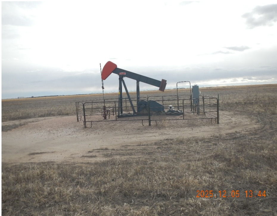
3. Well location overview.