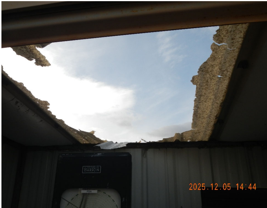
5. Damage to Meter Shed roof.