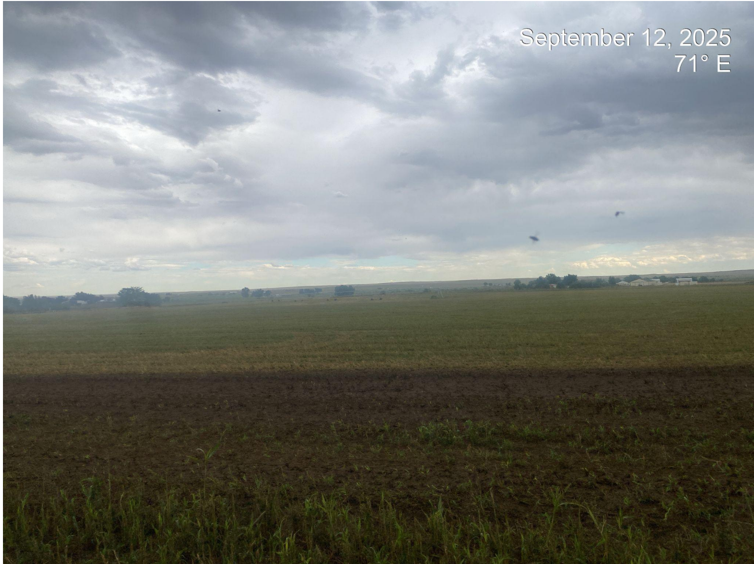
Photo 2. View of the well pad agriculture field which has been harvested.