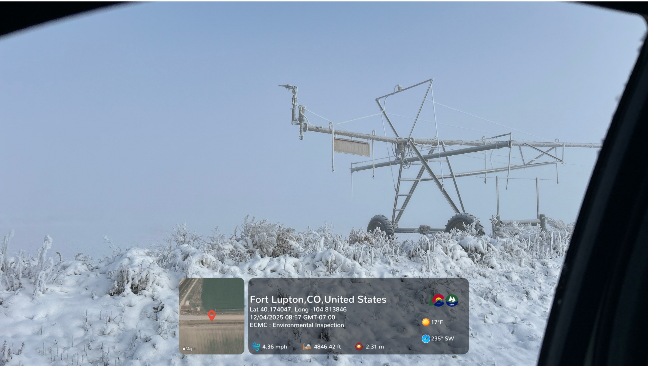
Looking at the irrigation pivot in the field surrounding the flowline. The pivot appears frozen and not currently in operation.