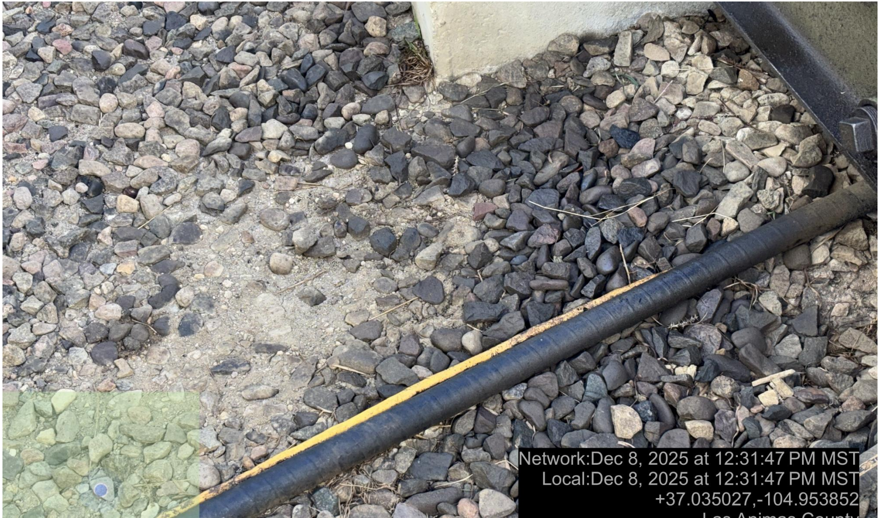
PHOTO 5: IMPACTED OIL NEAR PRIME MOVER SKID. Conduct maintenance on equipment, cleanup stained material and review self inspection processes. COMPLY WITH RULE 1002,(2).D. CA DATE 12-15-2025.