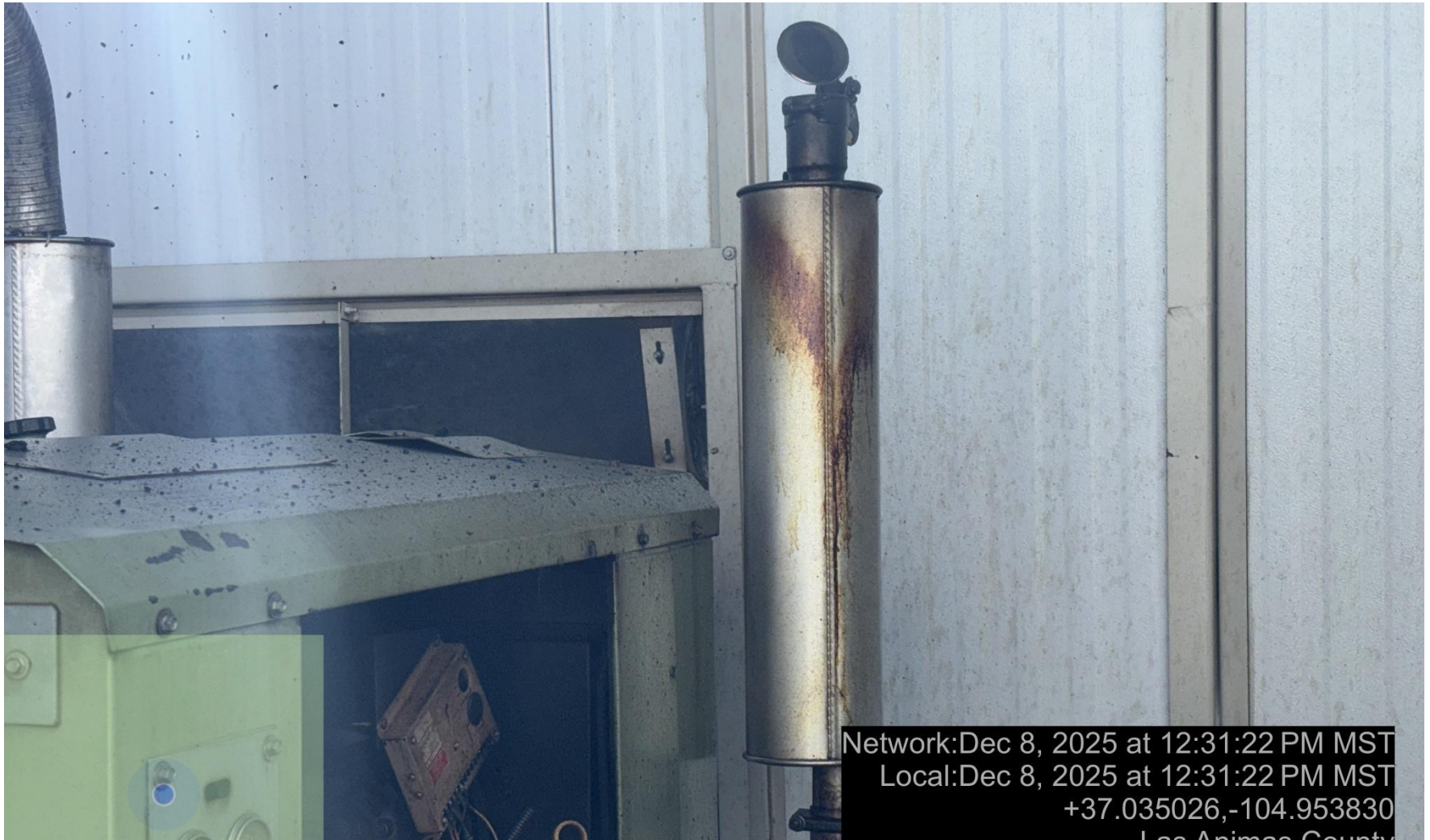
PHOTO 7: PRIME MOVER IS BLOWING OIL OUT OF EXHAUST PIPES. Securely fasten all valves, pipes, fittings, and Production Facilities to ensure good mechanical condition, inspect at regular intervals and maintain in good mechanical condition. Engineer, operate, and maintain equipment within the manufacturer's recommended specifications per Rule 608.e. CA DATE 12-9-2025.