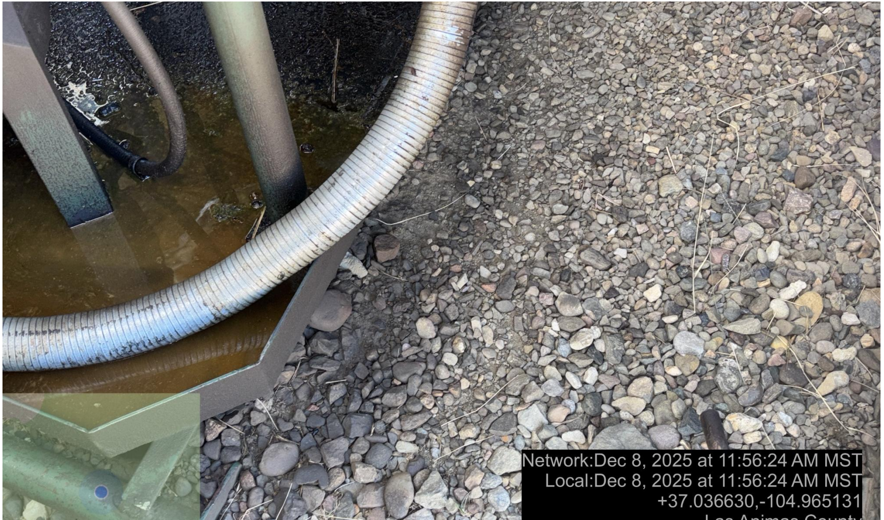
PHOTO 5: AREA OF IMPACTED SOIL NEAR COMPRESSOR SKID. Conduct maintenance on equipment, cleanup stained material and review self inspection processes. COMPLY WITH RULE 1002,(2).D. CA DATE 12-15-2025.