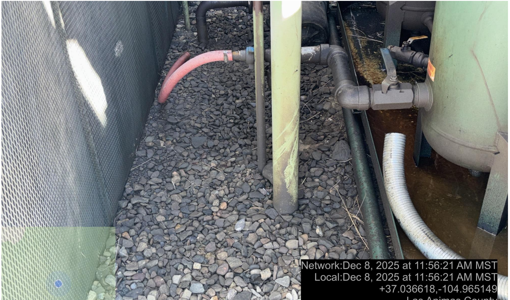
PHOTO 4: AREA OF IMPACTED SOIL NEAR COMPRESSOR SKID. Conduct maintenance on equipment, cleanup stained material and review self inspection processes. COMPLY WITH RULE 1002,(2).D. CA DATE 12-15-2025.