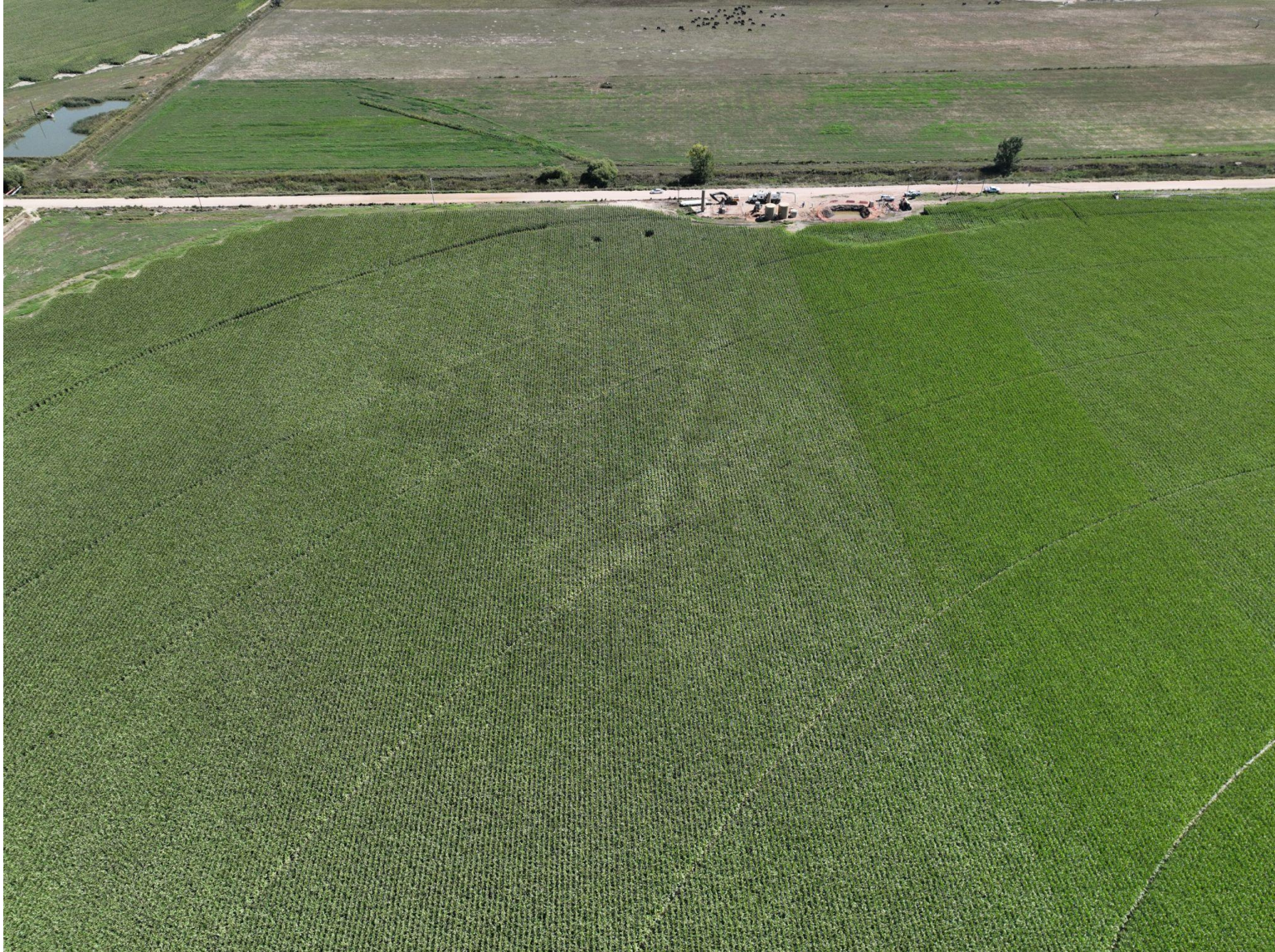
Photo 2. Aerial view of the well pad and access road taken with a drone during the time of the inspection from the western edge facing east. Note: Crop vegetation at the well pad and access road appear consistent with adjacent reference areas.