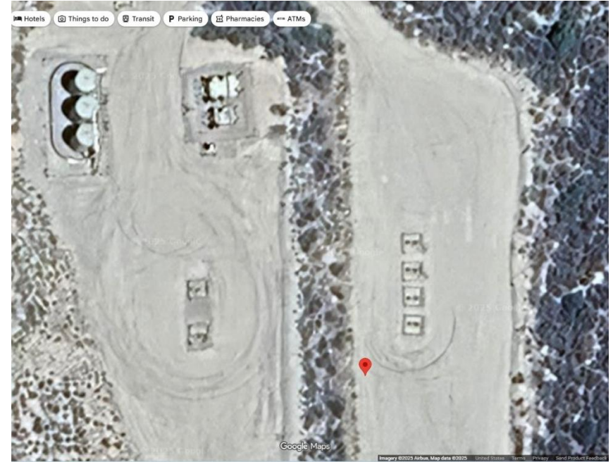
Photo # 1 Scout Card records & Drilling Completion Report coordinates for the CHEVRON 1N-4D well - Coordinates appear to be off by approximately 40 ft (coordinates incorrect/not in compliance with CECMC Rules 216 & 414 – records require updating)

Photo # 2 Scout Card records & Drilling Completion Report coordinates for the CHEVRON 1N-4D well - Coordinates appear to be off by approximately 40 ft (coordinates incorrect/not in compliance with CECMC Rules 216 & 414 – records require updating)