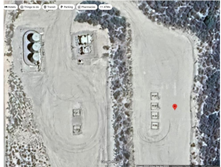
Photo # 3 Scout Card records & Drilling Completion Report coordinates for the CHEVRON 8L-5D well - Coordinates appear to be off by approximately 29 ft (coordinates incorrect/not in compliance with CECMC Rules 216 & 414 – records require updating)

Photo # 4 Scout Card records & Drilling Completion Report coordinates for the CHEVRON 8L-5D well - Coordinates appear to be off by approximately 29 ft (coordinates incorrect/not in compliance with CECMC Rules 216 & 414 – records require updating)