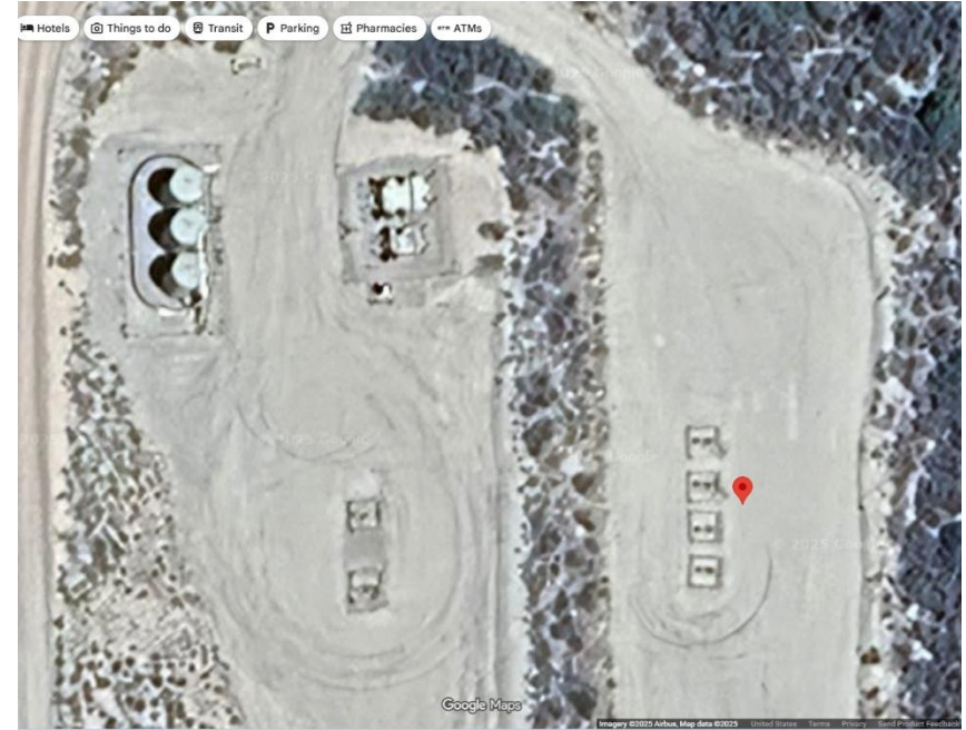
Photo # 7 Scout Card records & Drilling Completion Report coordinates for the CHEVRON 8K-5D well - Coordinates appear to be off by approximately 12-14 ft (coordinates incorrect/not in compliance with CECMC Rules 216 & 414 – records require updating)

Photo # 8 Scout Card records & Drilling Completion Report coordinates for the CHEVRON 8K-5D well - Coordinates appear to be off by approximately 12-14 ft (coordinates incorrect/not in compliance with CECMC Rules 216 & 414 – records require updating)