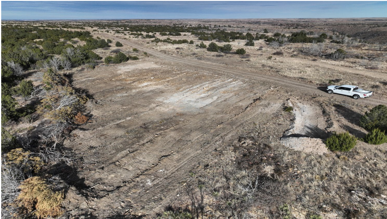
Photo 7. Facing northeast. Topsoil was mixed and pushed up to the road which is not sufficient material to stabilize the road.