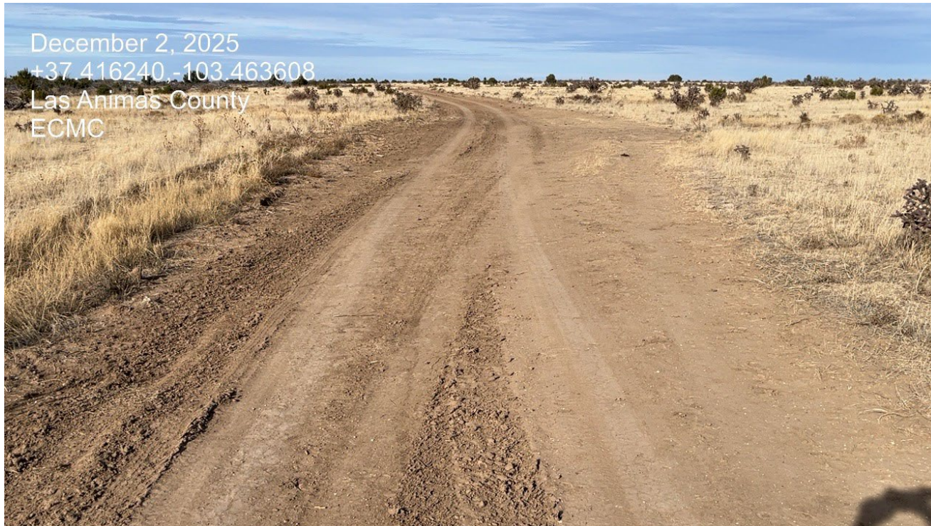
Photo 5. Facing north along the access road. Vehicles are driving outside of the road causing unnecessary disturbance.