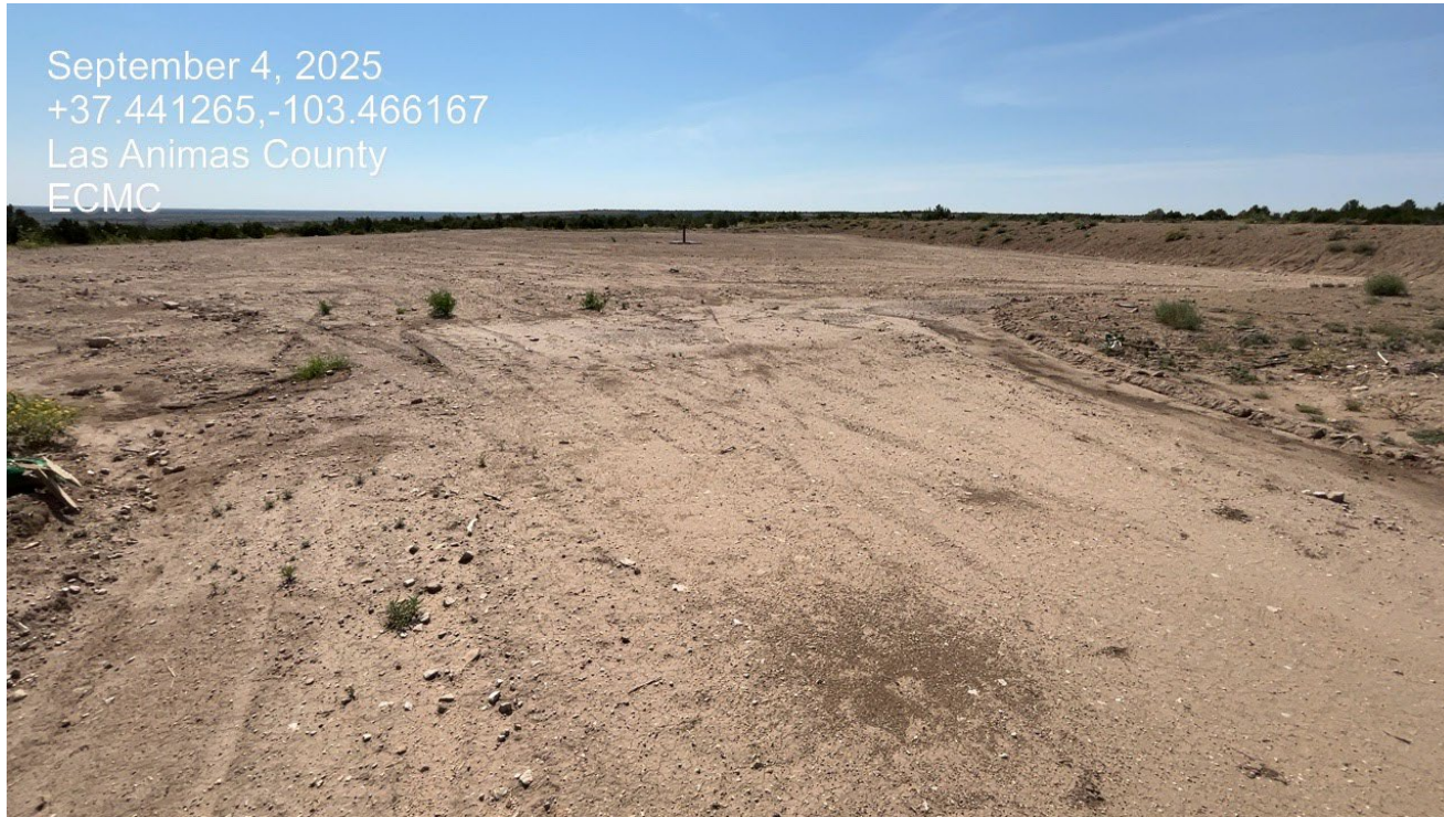
Photo 10. Facing south toward the well pad location..