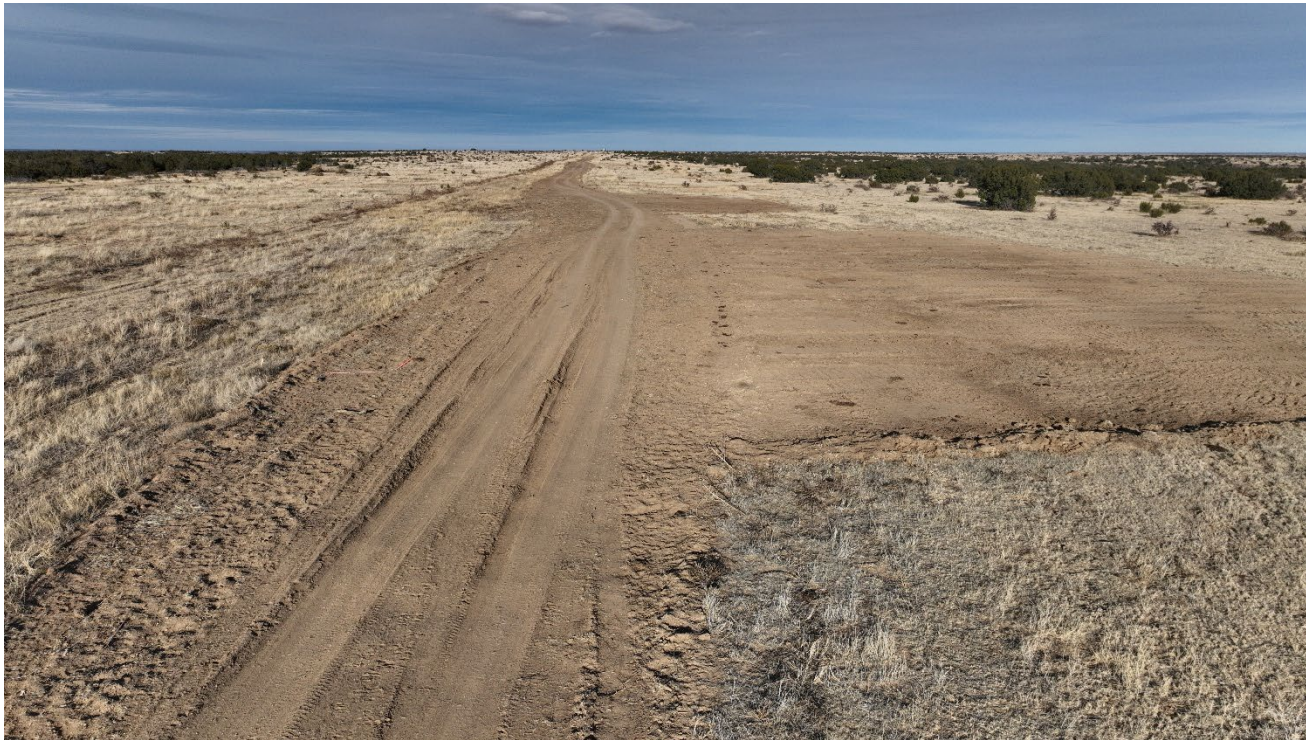
Photo 2. Facing north along the access road. This area has been disturbed with a dozer pushing topsoil up onto the road. The topsoil is loose and not adequate for stabilization of the road.