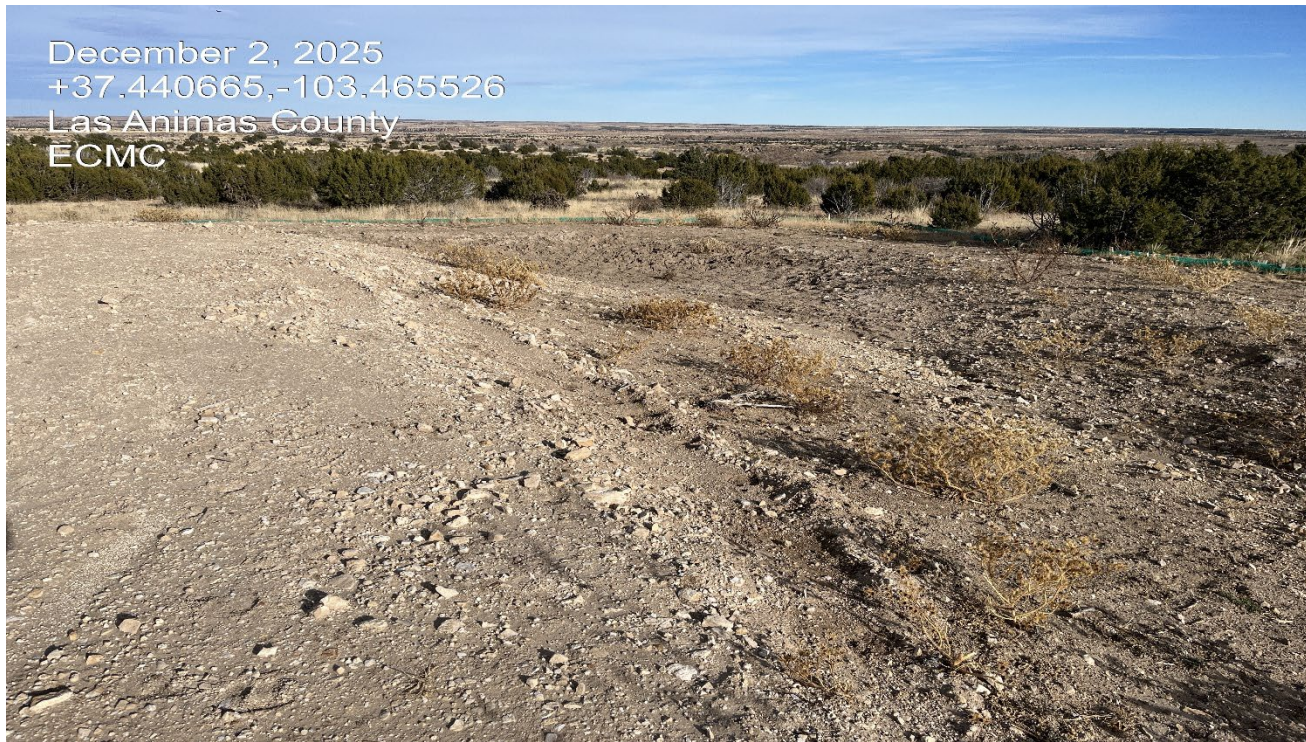
Photo 11. Facing southeast corner of the location. This sediment trap has filled in with sediment and needs to be cleaned out and maintained.