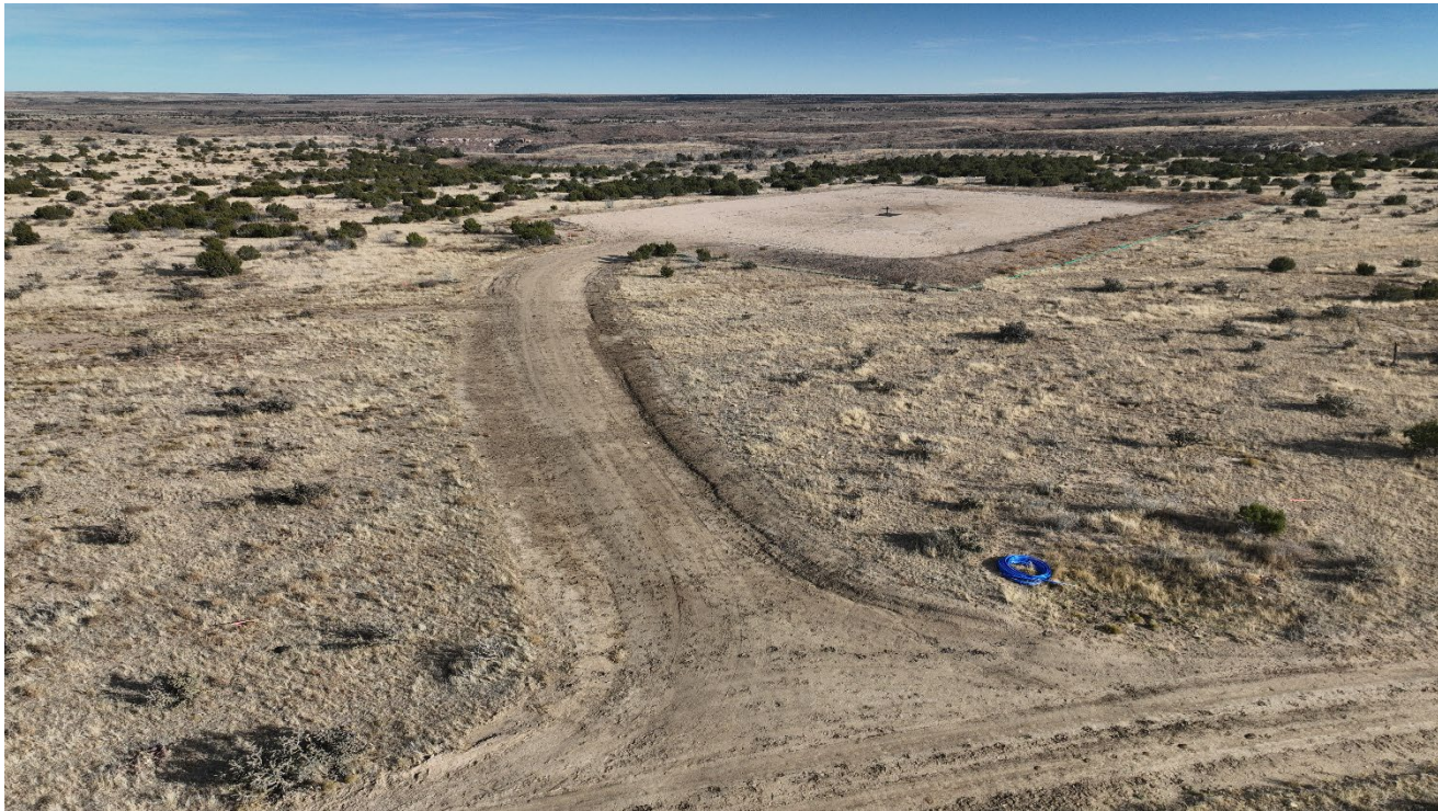
Photo 9. Drone aerial photo facing southeast toward the location.