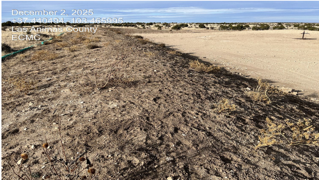
Photo 12. Southwest corner of the location facing north. The topsoil has not been seeded and stabilized.