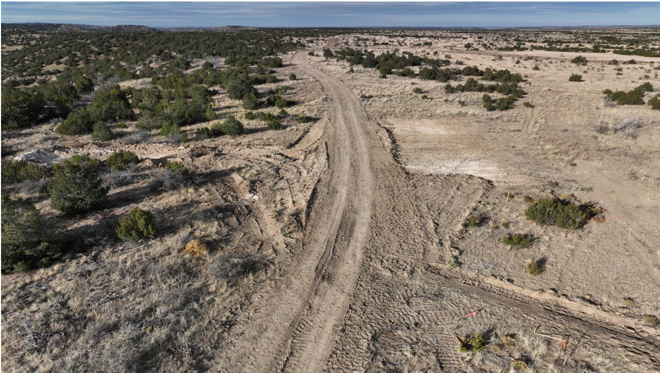
Photo 8. Drone aerial photo facing north along the road.