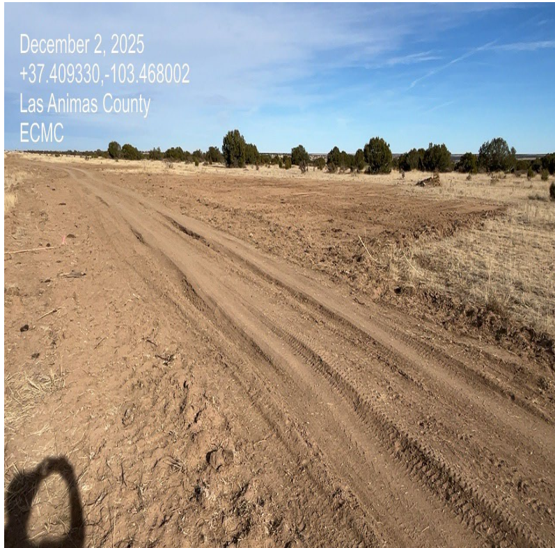
Photo 3. Facing toward the area where topsoil was pushed onto the road. The topsoil is loose and is not an adequate road base material.