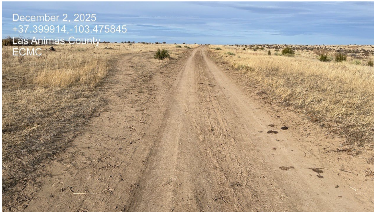
Photo 1. Facing northeast along the access road. Vehicles are driving outside of the road causing unnecessary disturbance. The road needs to be repaired and maintained. Previous CA was not completed.