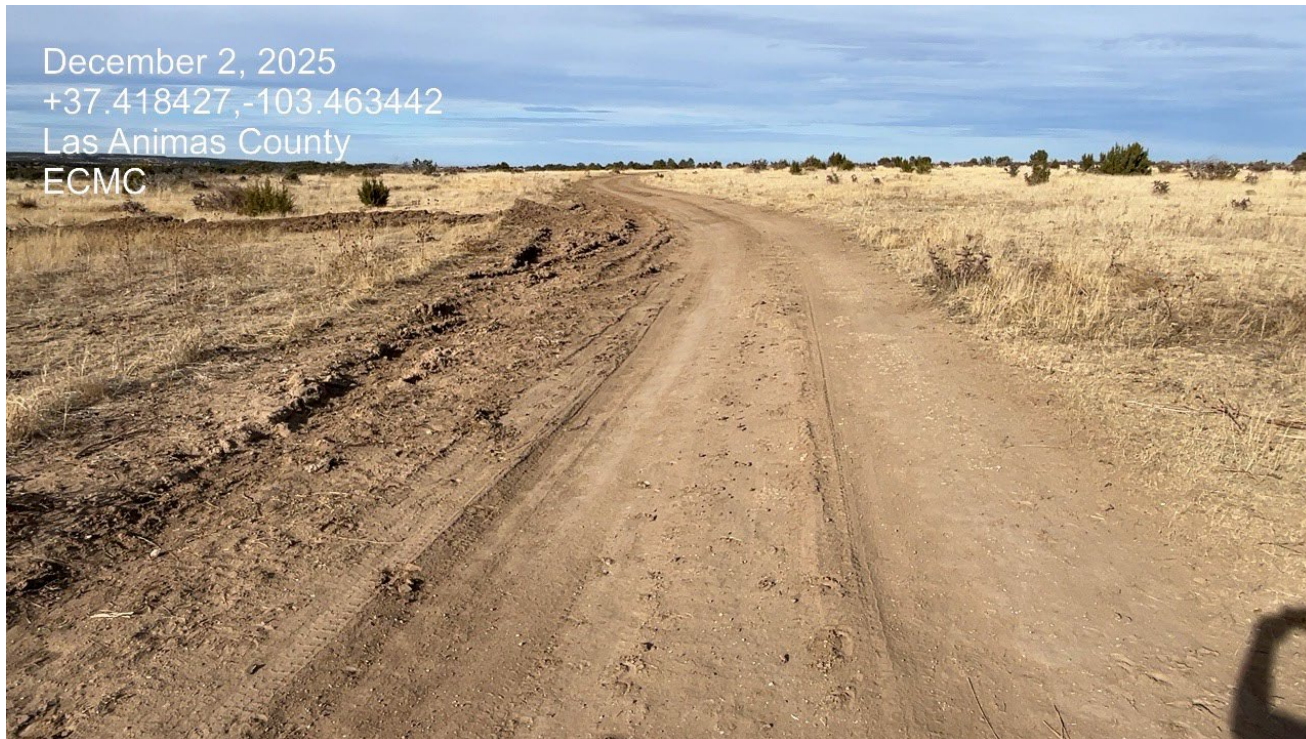
Photo 6. Facing north along the access road. Vehicles are driving outside of the road causing unnecessary disturbance. Vehicle tracking is occurring along the road.