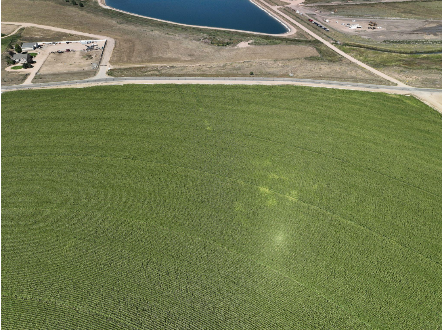
Photo 2. Aerial view of the well pad and tank battery taken with a drone during the time of the inspection from the southern edge facing north.