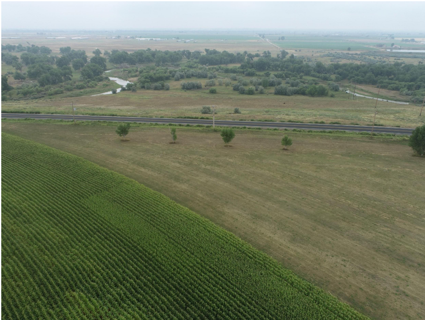
Photo 4. Drone aerial imagery taken west of well location, facing east (displaying the well).