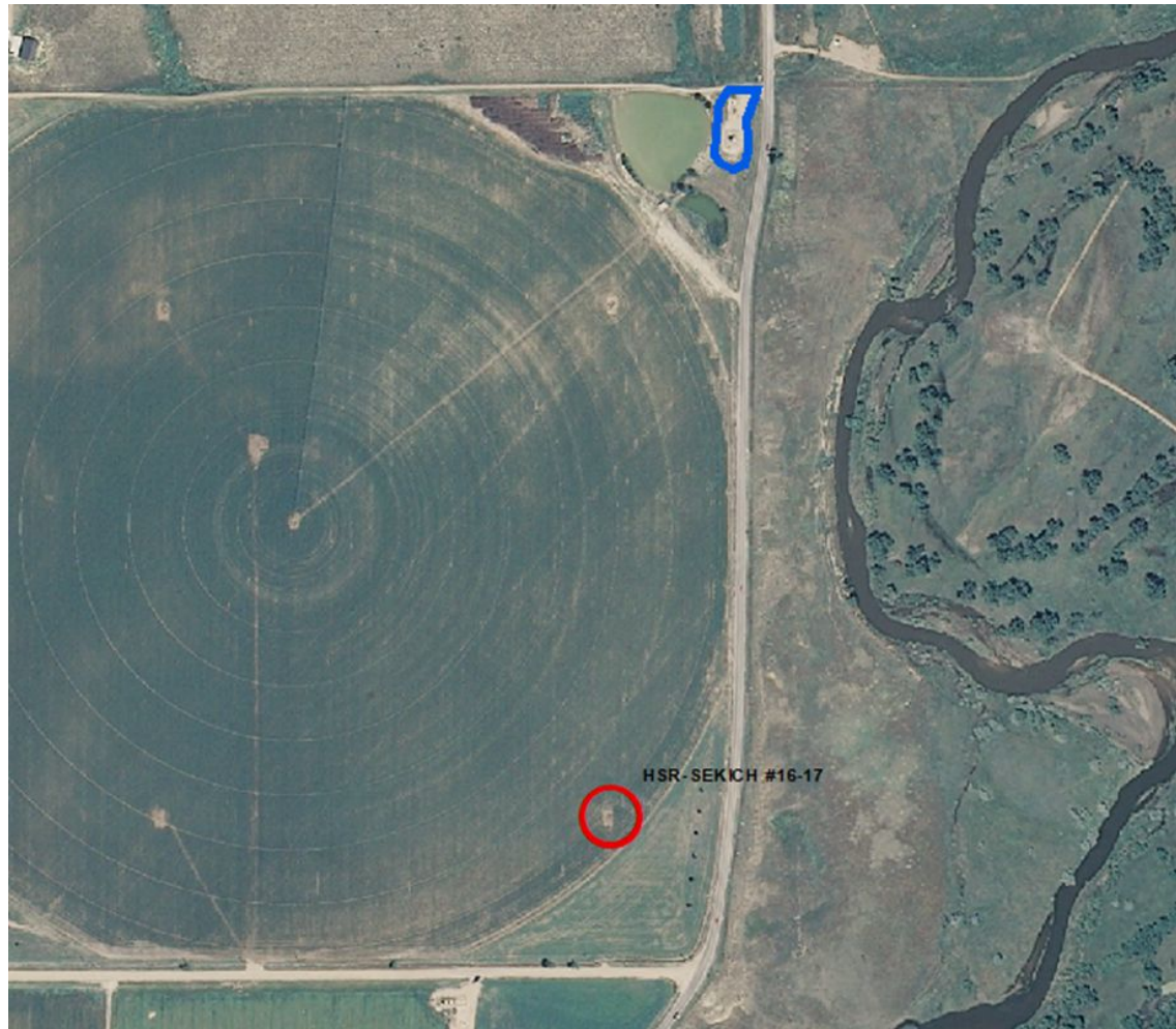
Photo 1. NAIP aerial imagery (2009) illustrating the well location (red circle), associated tank battery location (blue polygon), and well access road. Tank battery is associated with the HSR Sekich 9-17 well API #123-18820 under location ID #330297.