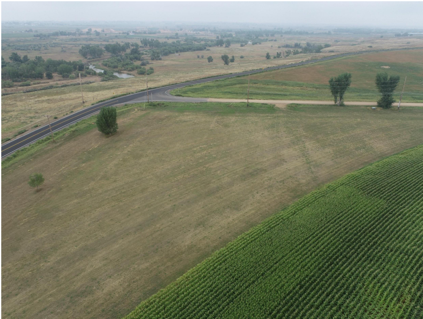
Photo 5. Drone aerial imagery taken north of well location, facing south (displaying the well and access road).