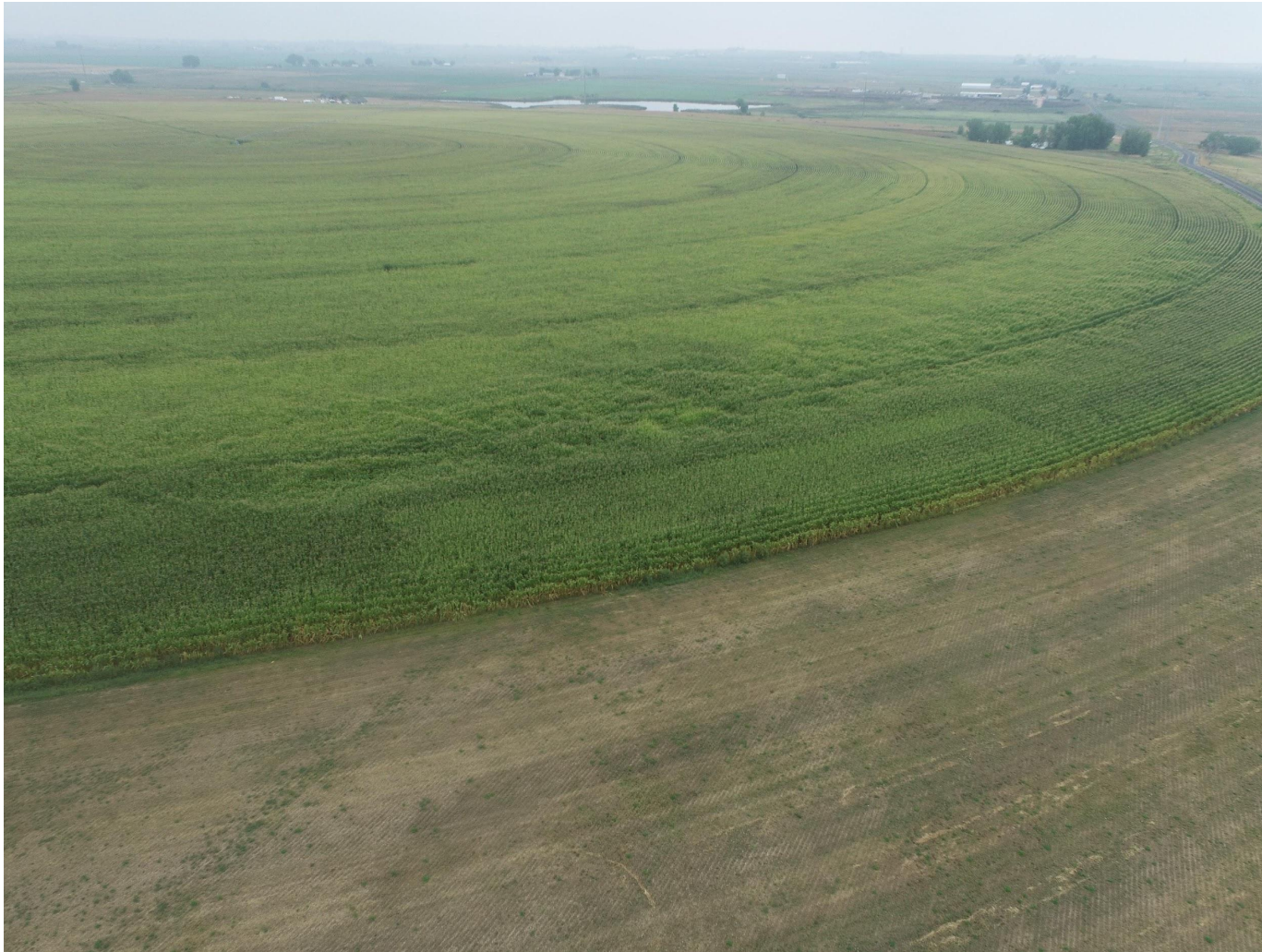
Photo 3. Drone aerial imagery taken south of well location, facing north (displaying the well, access road, TB, and presumed flowline). Crop vegetation at the well pad and access road appear consistent with adjacent reference areas.