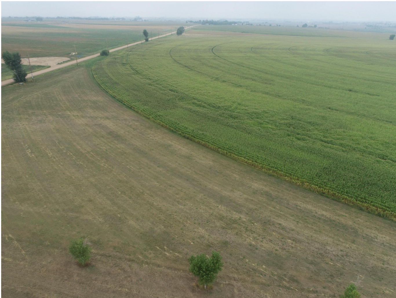
Photo 6. Drone aerial imagery taken east of well location, facing west (displaying the well).