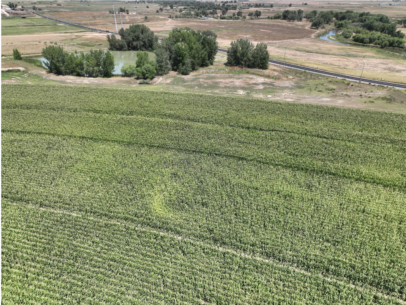
Photo 7. Drone aerial imagery taken southwest of well location, facing northeast (displaying the well, TB (obscured by trees), access road, and presumed flowline location).