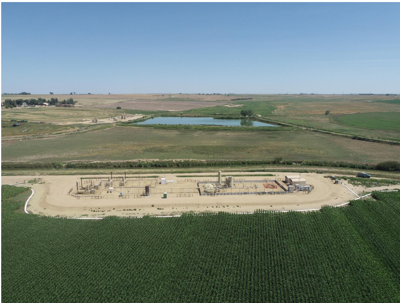
Photo 9. Drone aerial imagery taken west of the tank battery location, facing east (displaying TB).