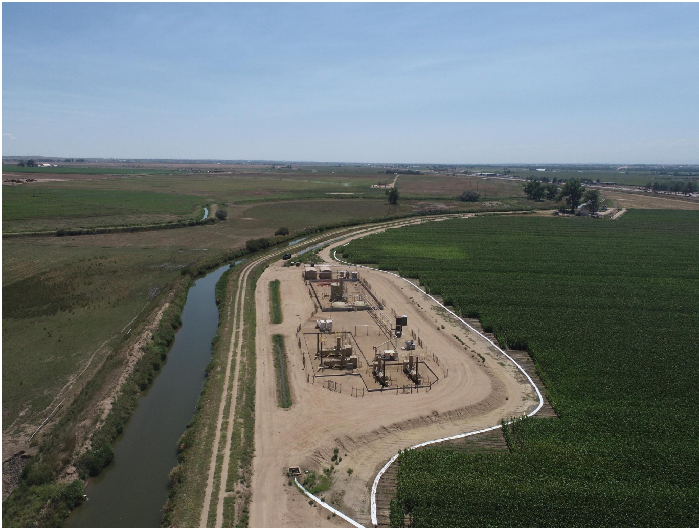
Photo 10. Drone aerial imagery taken north of the tank battery location, facing south (displaying the TB).