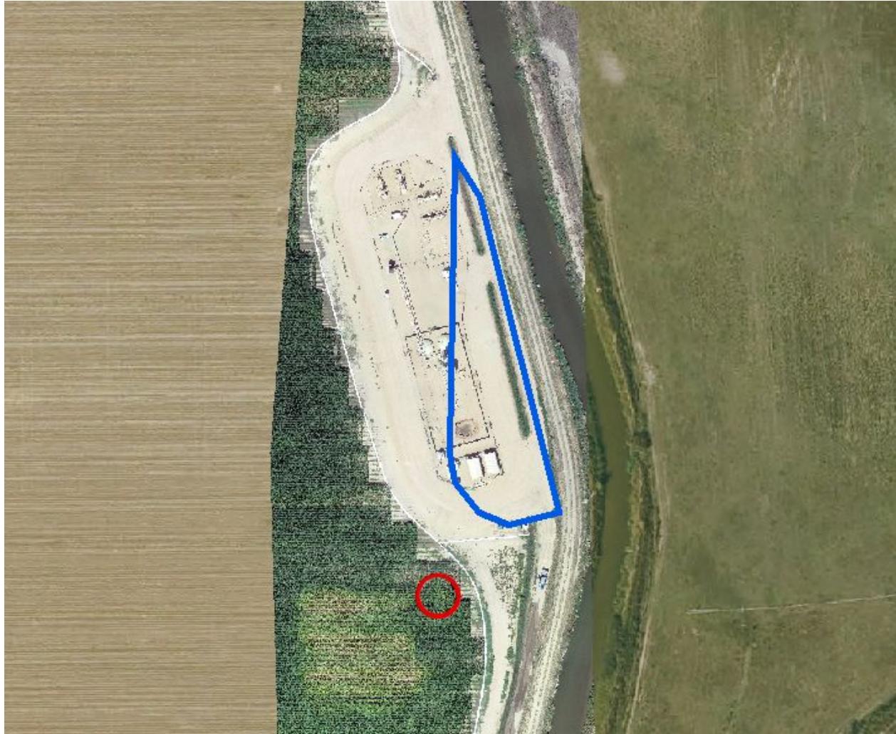
Photo 2. Orthomosaic (drone) imagery taken 8/20/2025 and NAIP aerial imagery (2023) illustrating the well location (red circle) and associated tank battery (blue polygon). Note: Historical imagery shows a new tank battery facility was built over the old tank battery disturbance.