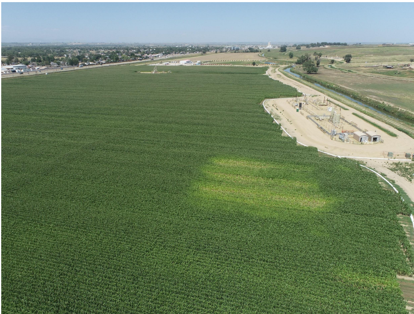
Photo 3. Drone aerial imagery taken south of well location, facing north (displaying the well, well access roads, and presumed flowline).