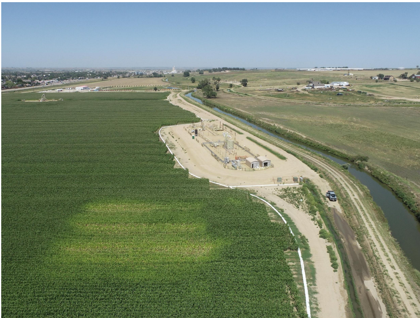
Photo 8. Drone aerial imagery taken south of the tank battery location, facing north (displaying the TB). Sunted crop to the west of the well pad disturbance is not related to oil and gas operations.