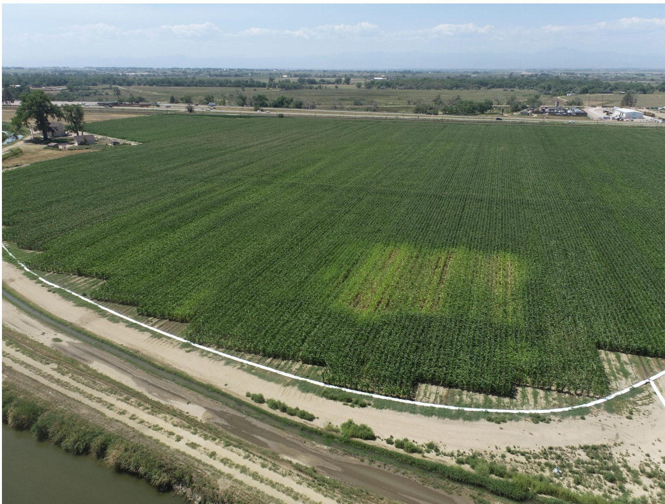
Photo 6. Drone aerial imagery taken east of well location, facing west (displaying the well, well access roads, and presumed flowline).