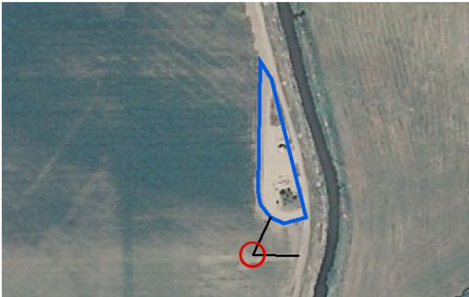
Photo 1. NAIP aerial imagery (2009) illustrating the well location (red circle), associated tank battery location (blue polygon), and well access roads (black lines).