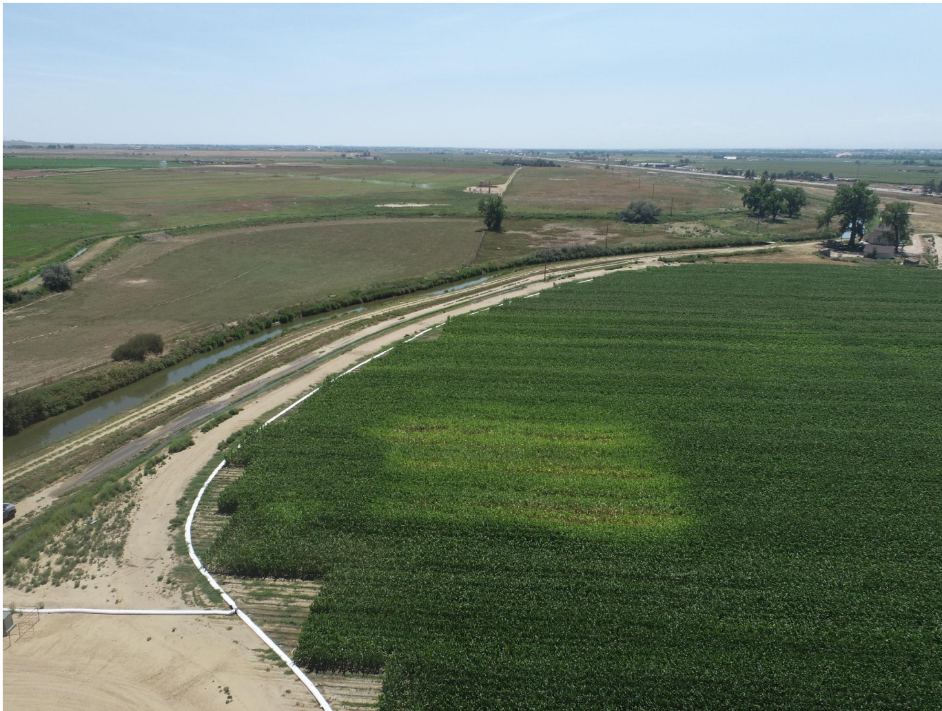
Photo 5. Drone aerial imagery taken north of well location, facing south (displaying the well, well access roads, and presumed flowline).