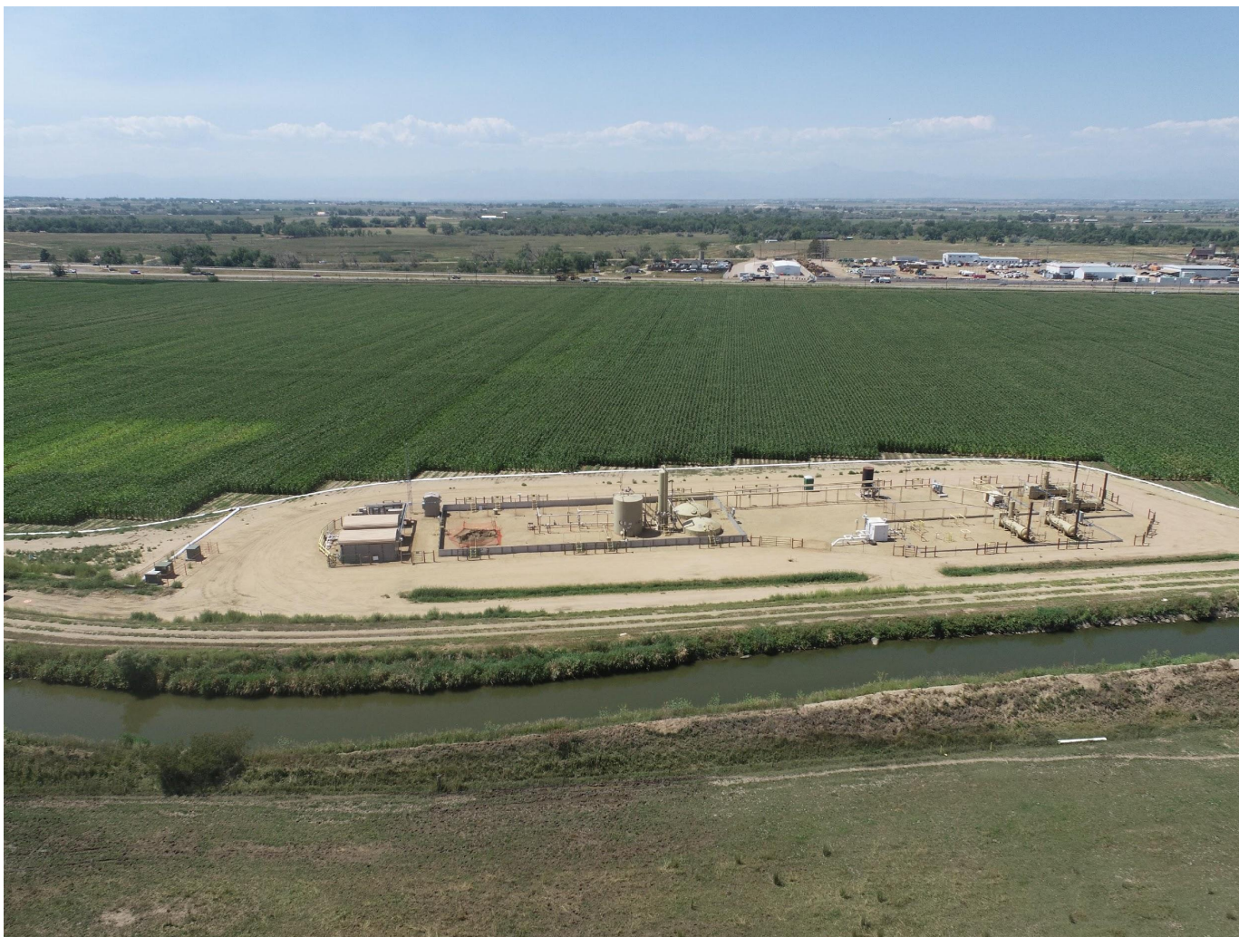
Photo 11. Drone aerial imagery taken east of the tank battery location, facing west (displaying the TB). No evidence of previous tank battery disturbance observed at newly built tank battery facility.