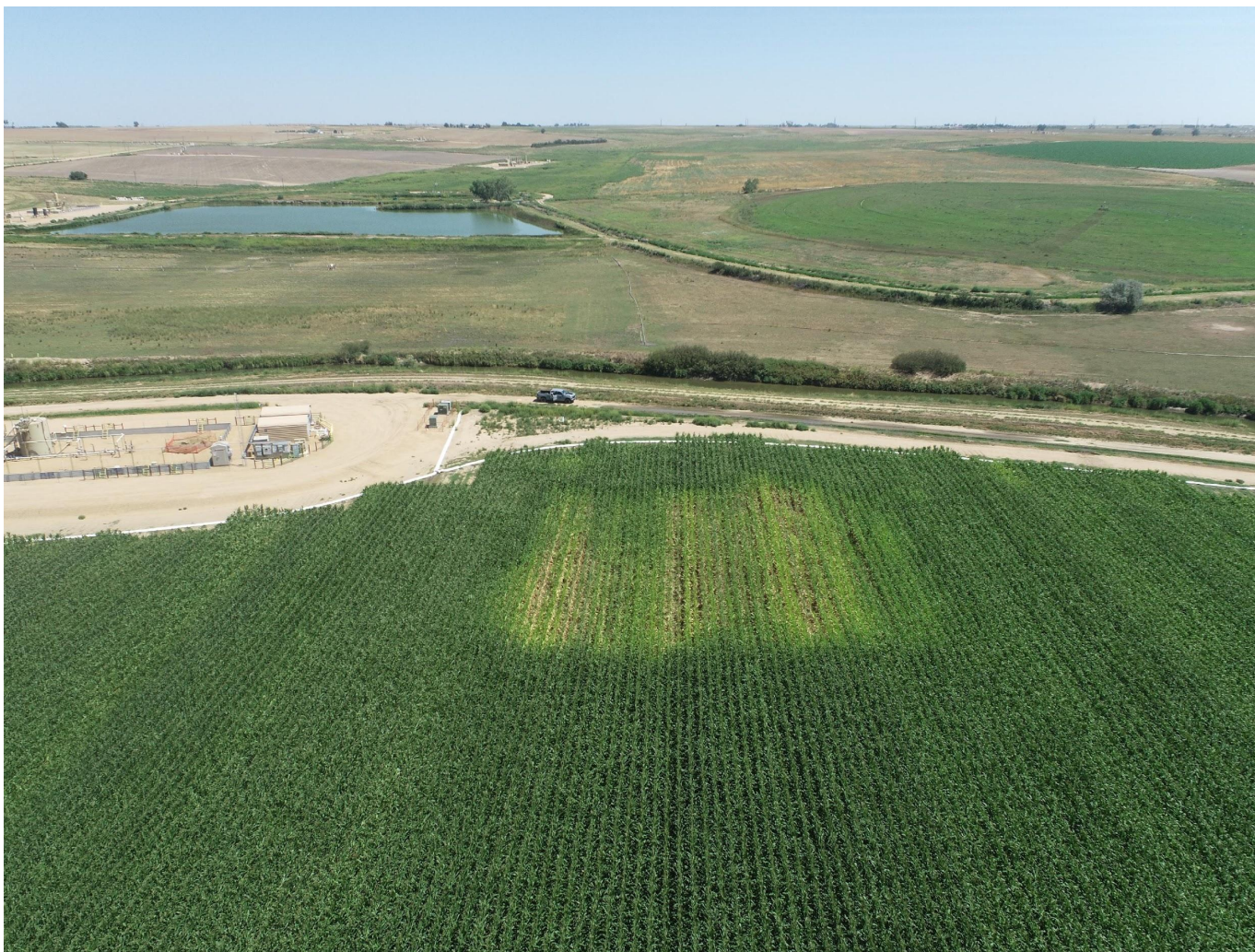
Photo 4. Drone aerial imagery taken west of well location, facing east (displaying the well, well access roads, and presumed flowline).