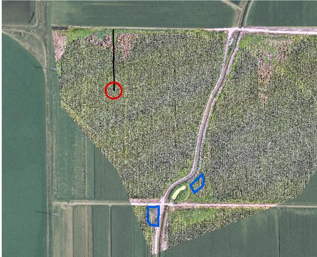
Photo 2. Orthomosaic (drone) imagery taken 8/20/2025 and NAIP aerial imagery (2023) illustrating the well location (red circle) and associated tank battery (blue polygon).