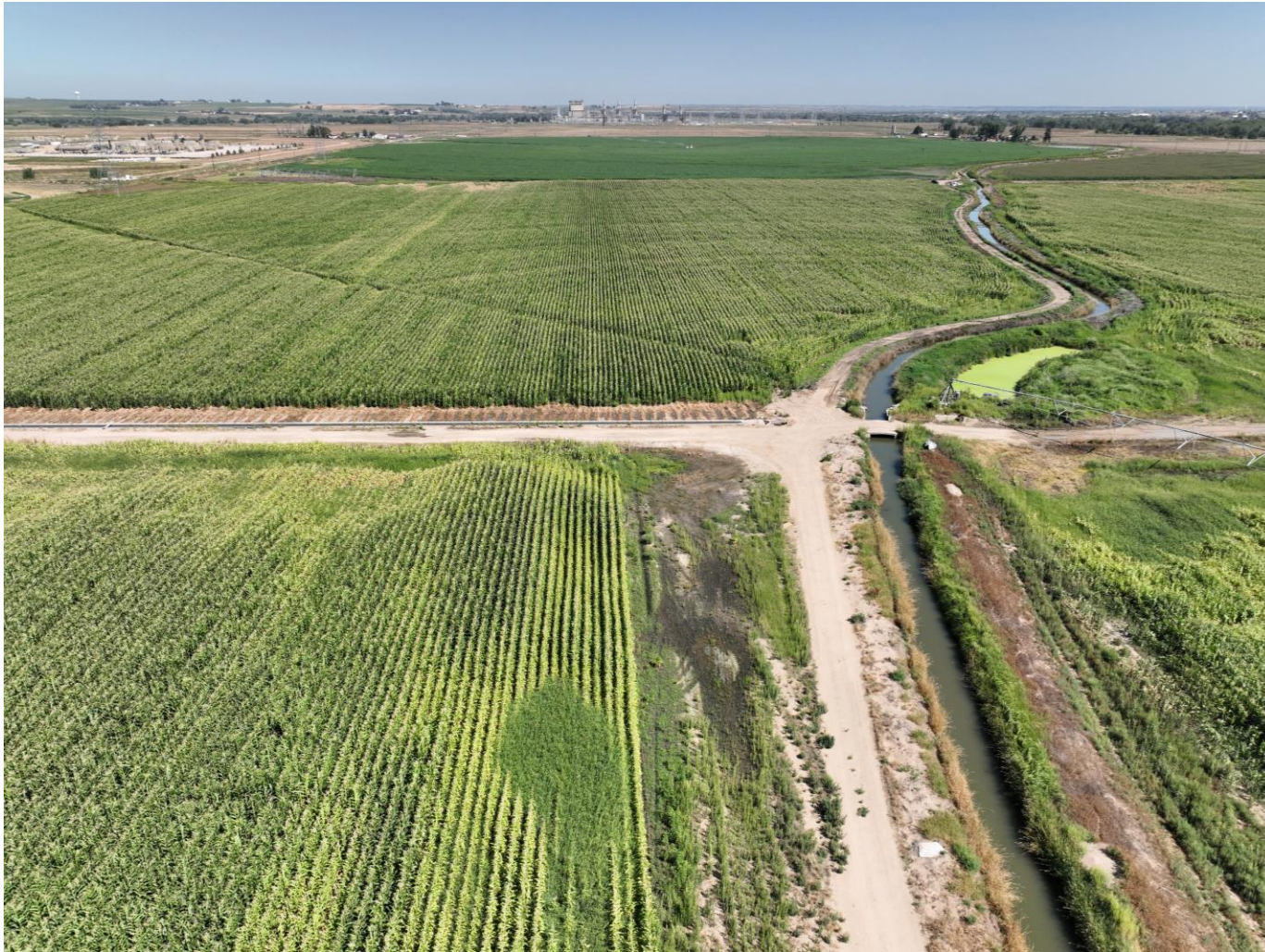
Photo 8. Drone aerial imagery taken south of the TB location, facing north (displaying the TB, well and presumed flowline). Crop establishment issues observed at the well pad, area does not appear consistent with adjacent reference areas.