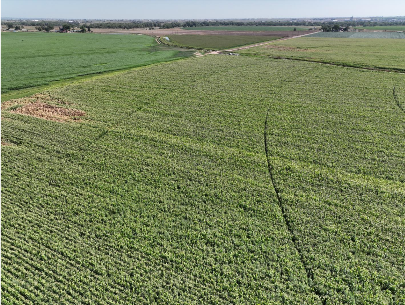
Photo 7. Drone aerial imagery taken northwest of well location, facing southeast (displaying the well, and presumed flowline location).