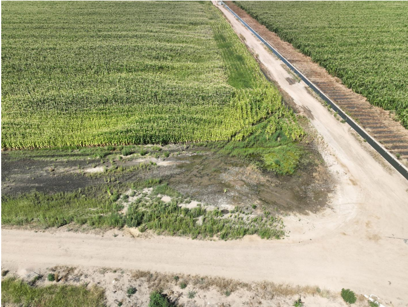
Photo 12. Drone aerial imagery taken east of the TB location, facing west (displaying the TB).