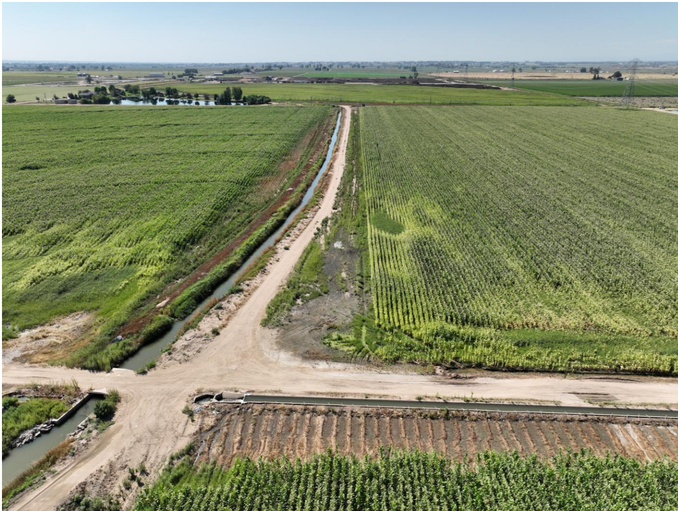
Photo 10. Drone aerial imagery taken north of the TB location, facing south (displaying the TB).