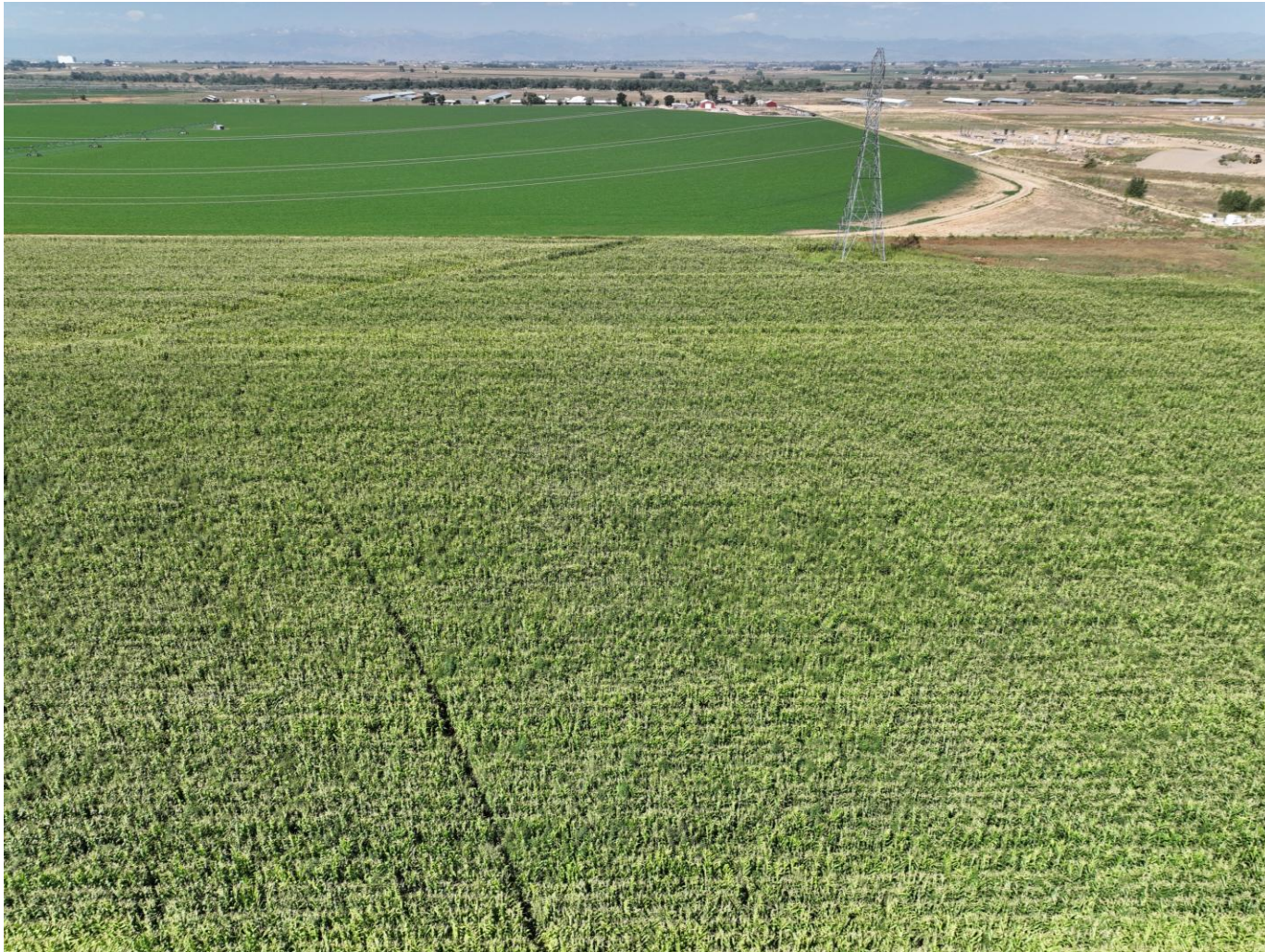
Photo 6. Drone aerial imagery taken east of well location, facing west (displaying the well and access road). Crop vegetation at the well pad and access road appears consistent with adjacent reference areas.