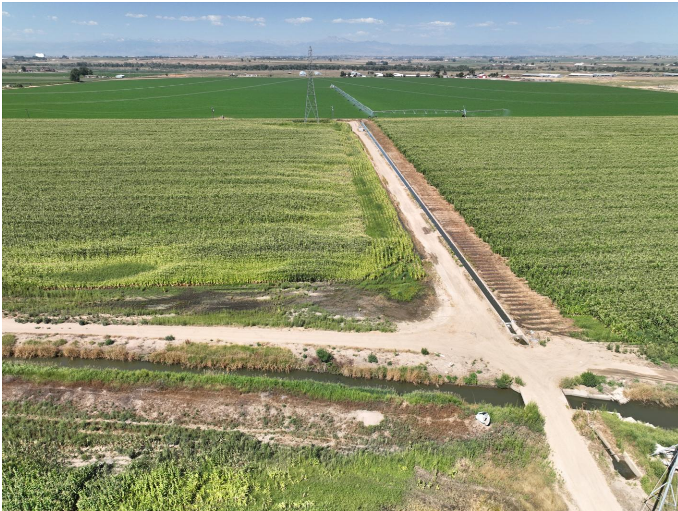
Photo 11. Drone aerial imagery taken east of the TB location, facing west (displaying the TB).