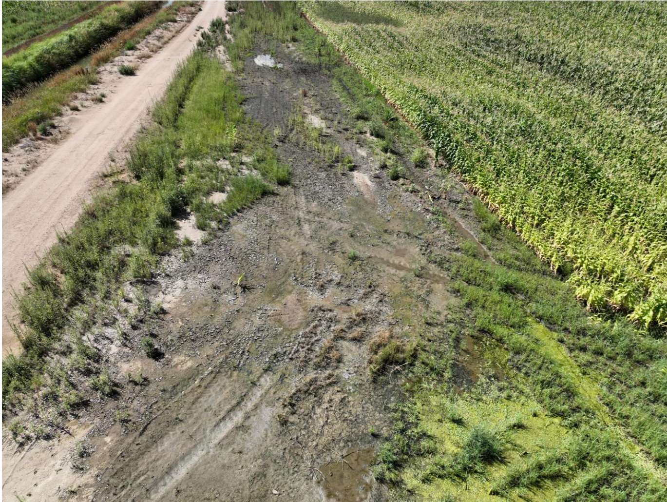
Photo 13. Drone aerial imagery taken from above the TB location, facing downward (displaying stunted corn at the edge of the field).