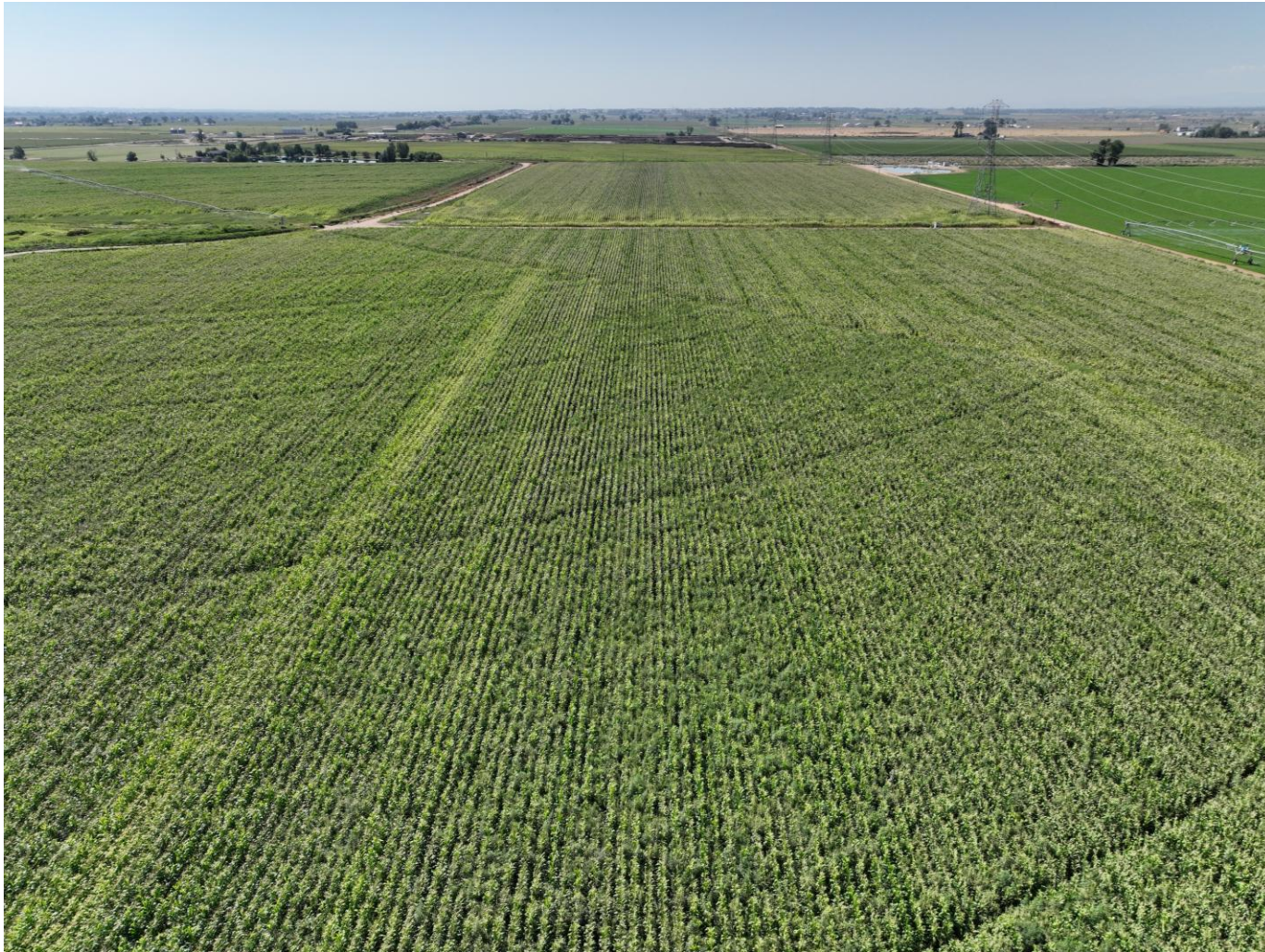
Photo 5. Drone aerial imagery taken north of well location, facing south (displaying the well, TB, access road, and presumed flowline).