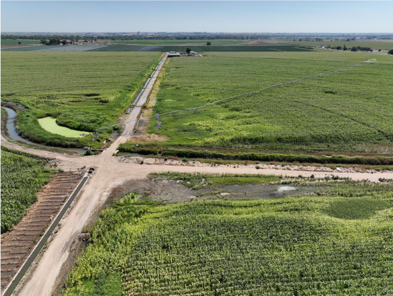
Photo 9. Drone aerial imagery taken west of the TB location, facing east (displaying the TB).