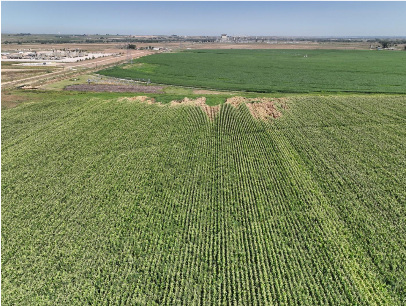
Photo 3. Drone aerial imagery taken south of well location, facing north (displaying the well and access road).