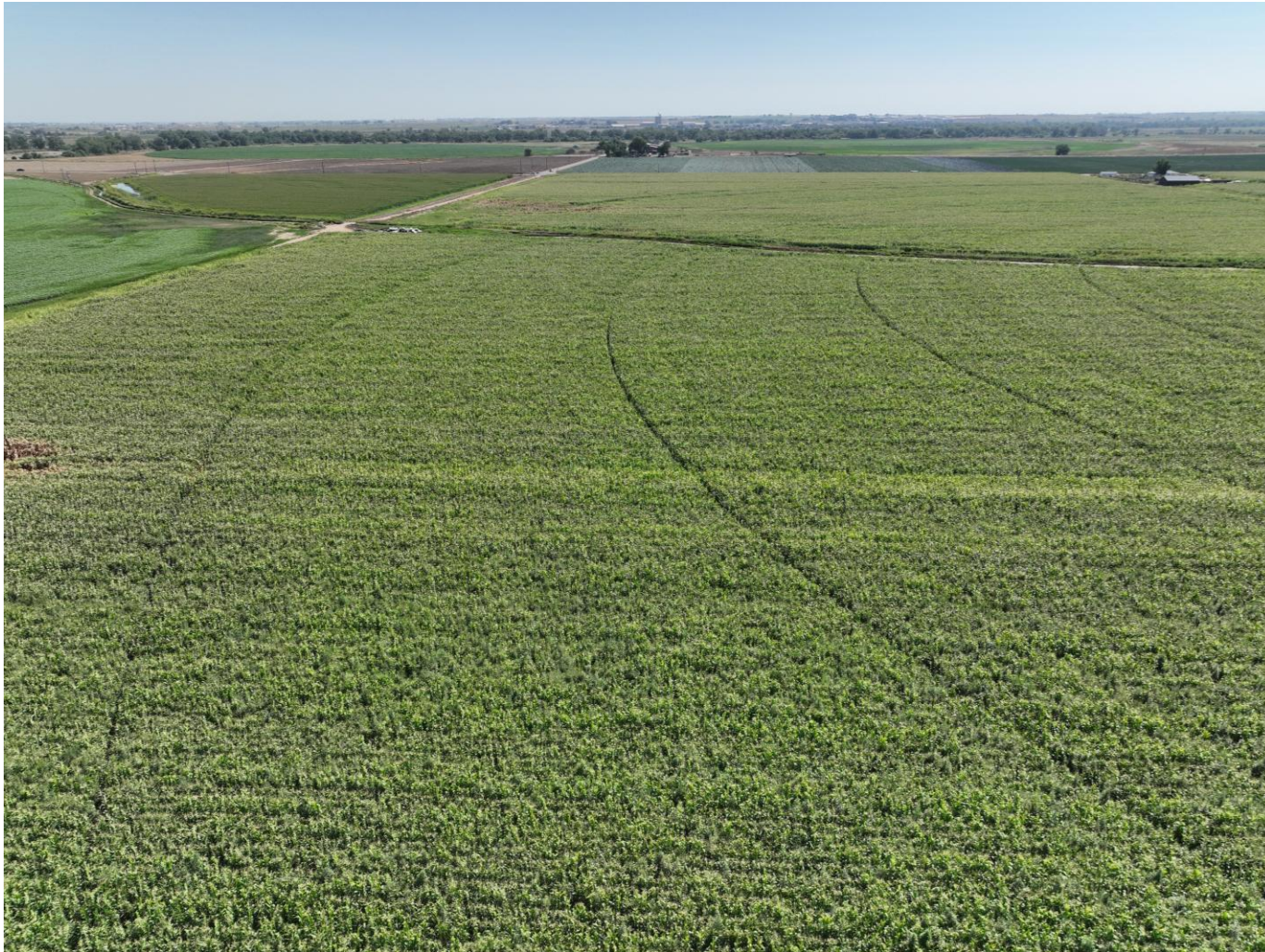
Photo 4. Drone aerial imagery taken west of well location, facing east (displaying the well, access road, and presumed flowline location).