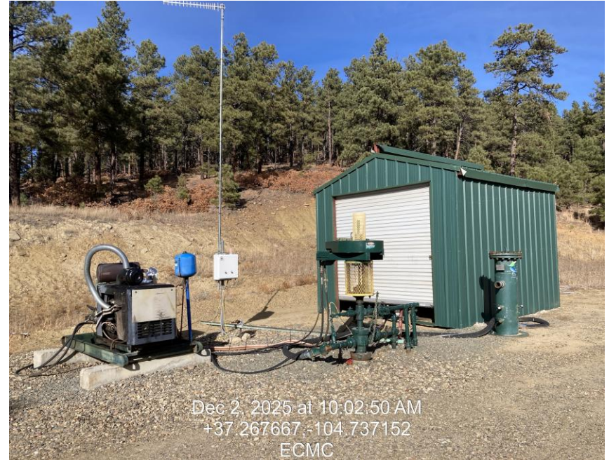
Photo 6 – TR wellhead API: 05-071-08520