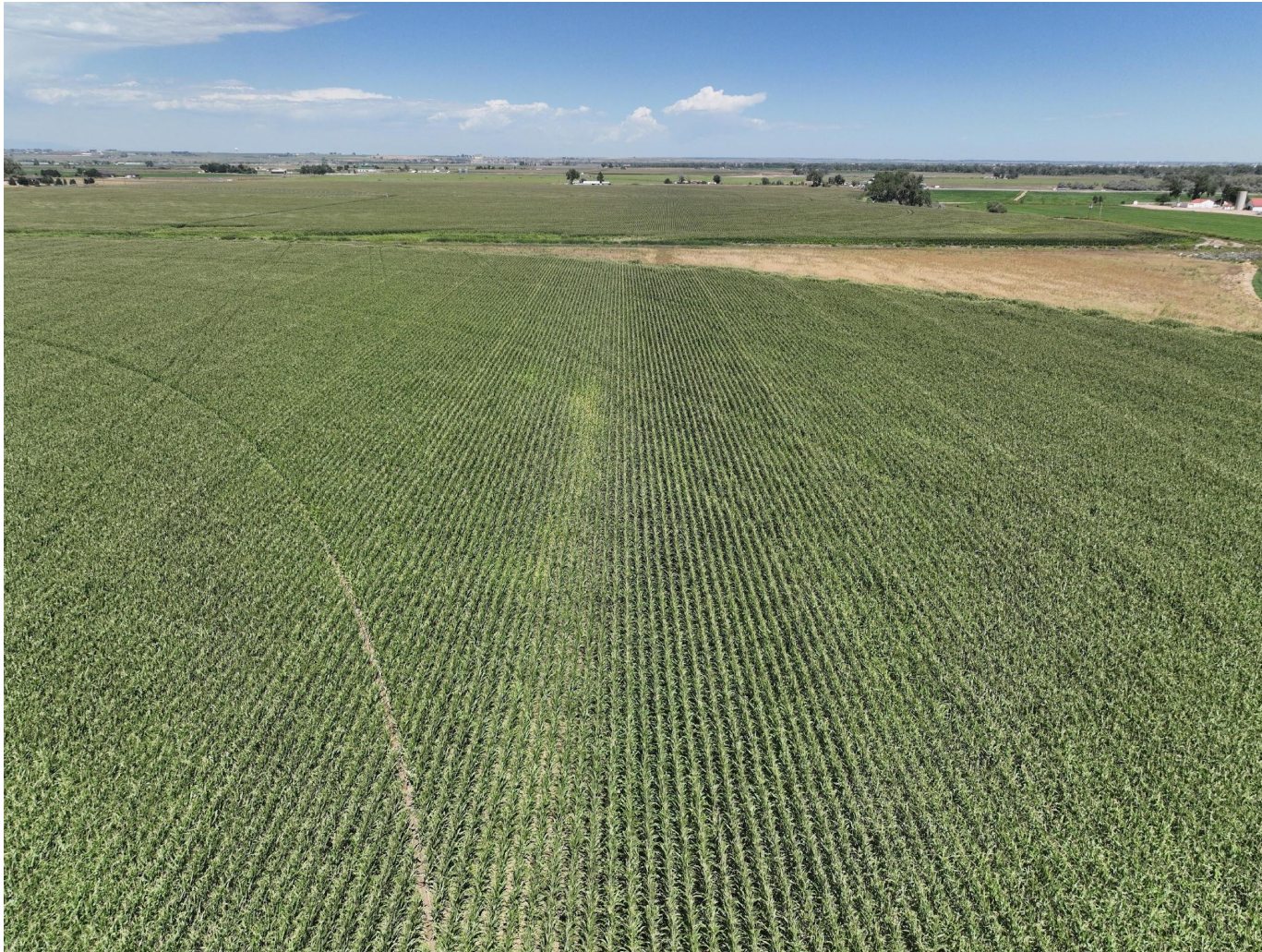
Photo 3. Drone aerial imagery taken south of well location, facing north (displaying the well).