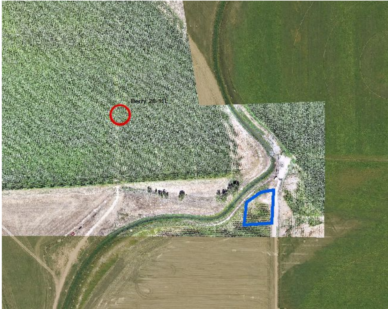
Photo 2. Orthomosaic (drone) imagery taken 8/19/2025 and NAIP aerial imagery (2023) illustrating the well location (red circle) and associated tank battery (blue polygon).