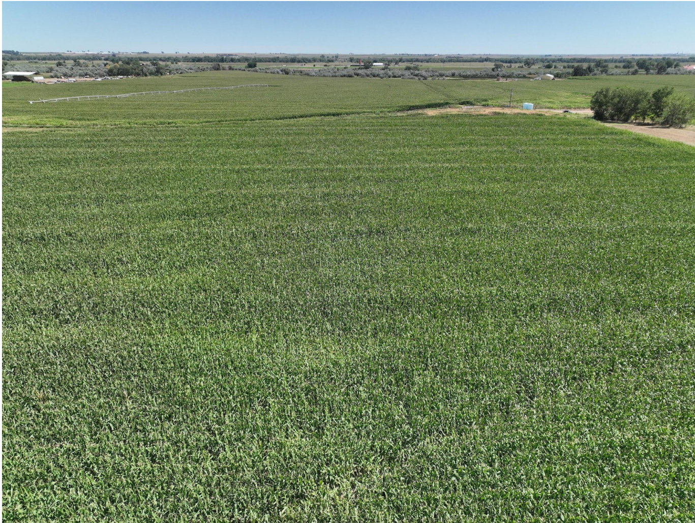
Photo 4. Drone aerial imagery taken west of well location, facing east (displaying the well, presumed flowline, and TB location).