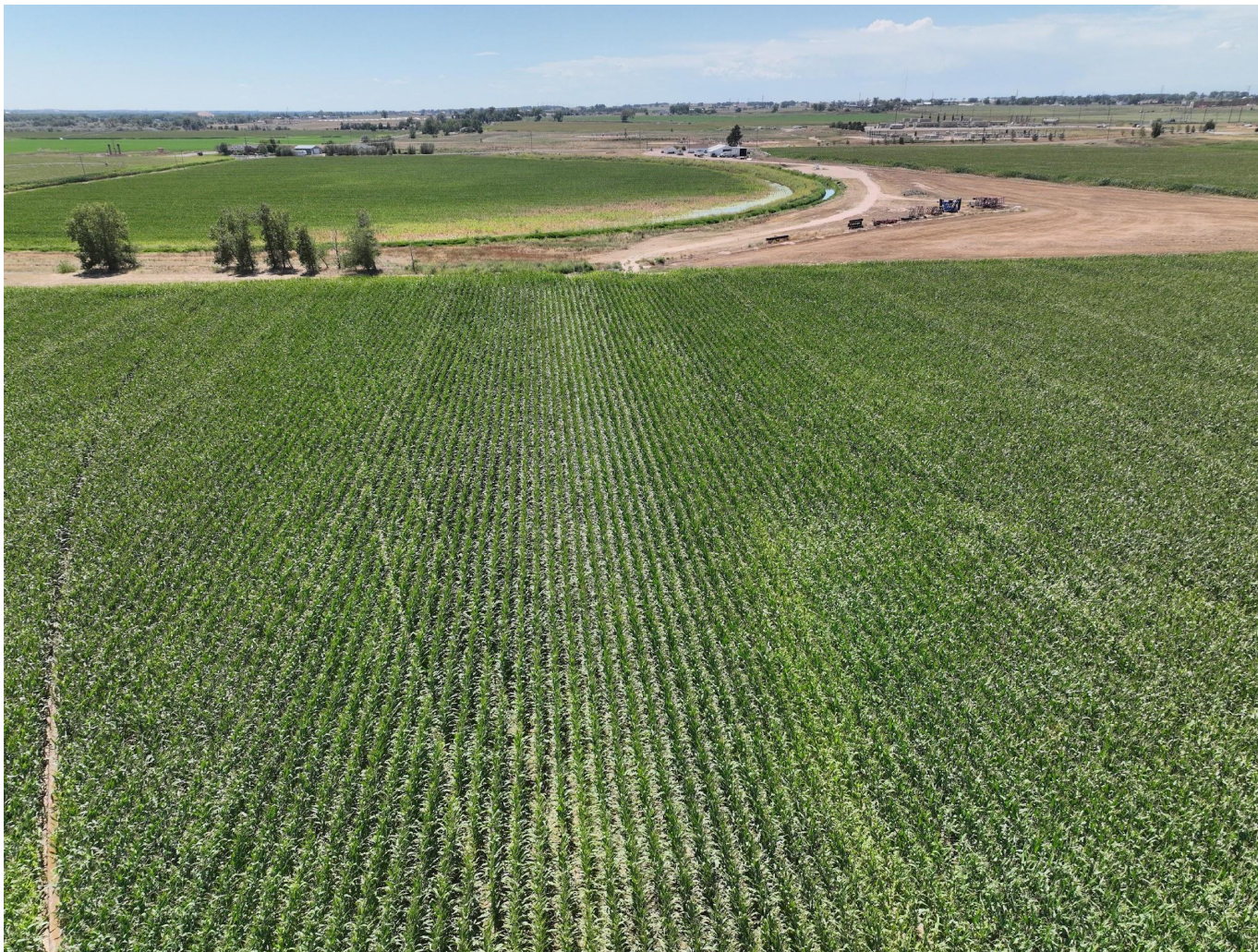
Photo 5. Drone aerial imagery taken north of well location, facing south (displaying the well and access road). Crop vegetation at the well pad and access road appears consistent with adjacent reference areas.