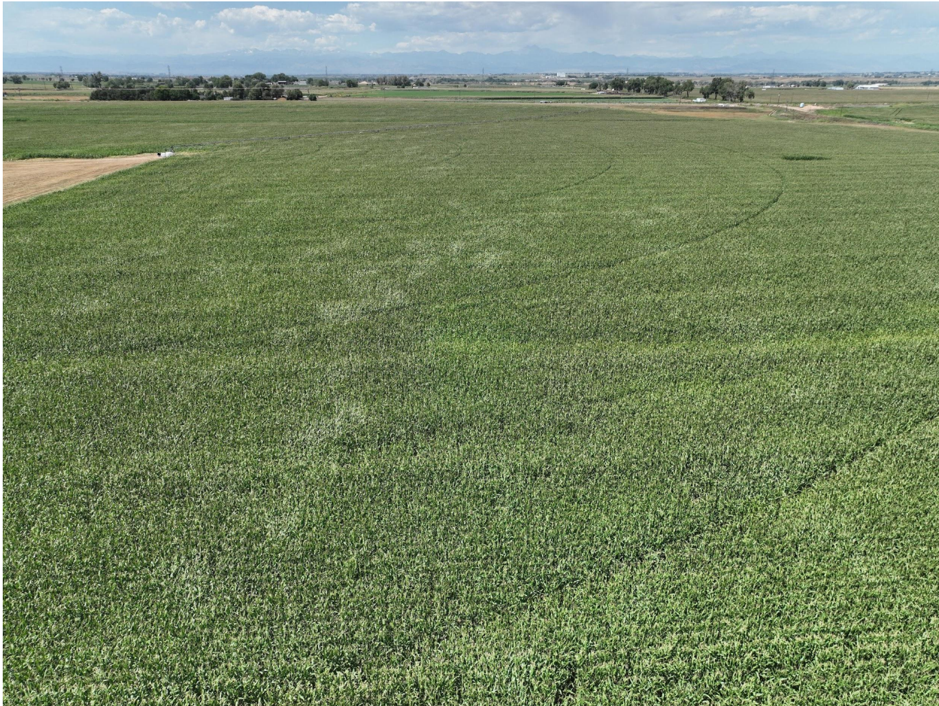
Photo 6. Drone aerial imagery taken east of well location, facing west (displaying the well).