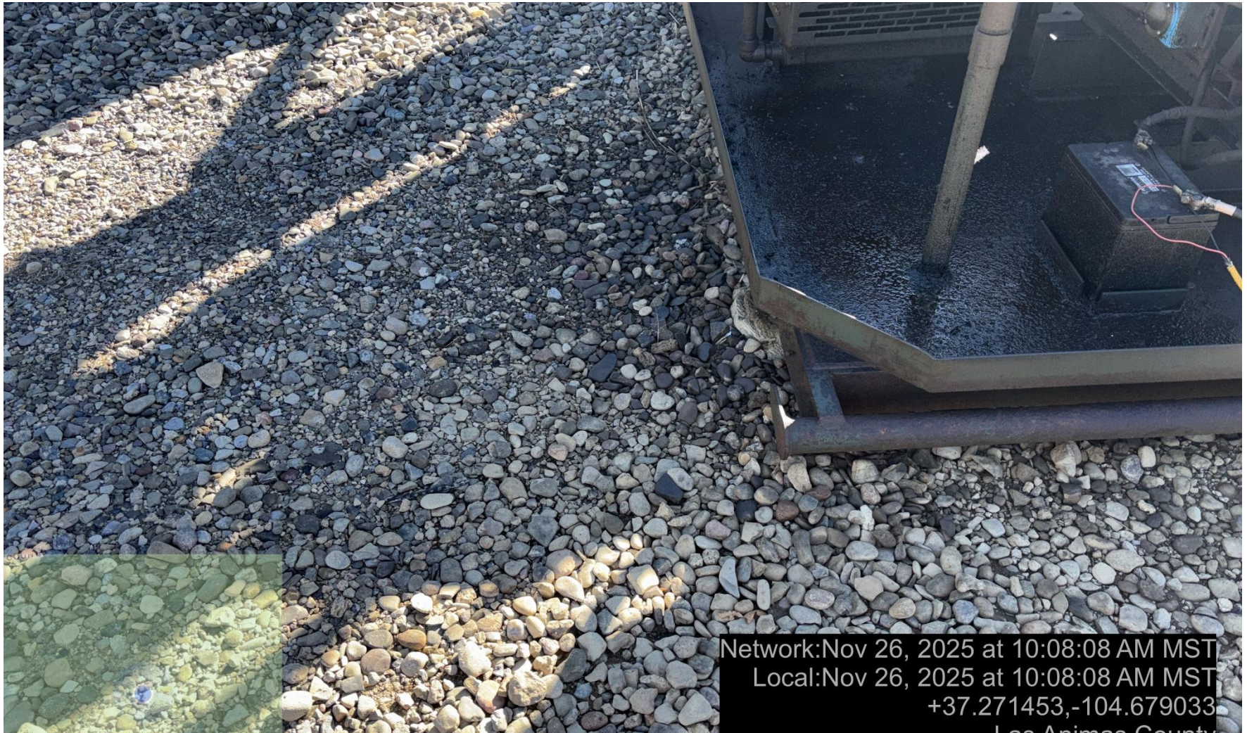
PHOTO 5: AREA OF IMPACTED SOIL AROUND COMPRESSOR SKID. Conduct maintenance on equipment, cleanup stained material and review self inspection processes. COMPLY WITH RULE 1002,(2).D. CA DATE 12-3-2025.