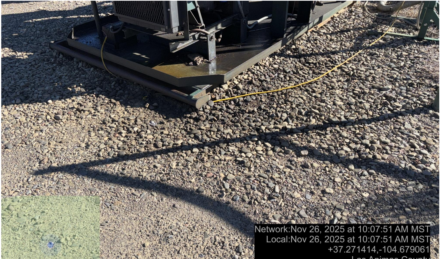
PHOTO 4: AREA OF IMPACTED SOIL AROUND COMPRESSOR SKID. Conduct maintenance on equipment, cleanup stained material and review self inspection processes. COMPLY WITH RULE 1002,(2).D. CA DATE 12-3-2025.