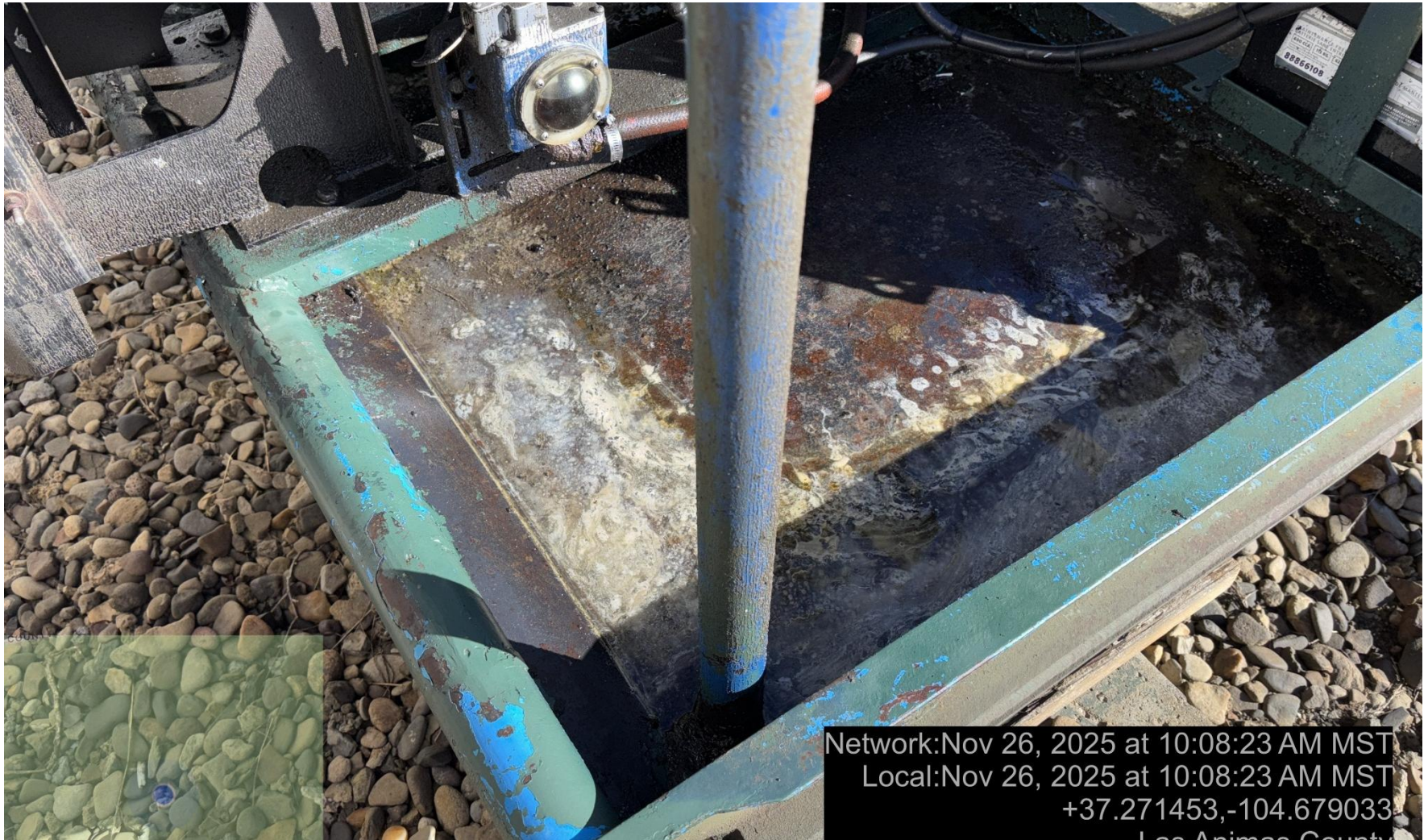
PHOTO 7: OILY WASTE IN ORIG. WELL PRIME MOVER SKID. DRAIN OILY WASTE REPAIR ALL LEAKS AND REMOVE IMPACTED SOIL PER RULE 1002..(2).D & 1002.f.(2)B, Comply with general provisions of the oil and gas act for wildlife protection AND SB-181. CA DATE 11-27-2025.