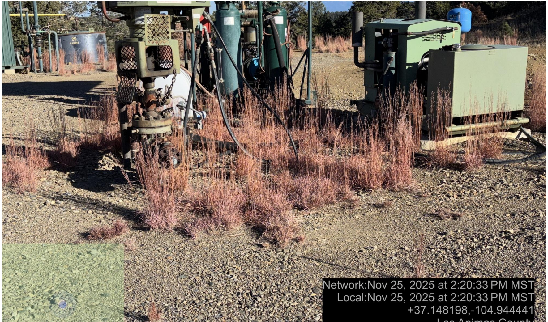
PHOTO 4: WEEDS NOT MAINTAINED NEAR WELLHEAD AND METER HOUSE. MAINTAIN WEEDS PER FULE 606. CA DATE 12-8-2025.