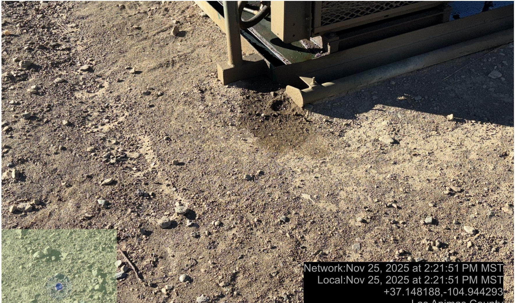
PHOTO 5: AREA OF IMPACTED SOIL NEAR COMPRESSOR SKID. Conduct maintenance on equipment, cleanup stained material and review self inspection processes. COMPLY WITH RULE 1002,(2).D. THIS IS THE 2 ND NOTICE FOR THIS CA, IMMEDIATE ACTION IS REQUIRED.