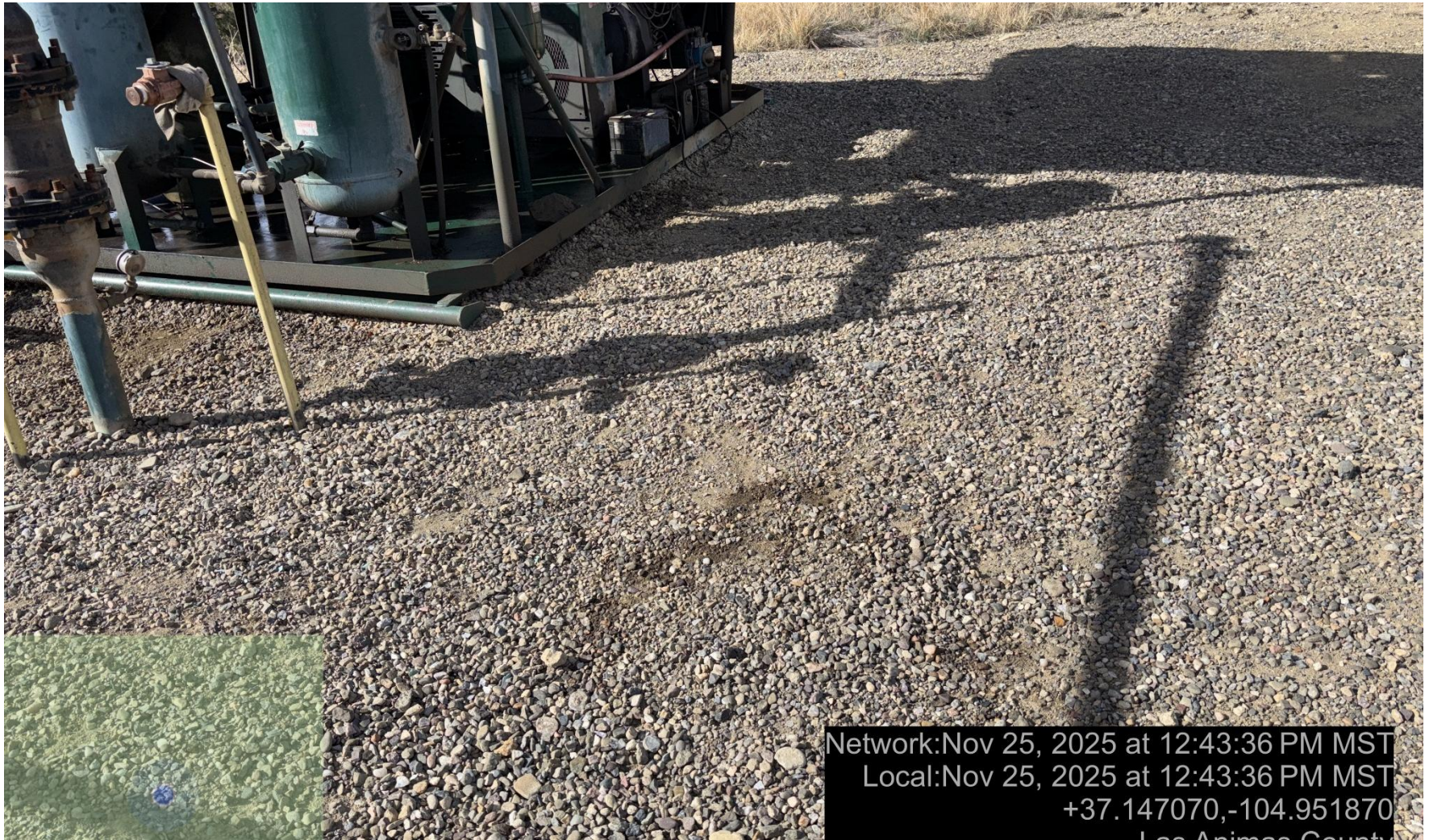
PHOTO 5: Impacted soil identified near compressor skid. Conduct maintenance on equipment, cleanup stained material and review self inspection processes. COMPLY WITH RULE 1002,(2).D. this is the 2 nd notice for this corrective action, immediate action is required.