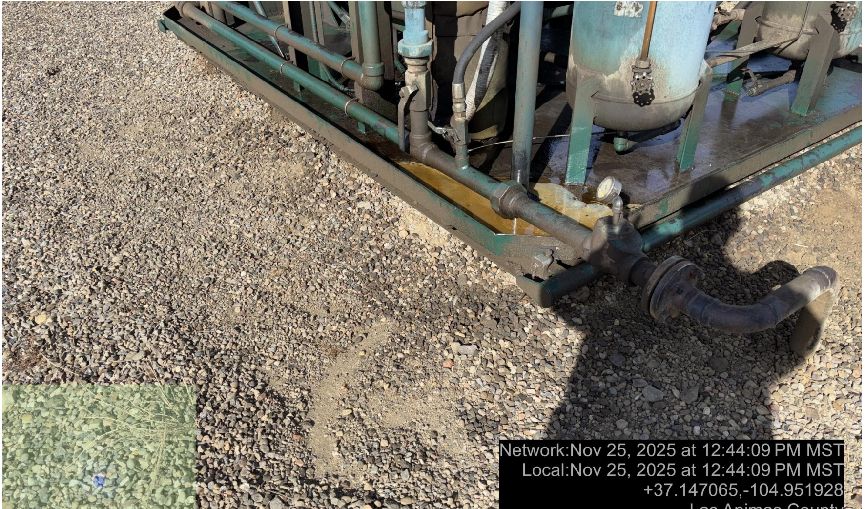
PHOTO 6: Impacted soil identified near compressor skid. Conduct maintenance on equipment, cleanup stained material and review self inspection processes. COMPLY WITH RULE 1002,(2).D. this is the 2 nd notice for this corrective action, immediate action is required.