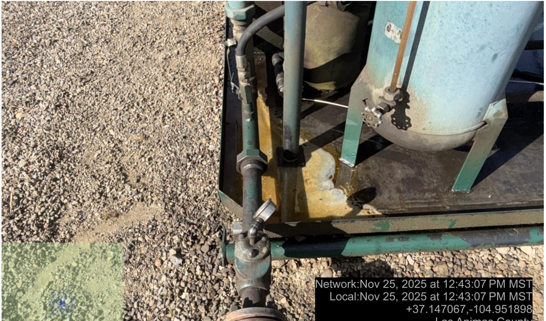
PHOTO 7: OILY WASTE IN COMPRESSOR SKID. DRAIN OILY WASTE REPAIR ALL LEAKS AND REMOVE IMPACTED SOIL PER RULE 1002..(2).D & 1002.f.(2)B, Comply with general provisions of the oil and gas act for wildlife protection AND SB-181. CA DATE 11-26-2025.