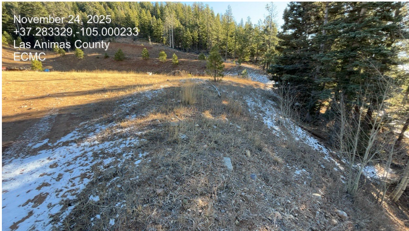
Photo 4. Facing southeast along the fill slope.