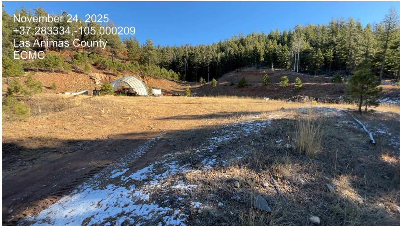
Photo 3. Facing northeast toward the location. The location is being used for storage by the surface owner.