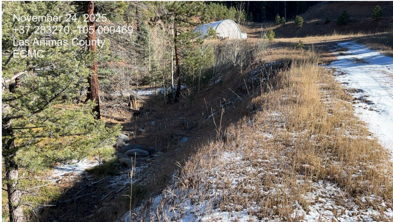
Photo 2. Facing along the access road near the location. The vegetation is well established along the roadside and the culvert is maintained in good condition.