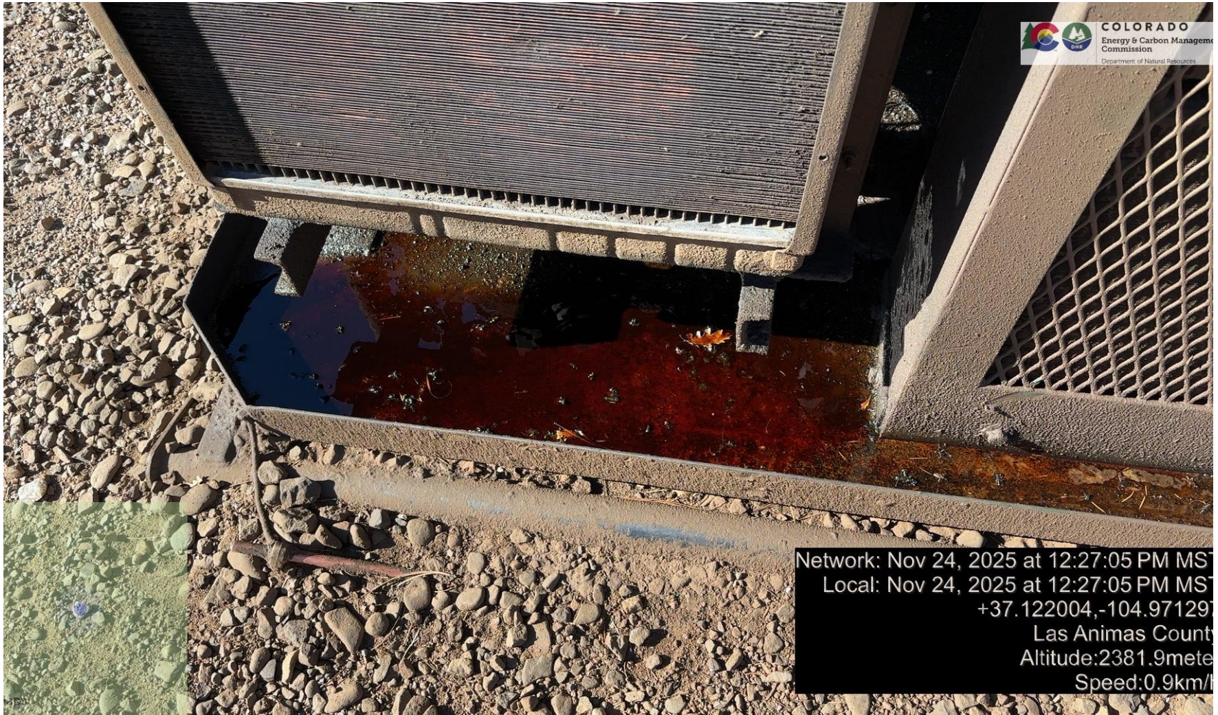
PHOTO 5: OILY WASTE IN COMPRESSOR SKID FROM LEAKING EQUIPMENT. DRAIN OILY WASTE REPAIR ALL LEAKS AND REMOVE IMPACTED SOIL PER RULE 1002..(2).D & 1002.f.(2)B, Comply with general provisions of the oil and gas act for wildlife protection AND SB-181. CA DATE 24 HOURS REMOVE OILY WASTE, FIX LEAKS BY 12-28-2025.