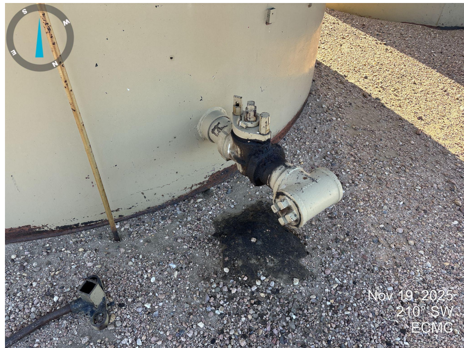
Photo 8. Fitting on the eastern tank appears to be leaking. Stained soil is present beneath the valve.