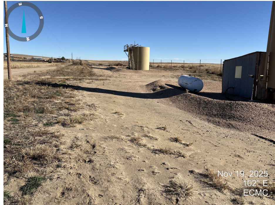
Photo 6. Looking east across the north side of the tank battery location. See photo 5 comments.