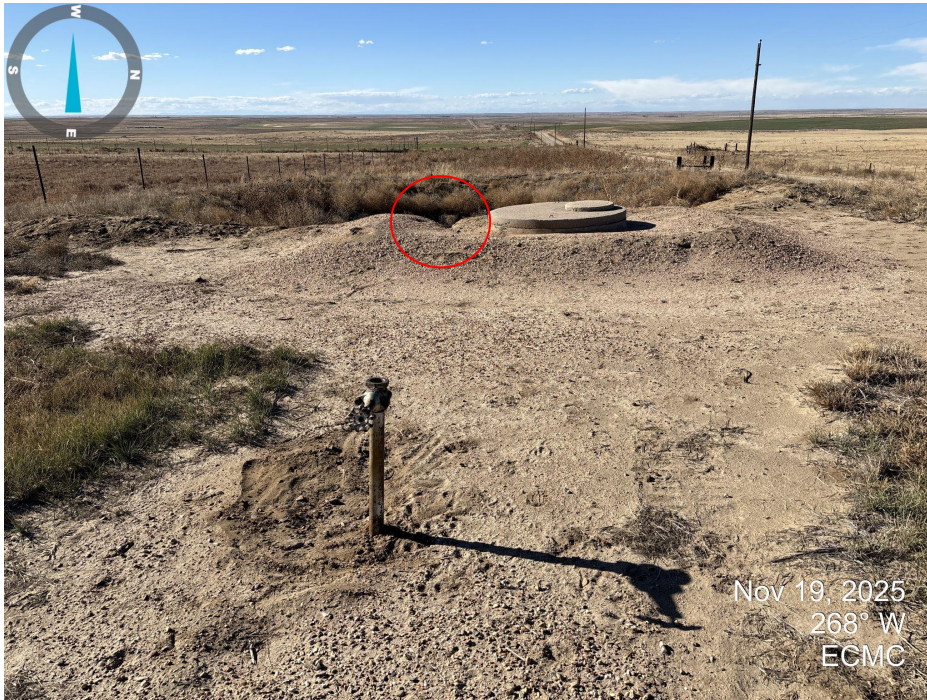
Photo 3. Looking west across the east side of the location near the evaporation pit. Secondary containment berm around partially buried concrete vessel appears to be compromised and shows signs of stormwater erosion (red circle).