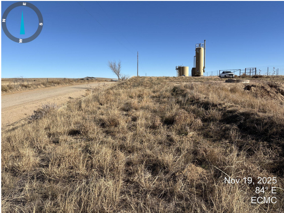
Photo 5. Looking east across the north side of the tank battery location. Vegetation on the location is mowed at the time of location. Some desirable perennial vegetation is present in the interim area. Undesirable weeds such as kochia and russian thistle are also present in the interim area.