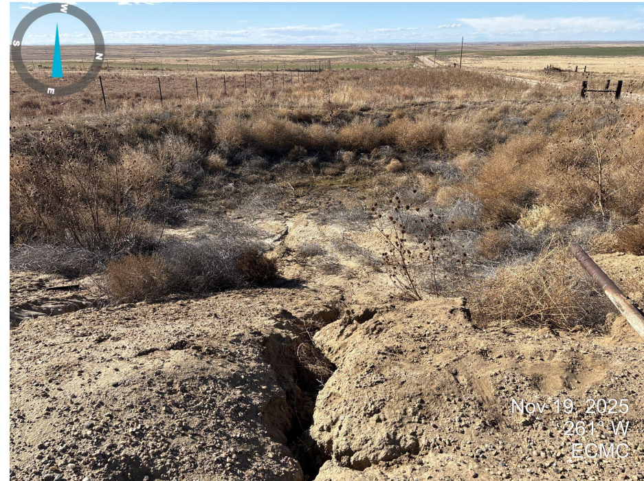
Photo 4. Picture taken looking across the evaporation pit. Stormwater erosion is present in the secondary containment berm near the partially buried vessel. Undesirable weeds such as kochia and russian thistle are present in and around the pit.