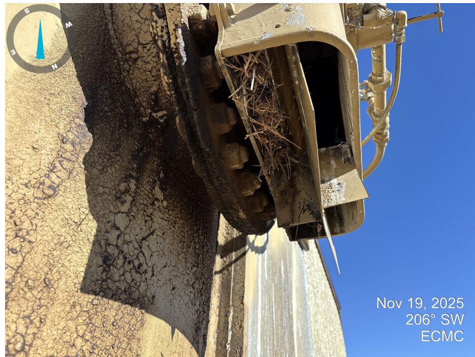
Photo 2. Appears that nest material/ debris is present in a separator opening.