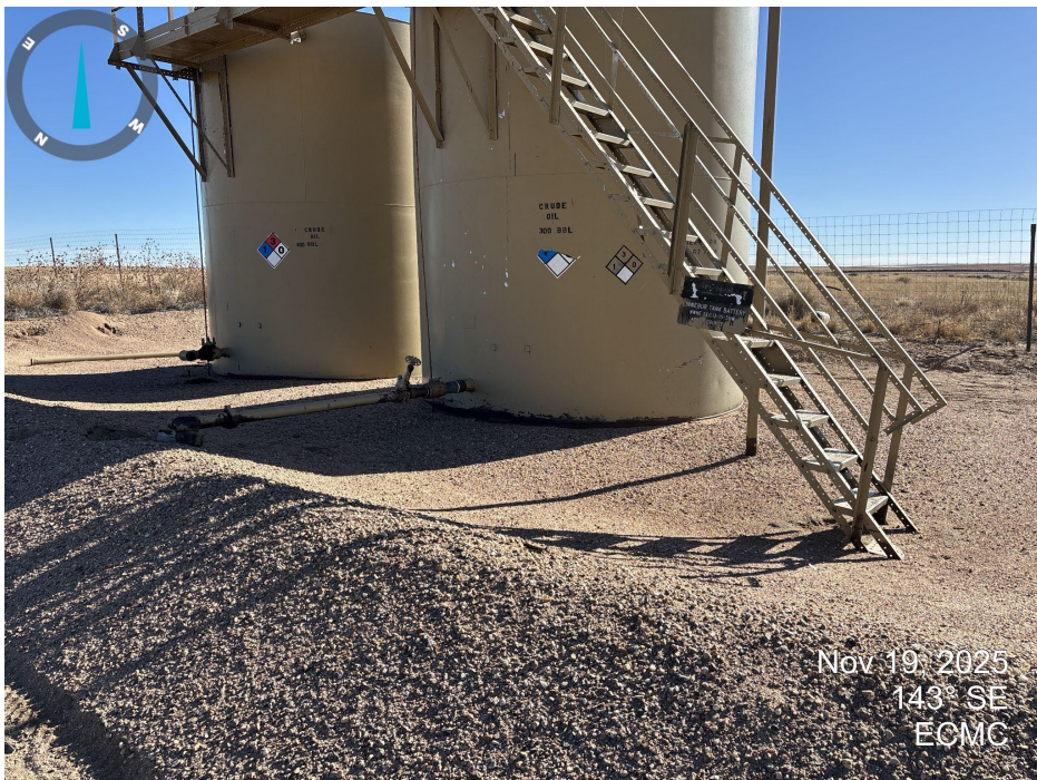
Photo 7. Looking south at the tank battery. Tank battery sign is inadequate.