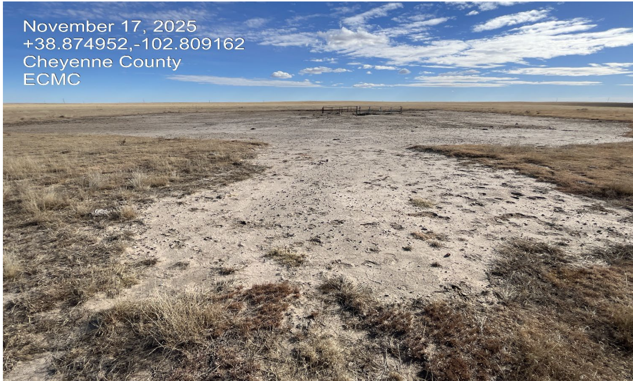
Photo 4. Northwest corner of the location facing southeast. It is suspected that there are impacted soils further out from the plugged well.