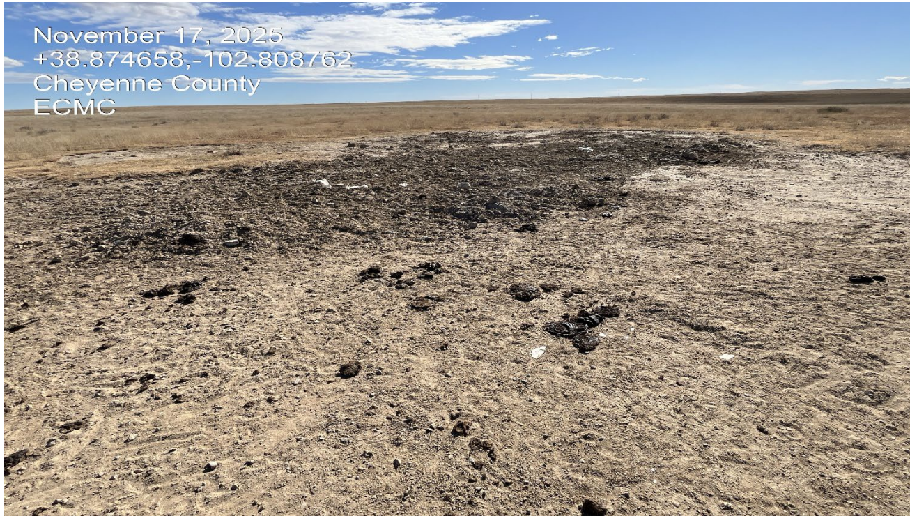
Photo 5. Facing toward southeast side of the location. The excavated impacted material was placed on a piece of plastic with no containment and some of the material has fallen outside of the liner. The pile was removed but it does appear some impacted soil remains in this area.