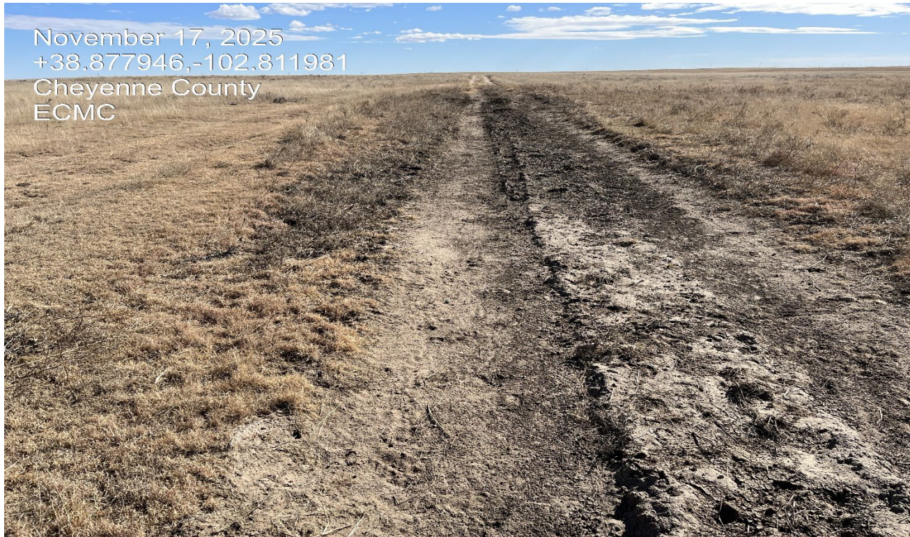
Photo 1. Facing southeast toward the access road. The access road is impassible due to stormwater accumulating along the road. Since the well has been PA'd the road will need to be decompacted, regraded, and reclaimed.