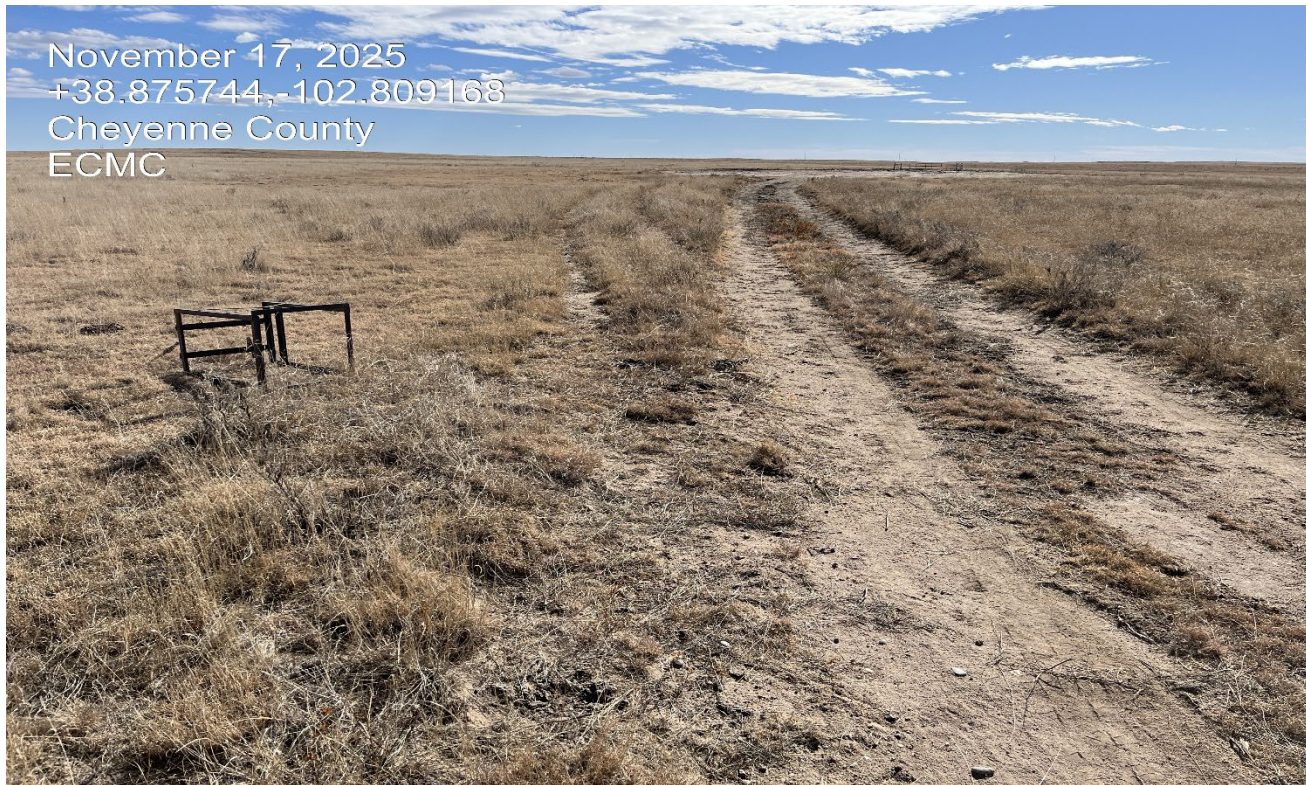
Photo 2. Facing southeast along the access road. There is a metal stand that was left on the roadside.