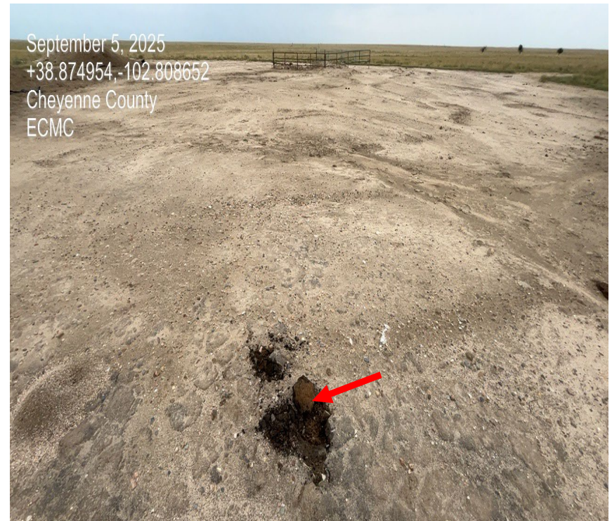
Photo 6. East side of the location facing southwest. There are blacked stained soils at the east side of the location. This does not appear to be suitable soil for reclamation.