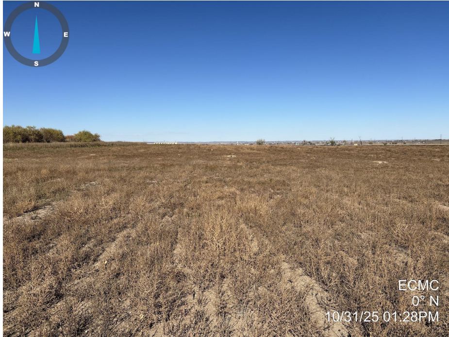
Photo 1. Photo taken of the well location, facing north. Photo illustrates that final reclamation activities have taken place. However, vegetation has not established to Rule 1004 standards and the location appears to be within fallow cropland.