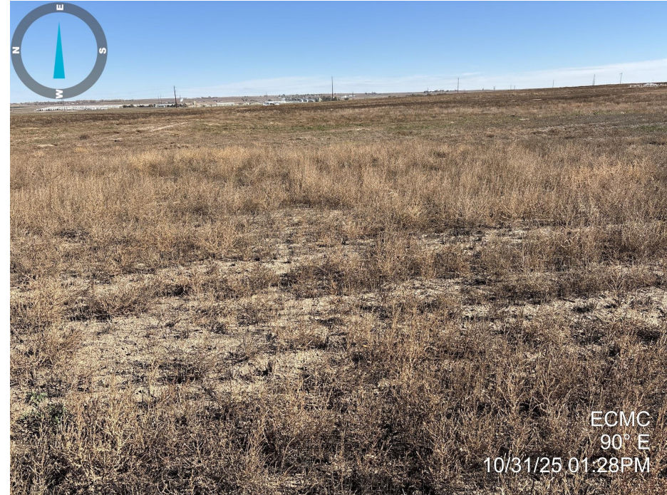
Photo 2. Photo taken of the well location, facing east. See comments under Photo 1.