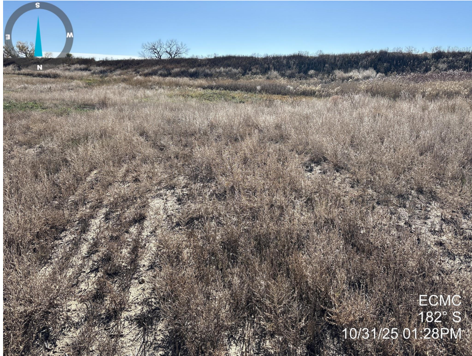
Photo 3. Photo taken of the well location, facing south. See comments under Photo 1.