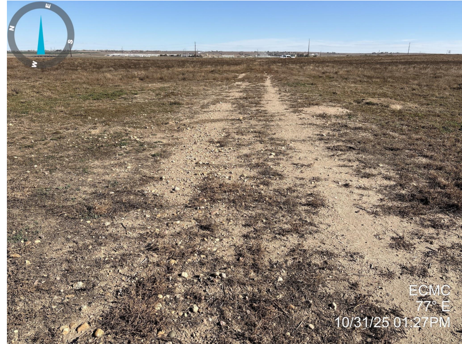
Photo 6. Photo taken of the access road the well location, facing east. Photo illustrates that the access road does not meet Rule 1004 standards as gravel, bare ground, and weedy annual vegetation were observed across the road.