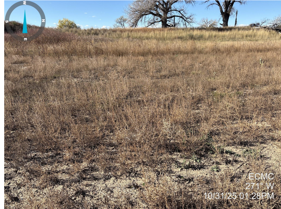
Photo 4. Photo taken of the well location, facing west. See comments under Photo 1.