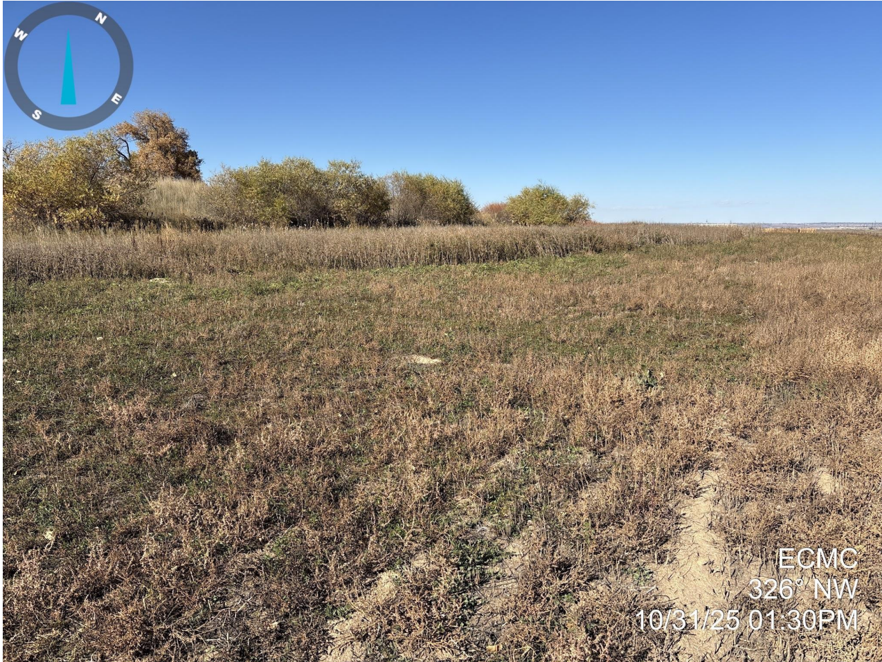
Photo 7. Photo taken of the reference area to the location, north of the location, facing northwest. Photo illustrates weedy annual vegetation and appears to be fallow cropland.