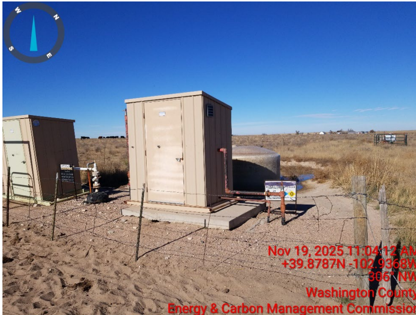
3. Metal sheds and fiberglass tank