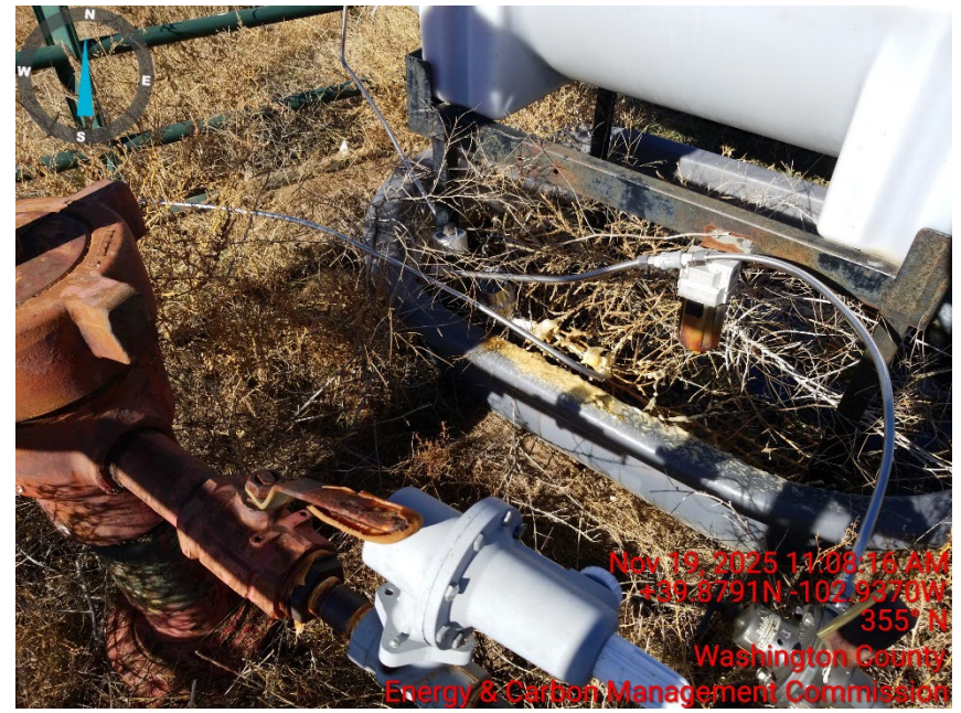
1. Wellhead and chemical tank