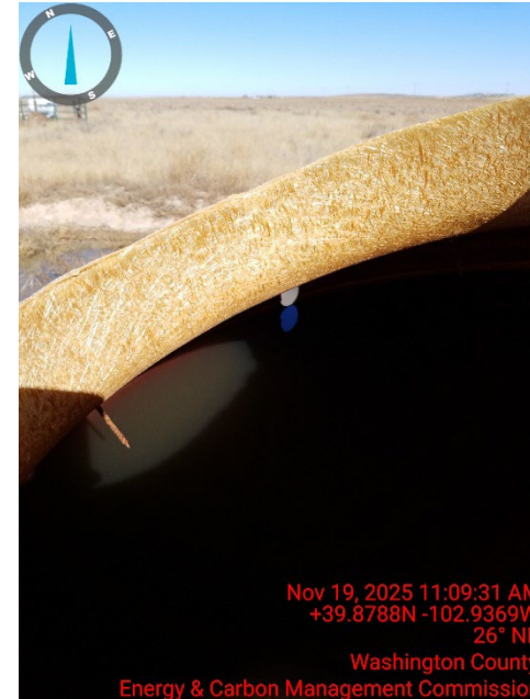
4. Water level in fiberglass tank is up to the inlet