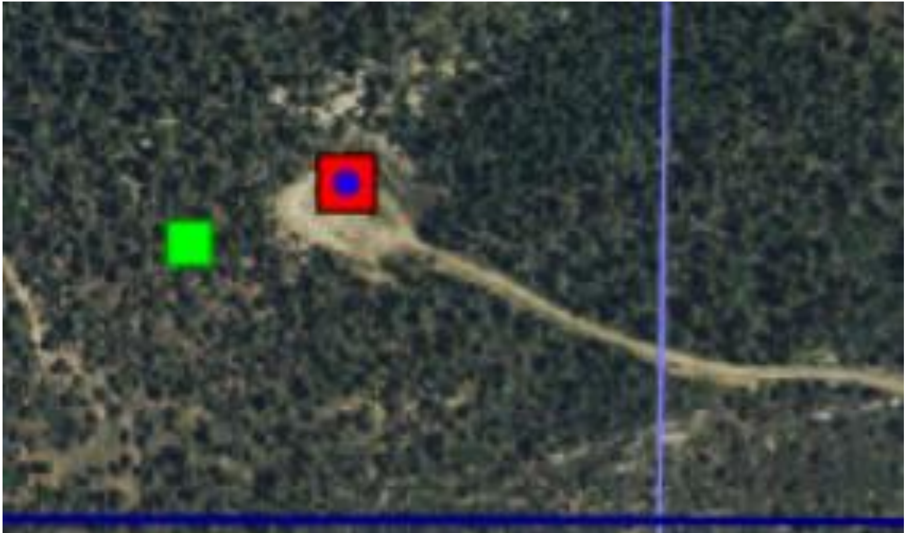
PHOTO 3: PIT COORDINATES ARE INACCURATE. SUBMIT FORM 15 PER RULE 909a.(2). CA DATE 12-1-2025.