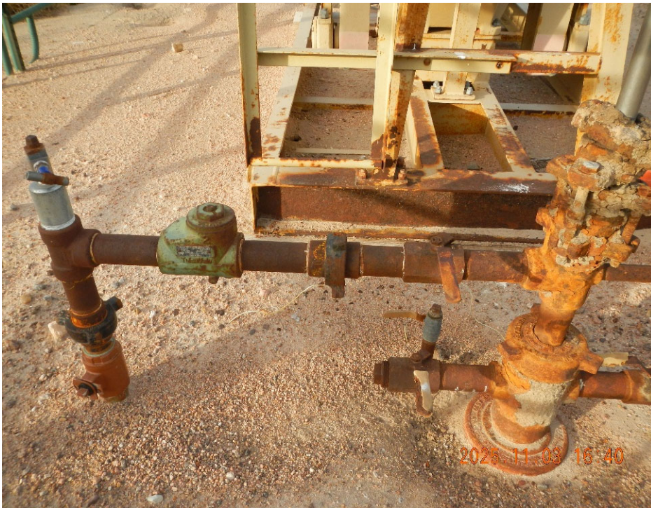
3. View of wellhead.