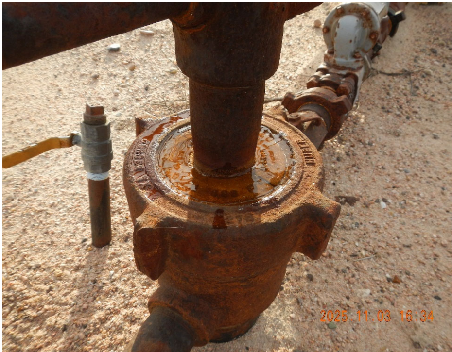
3. View of wellhead.