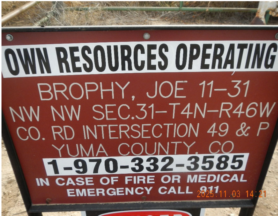
3. Lease sign at gathering location.