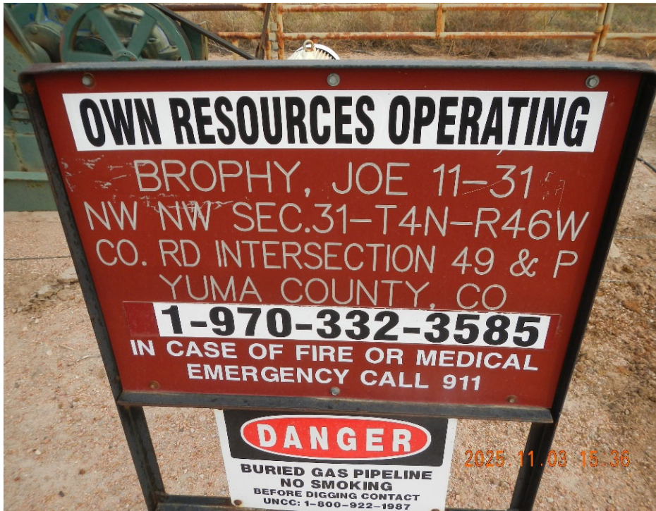
1. Lease sign at well location.