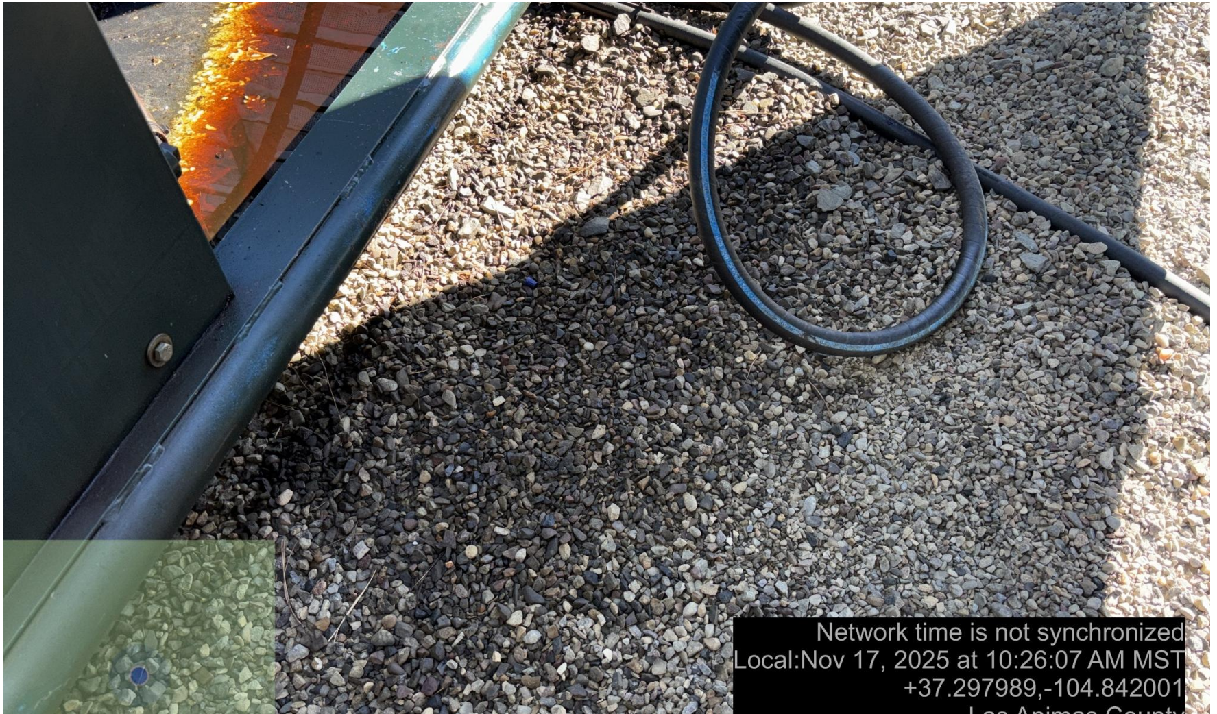
PHOTO 5: AREA OF IMPACTED SOIL NEAR COMPRESSOR. Conduct maintenance on equipment, cleanup stained material and review self inspection processes. COMPLY WITH RULE 1002,,(2).D.