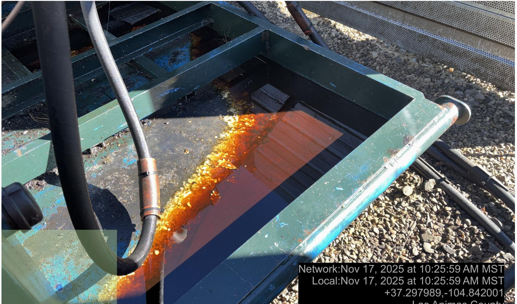
PHOTO 6: OILY WASTE IN PRIME MOVER SKID. DRAIN OILY WASTE REPAIR ALL LEAKS AND REMOVE IMPACTED SOIL PER RULE 1002.(2), D & 1002.f.(2)B, Comply with general provisions of the oil and gas act for wildlife protection AND SB-181 CA DATE 11-18-2025.