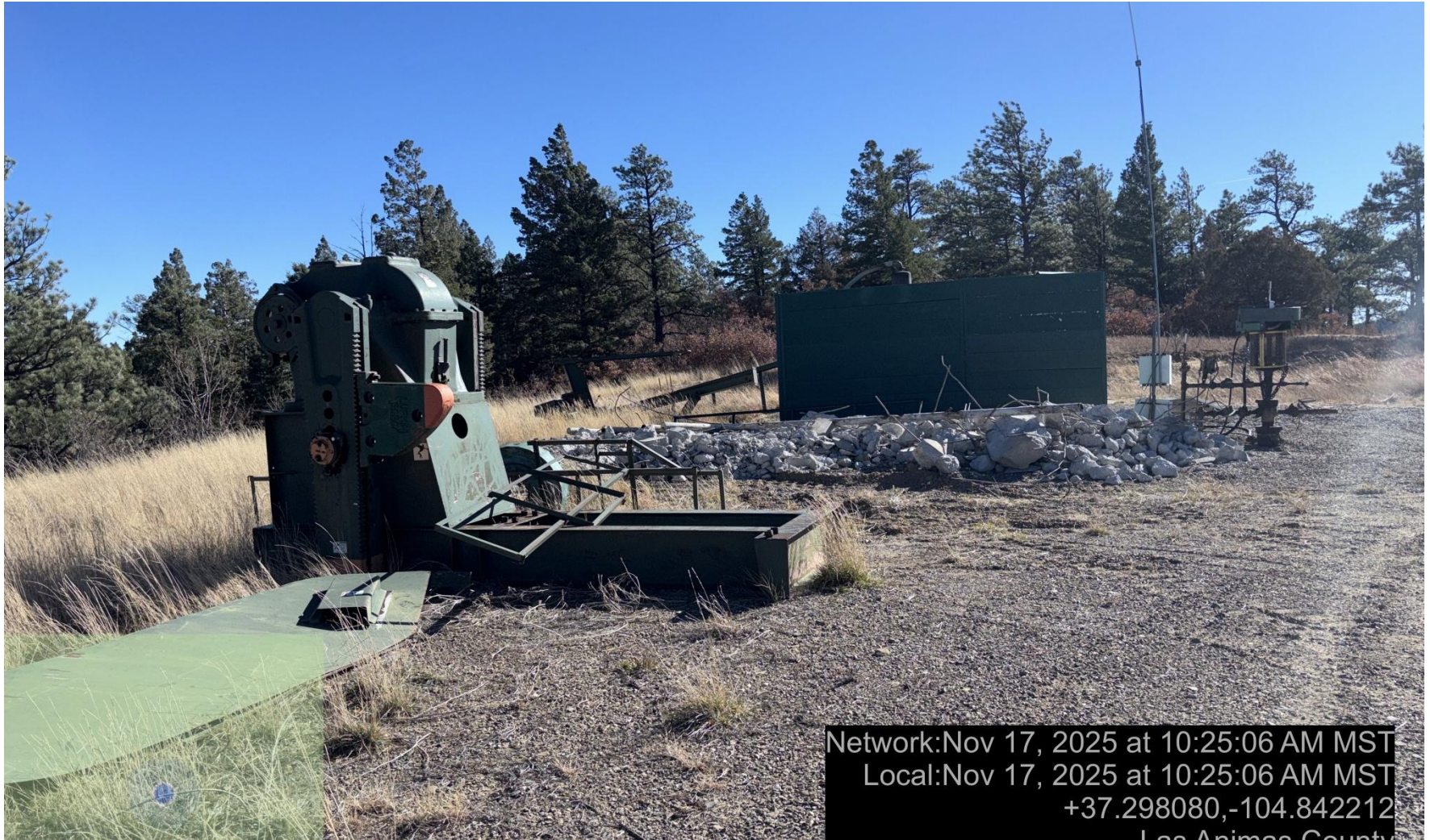
PHOTO 3: UNUSED EQUIPMENT (PUMPJACK AND ALL ITS COMPONENTS INCLUDING CEMENT PAD). REMOVE UNUSED EQUIPMENT PER RULE 606. THIS IS THE 2 ND NOTICE FOR THIS CA IMMEDIATE ACTION IS REQUIRED.