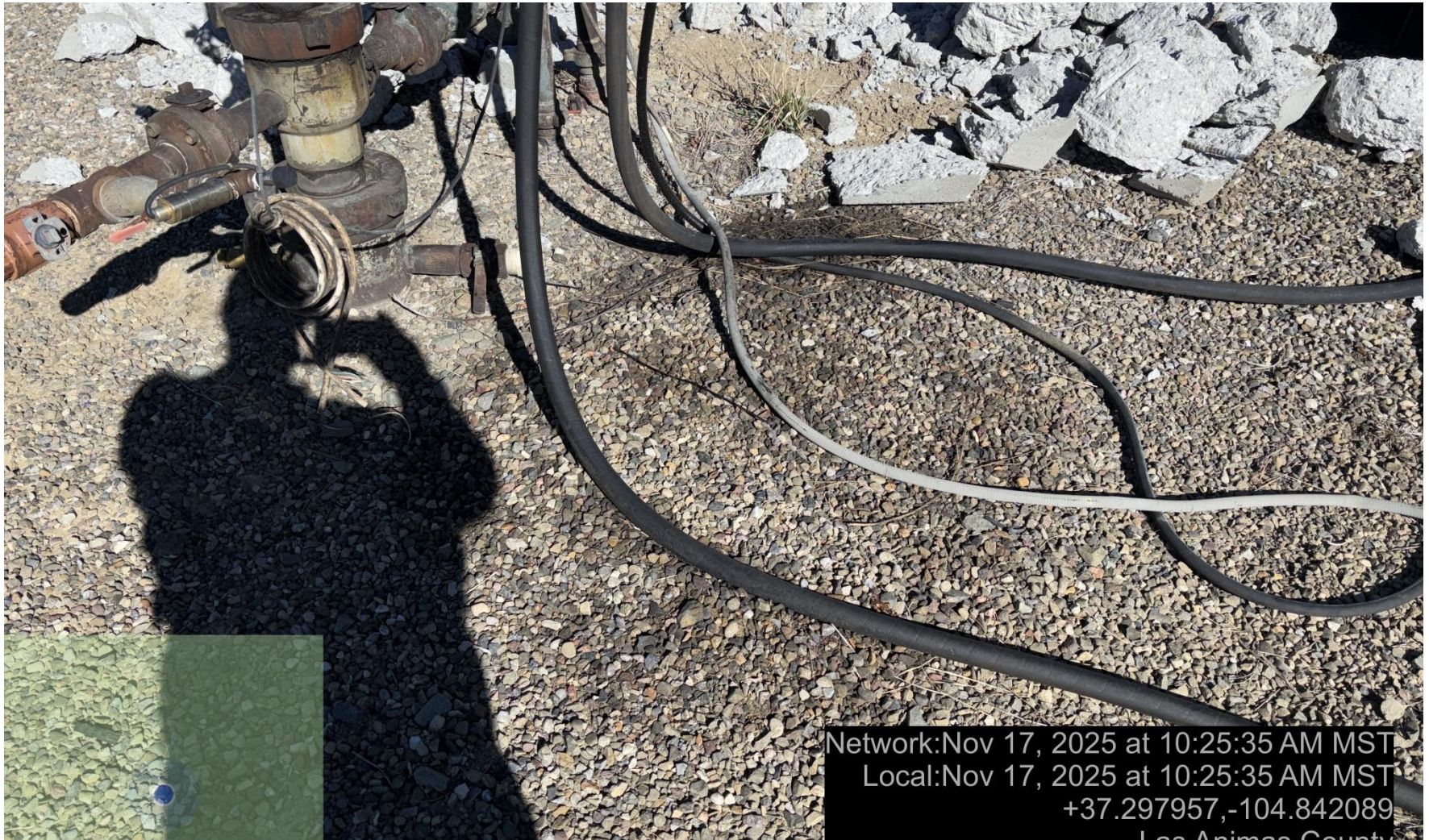
PHOTO 4: AREA OF IMPACTED SOIL NEAR WELLHEAD. Conduct maintenance on equipment, cleanup stained material and review self inspection processes. COMPLY WITH RULE 1002, (2).D. THIS IS THE 2 ND NOTICE FOR THIS CA IMMEDIATE ACTION IS REQUIRED.