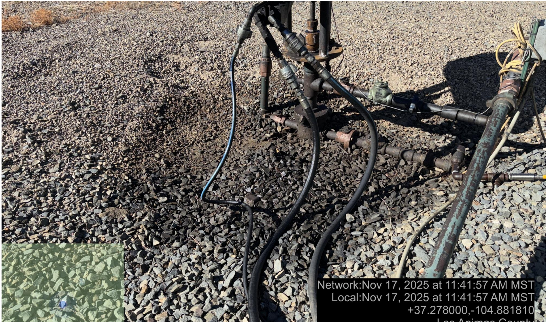
PHOTO 3: AREA OF IMPACTED SOIL NEAR WELLHEAD. Conduct maintenance on equipment, cleanup stained material and review self inspection processes. COMPLY WITH RULE 1002, (2).D. THE LEAKING EQUIPMENT WAS NOT ADDRESSED, THIS IS THE SECOND NOTICE FOR THIS CA IMMEDIATE ACTION IS REQUIRED.