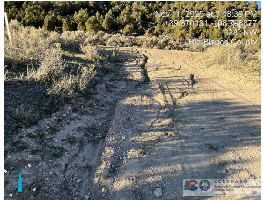
Photo # 4050 Insufficient erosion control on lease road; rill erosion cutting down lease road