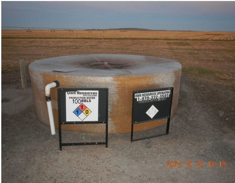
5. Produced water tank at gathering location.