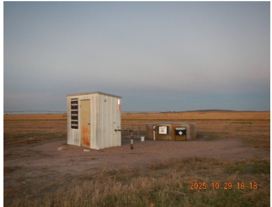
6. Gathering location overview.