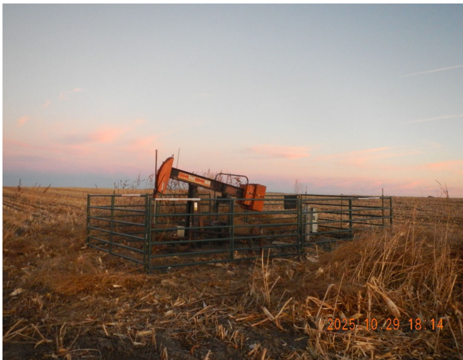
3. Well location overview.