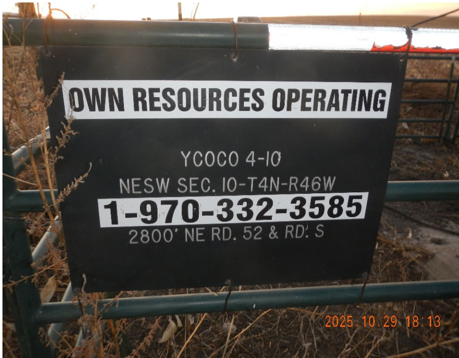
1. Lease sign at well location.