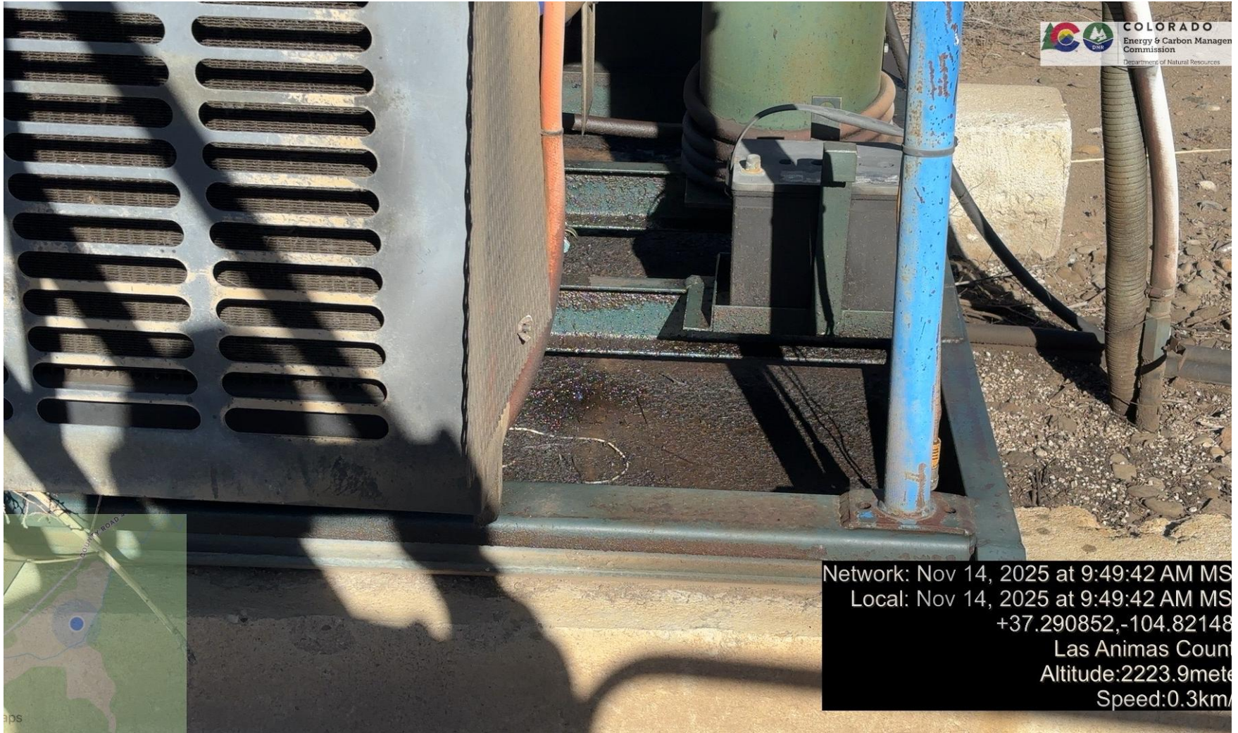
PHOTO 6: THE CA FOR OILY WASTE IN PRIME MOVER ENGINE SKID HAS BEEN ADDRESSED HOWEVER THESE ENGINE SKIDS SHOULD BE CLEANED AND MAINTAINED IN BETER CONDITIONS TO PREVENT STORMWATER FROM MIXING WITH OILY WASTE AND CAUSING RULE VIOLATIONS AFTER EVERY STORM EVENT.