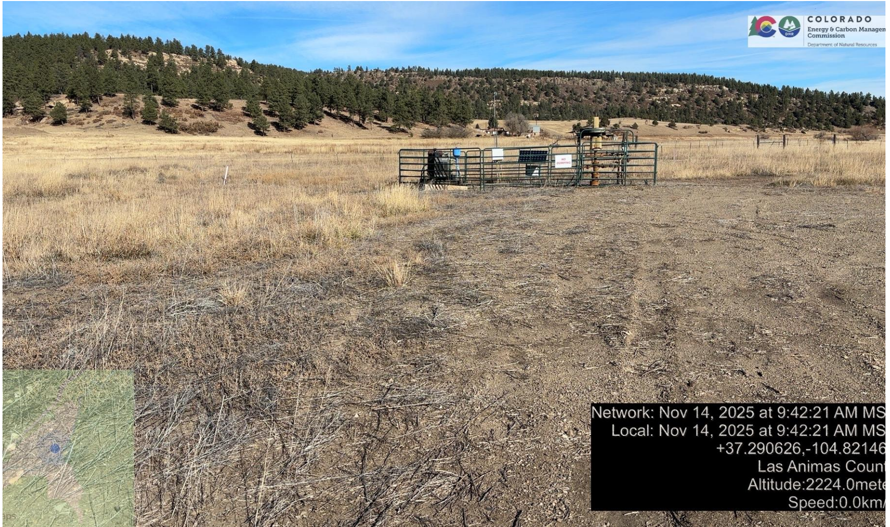
PHOTO 4: DEAD WEEDS AROUND LOCATION ARE A FIRE HAZARD. CUT AND REMOVE DEAD WEEDS PER RULE 606. THIS IS THE 2ND NOTICE FOR THIS CA, IMMEDIATE ACTION IS REQUIRED.