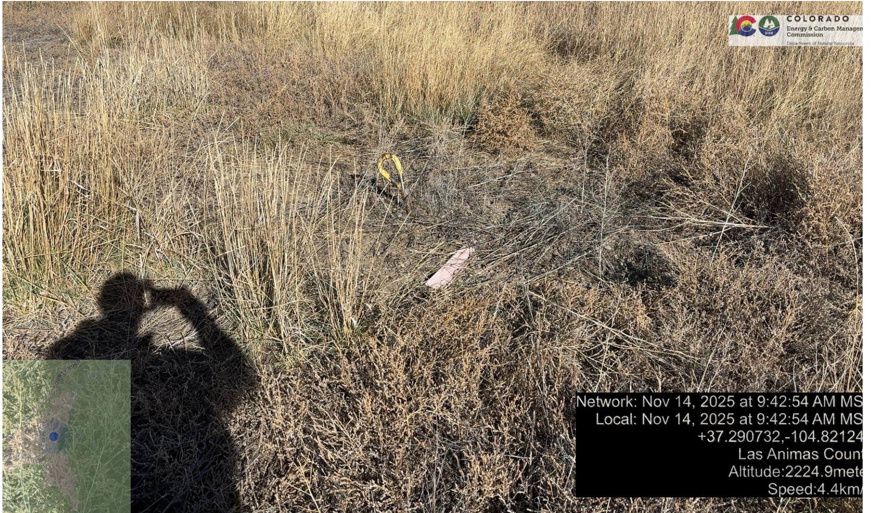
PHOTO 7: ANCHOR MARKER IS DOWN ON THE NORTHEAST ANCHOR FROM WELLHEAD. Install proper guy line markers per Rule 1003.a. THIS IS THE 2ND NOTICE FOR THIS CA, IMMEDIATE ACTION IS REQUIRED.