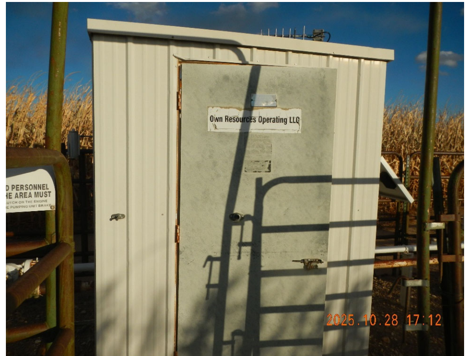
6. View of Gas Meter Run Shed.