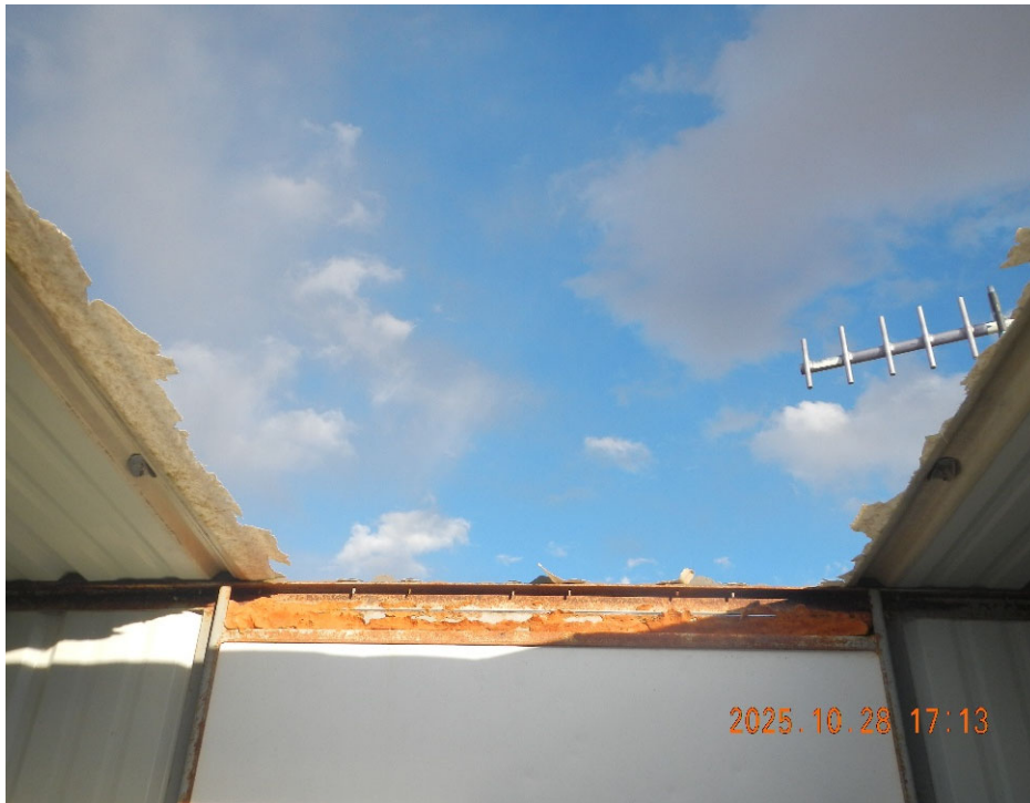
7. Roof damage on Gas Meter Shed.