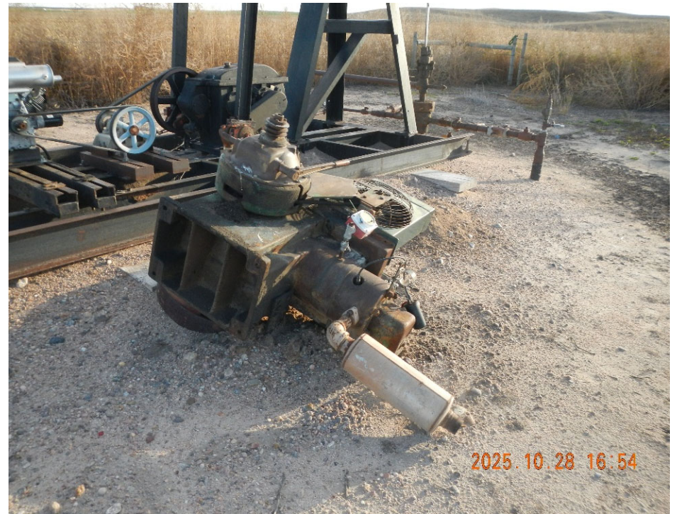
4. Removed prime mover motor inside fencing at well location.