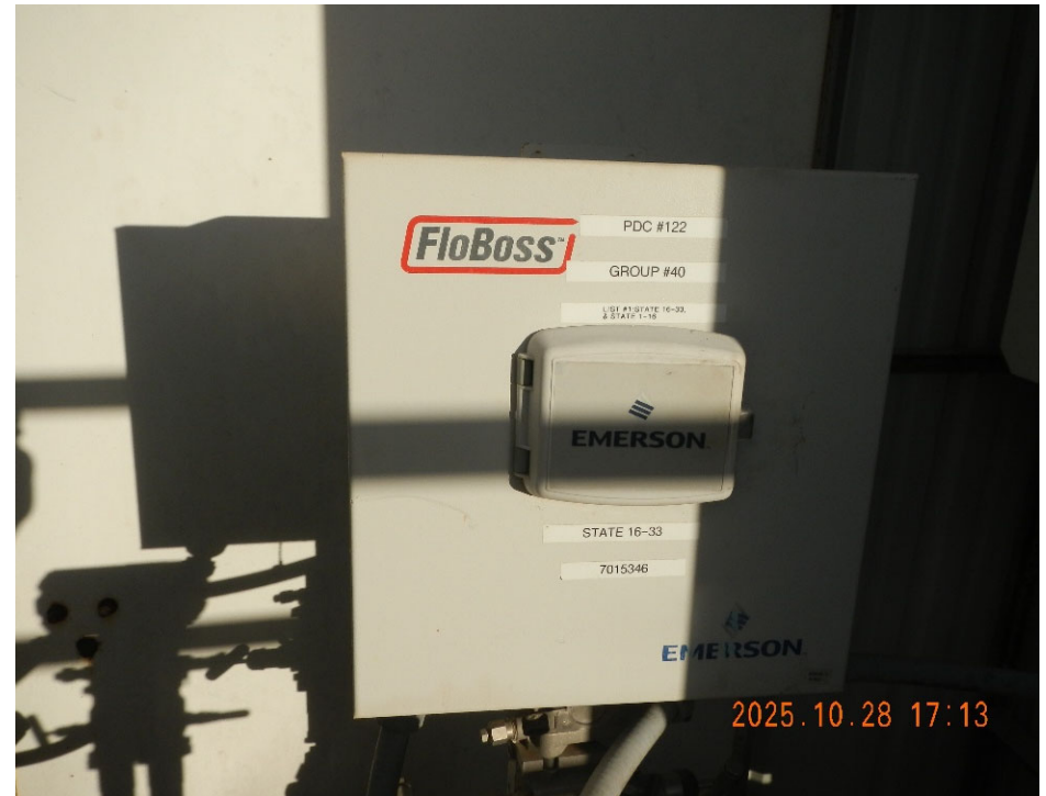
8. Gas meter inside meter shed.