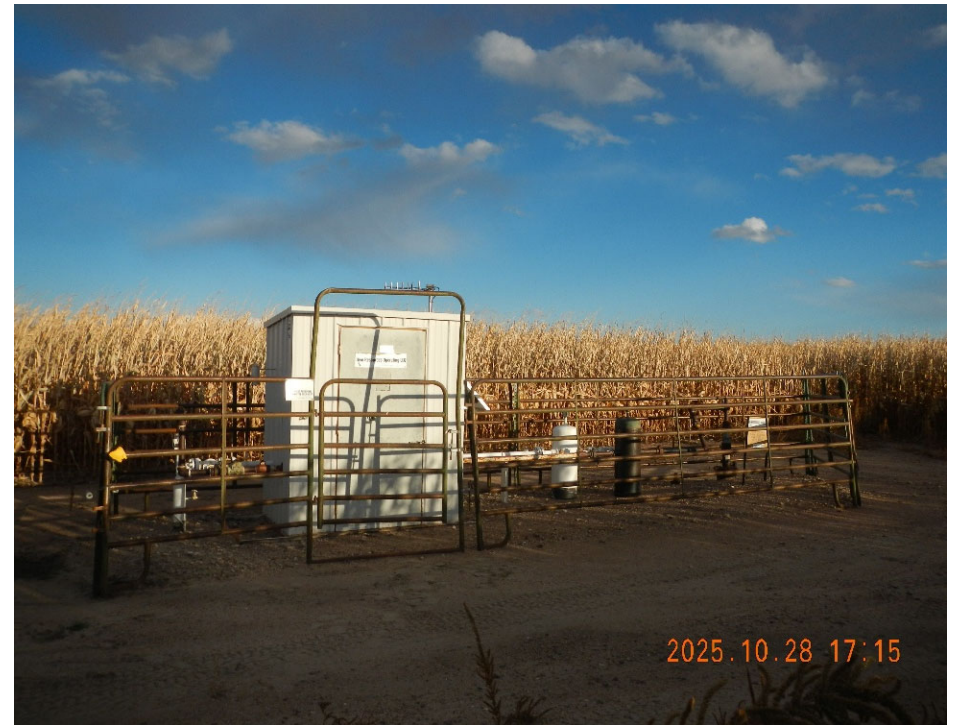
9. Calibration/Test Log inside Meter Shed.