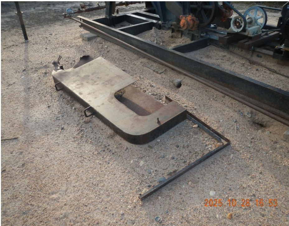
3. Belt guard inside fencing at well location.