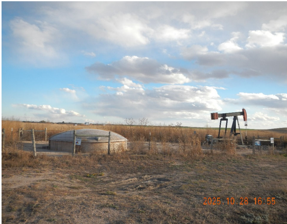
5. Well location overview.