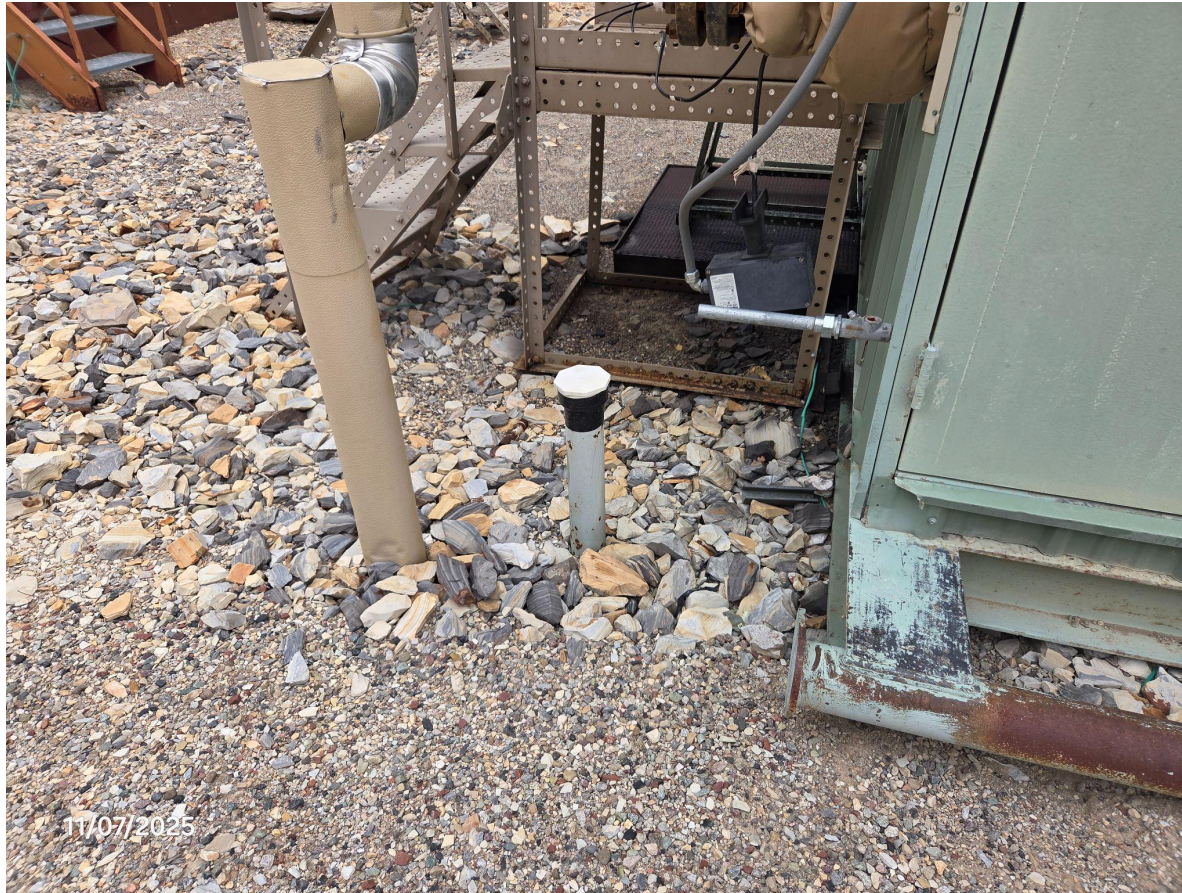
Photo 8: Photo taken from the housing unit on the southeast end of the Location. Pipe next to housing has been capped to prevent wildlife access.