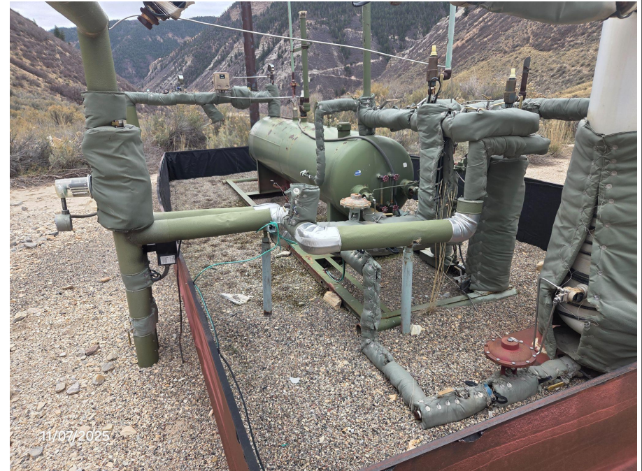
Photo 7: Photo shows the tank battery and separator facility on the southern areas of the Location. Secondary containment has been maintained and appears to be in proper functioning condition.