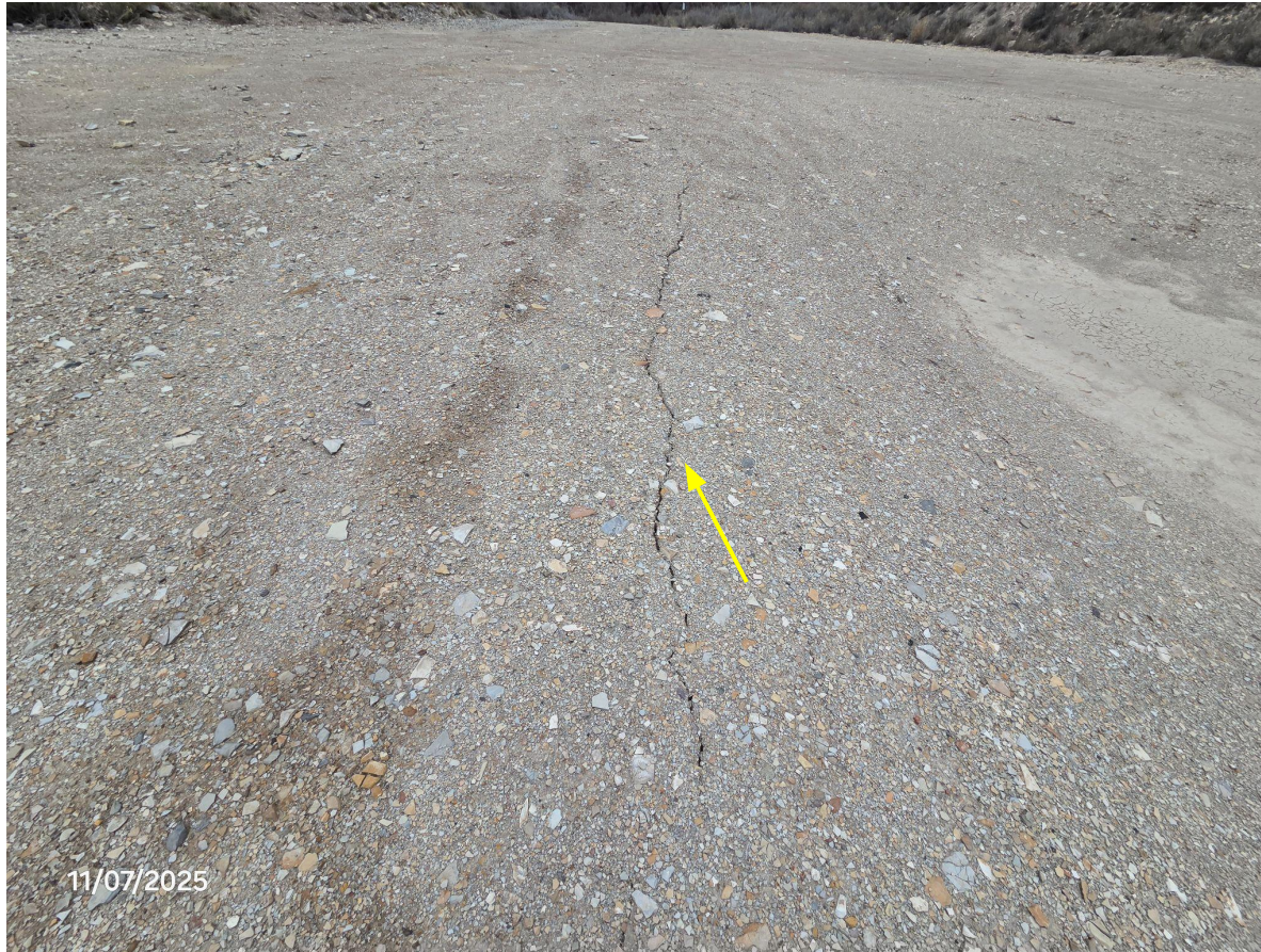
Photo 4: Continued from photo 3. Arrow shows cracks developing around areas of observed subsidence.