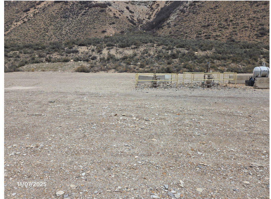
Photo 1: Photos taken from the west end of the Location; photos provide an overview of the working pad surface from north, northeast, southeast to south.