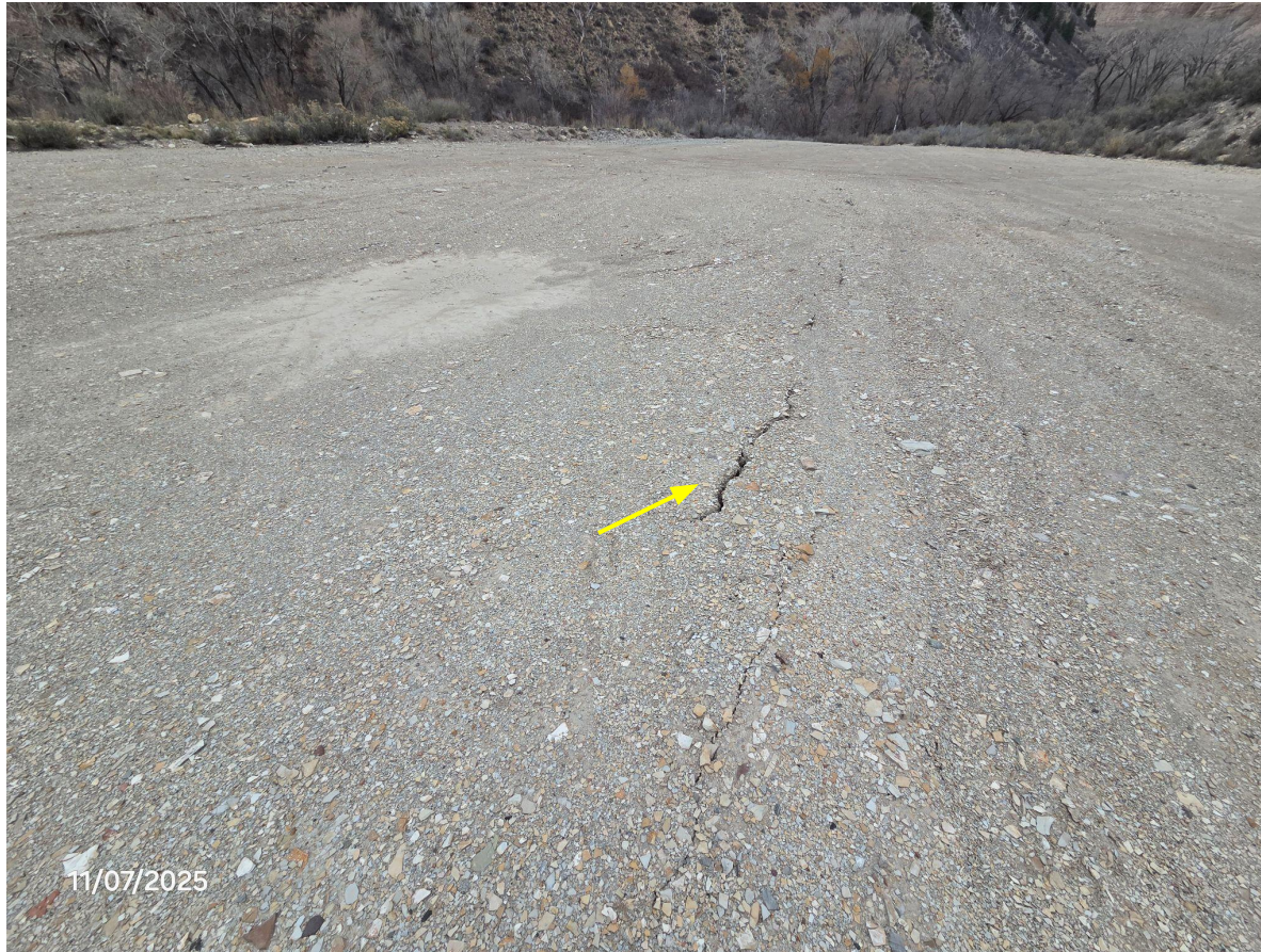
Photo 5: Continued from photo 3. Arrow shows cracks developing around areas of observed subsidence.