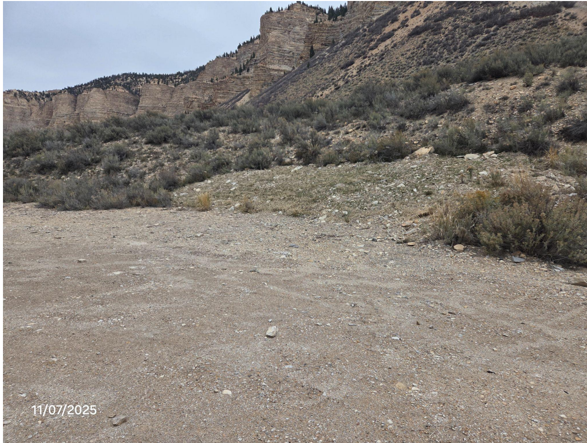
Photo 6: Photo taken from the northeast end of the Location, facing northeast. Photo shows additional reclamation efforts have been taken by Operator. Areas appear to be progressing towards 1003 standards.