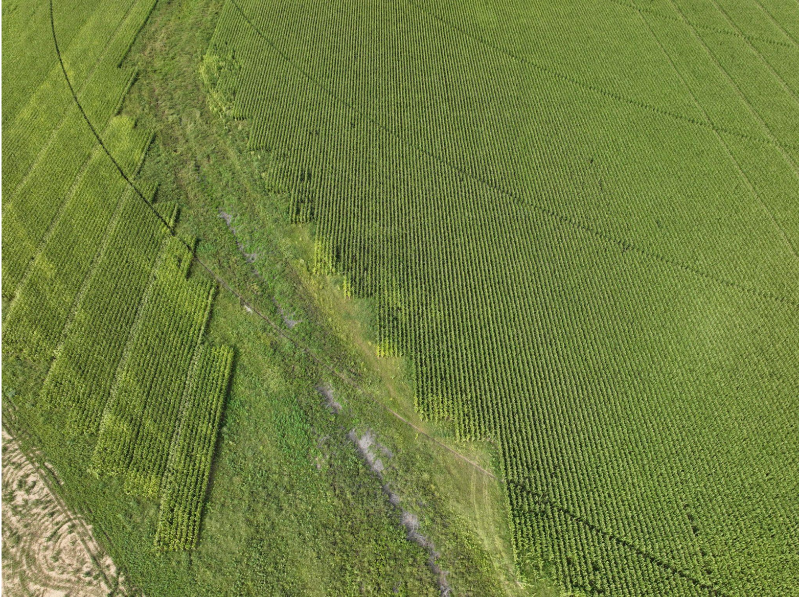
Photo 2. Aerial view of the well pad and access road taken with a drone during the time of the inspection from the southern edge facing north. Note: crop vegetation at the well pad and access road appears consistent with adjacent reference areas.