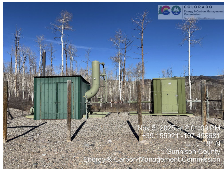
Separator and Meter Housing