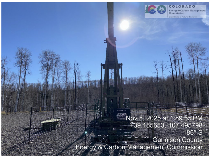
Wellhead with pump jack, fence and sign

Inspection Date: 11/5/2025 Inspection Doc#: 693809010