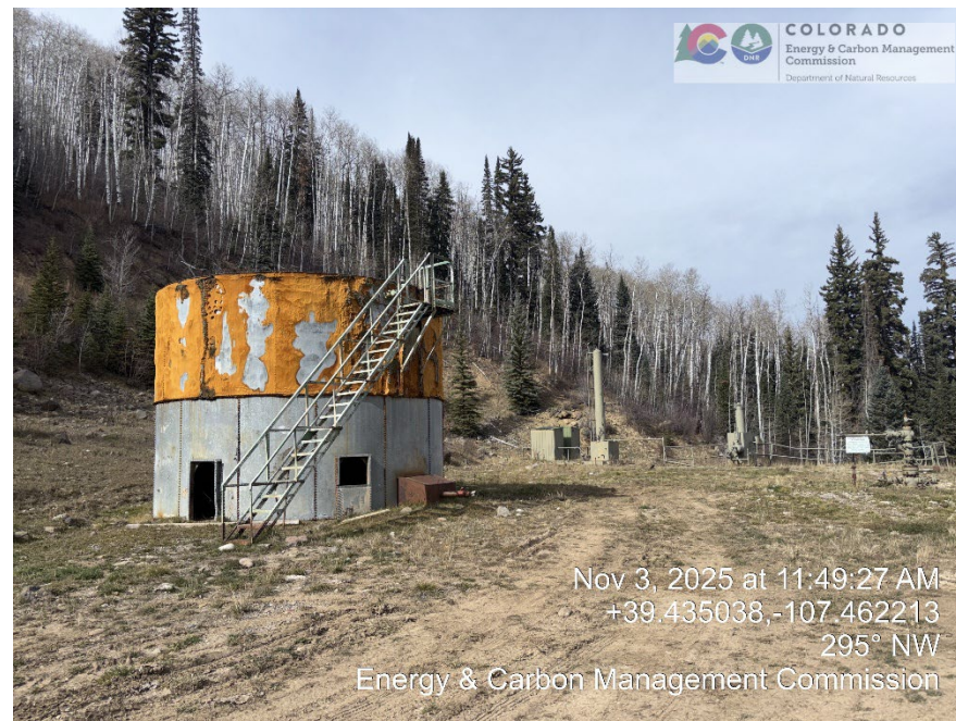
Location overview looking N