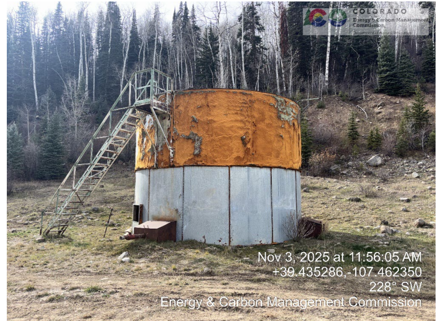
Unused tank battery