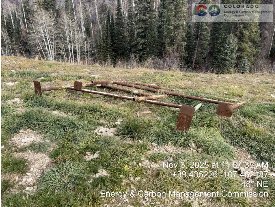
Unused pipe fencing

Inspection Date: 11/3/2025 Inspection Doc#: 693808995