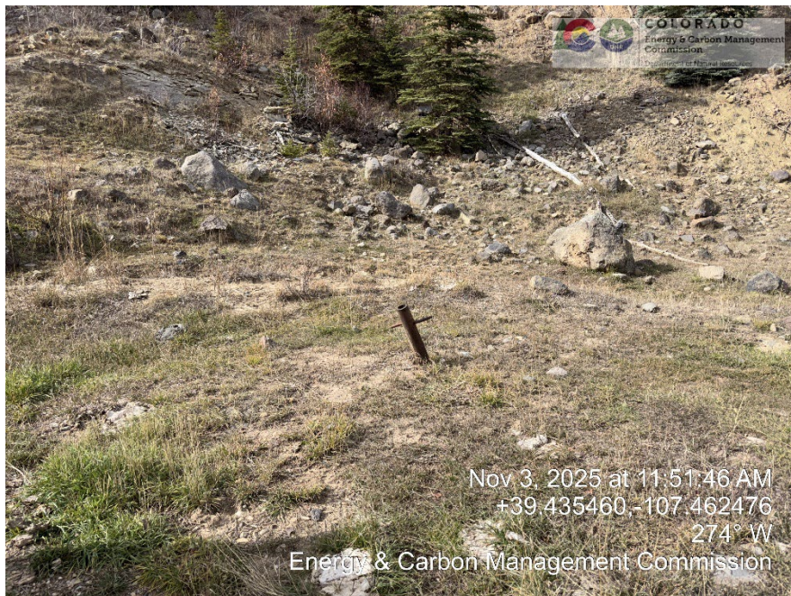
Unmarked guy line anchor NW

Inspection Date: 11/3/2025 Inspection Doc#: 693808995