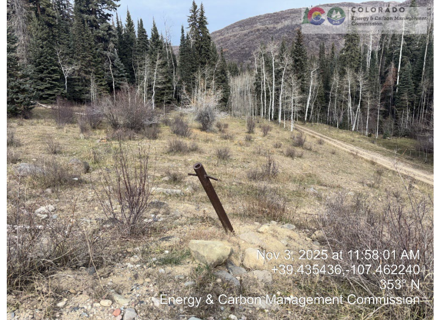
Unmarked guy line anchor NE