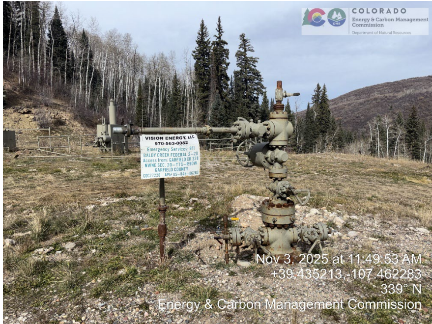
Wellhead with sign

Inspection Date: 11/3/2025 Inspection Doc#: 693808995