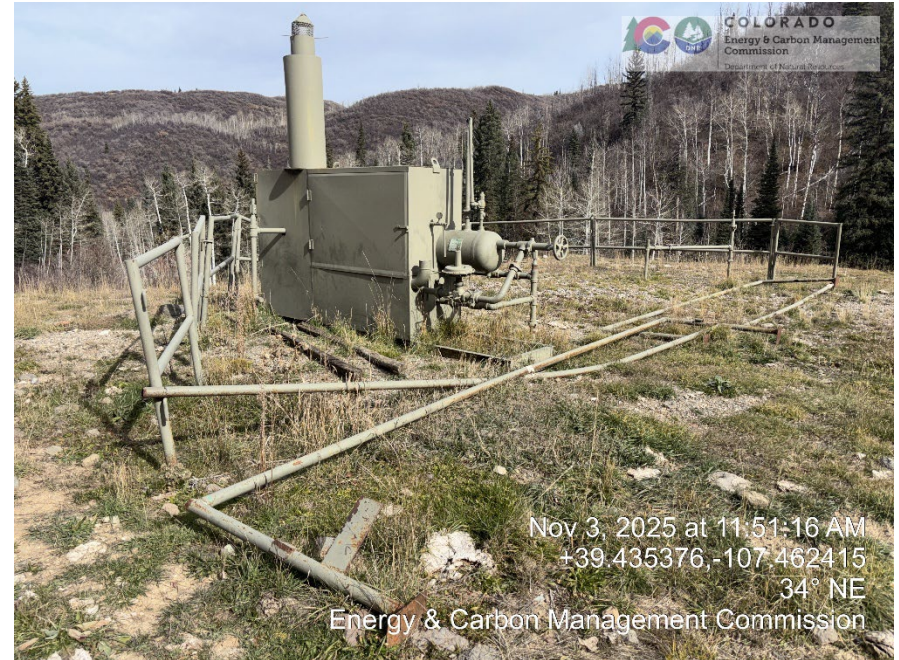
Separator with unsecured fencing