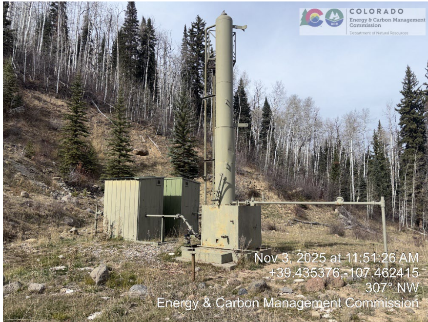
Dehydrator and meter housings.

Inspection Date: 11/3/2025 Inspection Doc#: 693808995