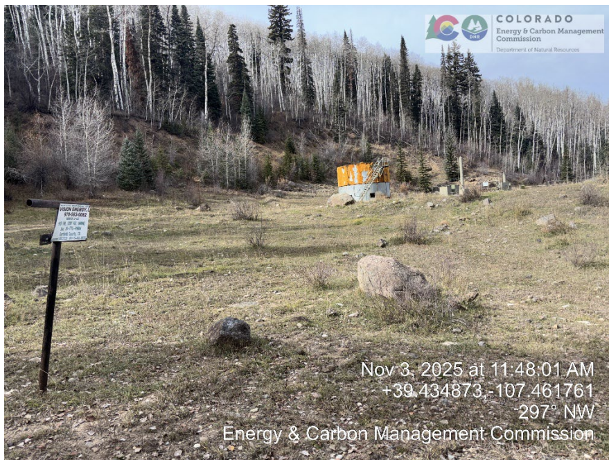
Sign at location entrance

Inspection Date: 11/3/2025 Inspection Doc#: 693808995