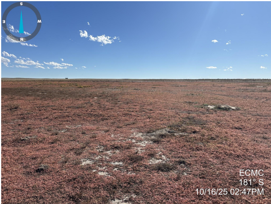
Photo 4. Photo taken of the well location, facing south. See comments under Photo 2.