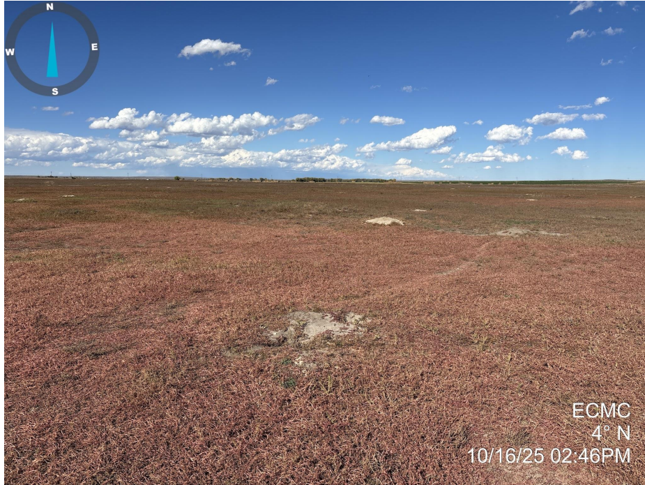
Photo 2. Photo taken of the well location, facing north. Photo illustrates that final reclamation activities have taken place, but the location is dominated by weedy annual vegetation and does not meet Rule 1004 standards.