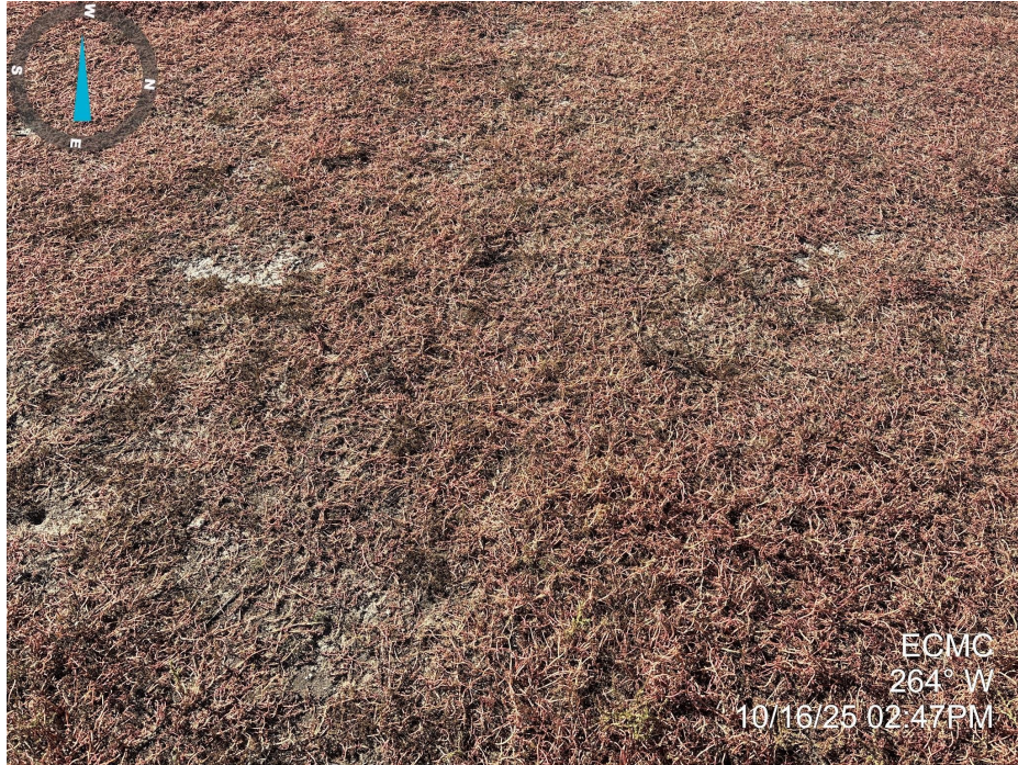
Photo 6. Photo taken of ground cover at the well location. Photo illustrates weedy annual vegetation dominates the location.