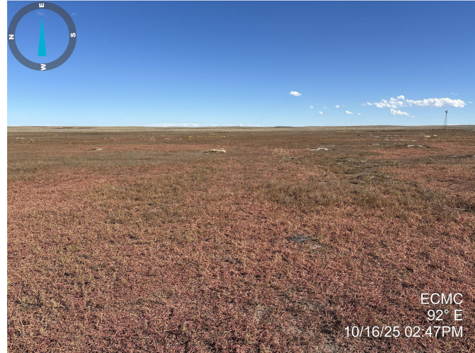
Photo 3. Photo taken of the well location, facing east. See comments under Photo 2.