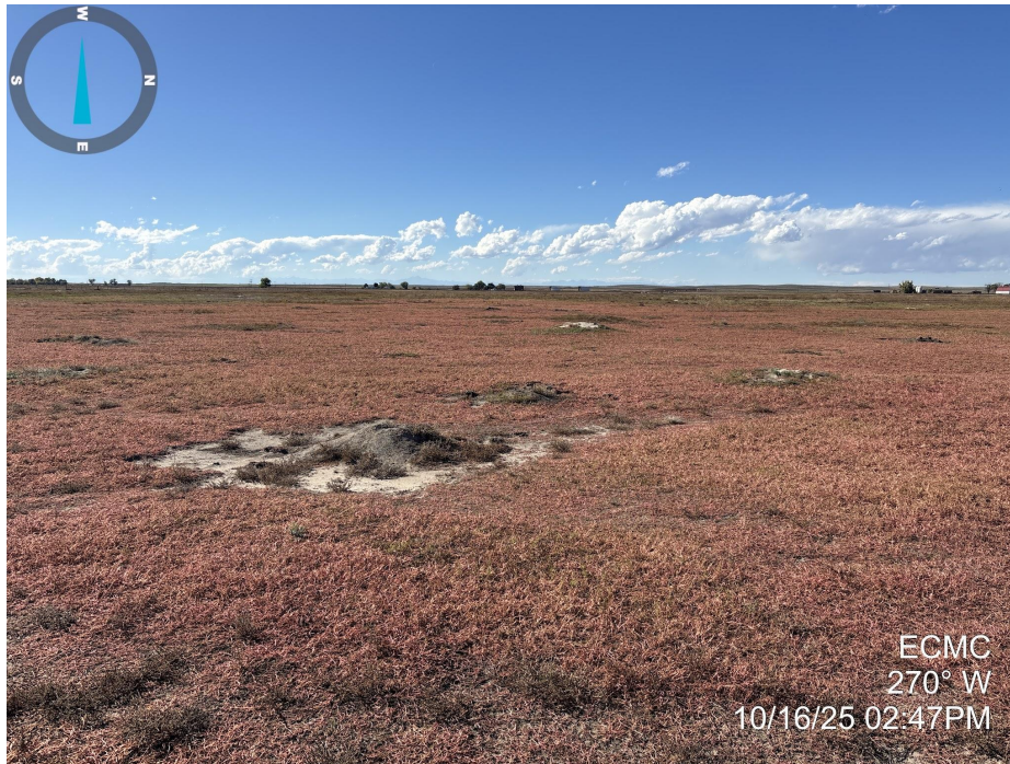
Photo 5. Photo taken of the well location, facing west. See comments under Photo 2.