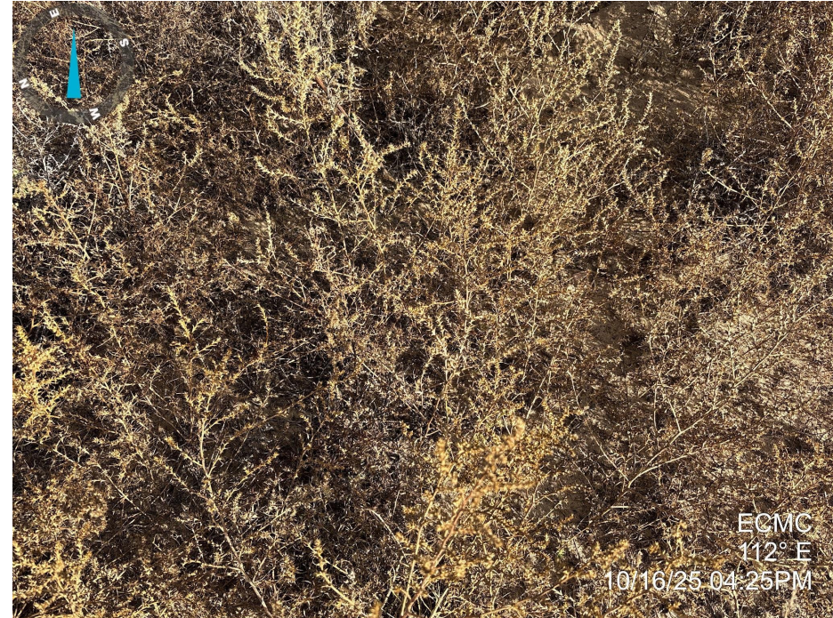
Photo 4. Photo taken of ground cover at the location. Photo illustrates kochia ( Bassia scoparia ).