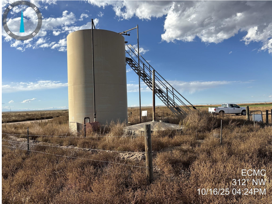
Photo 3. Photo taken of the tank battery location, facing northwest. See comments under Photo 1.