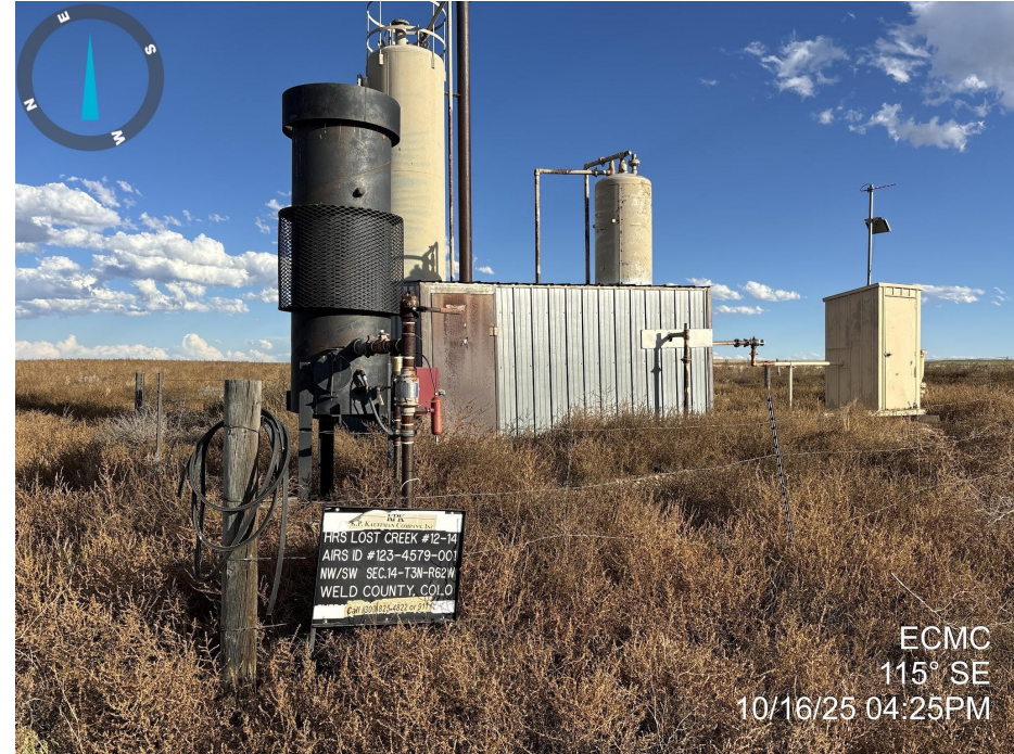
Photo 2. Photo taken of the well and tank battery location, facing southeast. See comments under Photo 1.