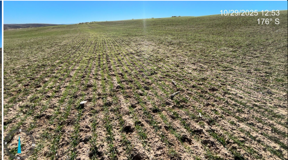
Photo 1: Photos showing an overview of the location looking north and south, respectively.