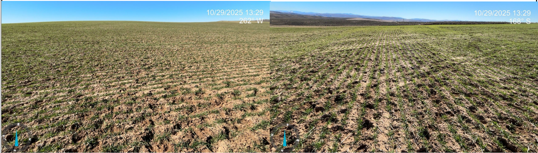
Photo 5: Photos showing an example of the reference area located in the south-central portion of the crop field.