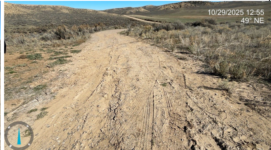
Photo 4: Photos showing an example of a portion of the access road that did not pre-exist Oil & Gas operations and remains unreclaimed. It appears as though the road is being used for agricultural activities. Scotch thistle rosettes have established throughout the area (yellow arrow).