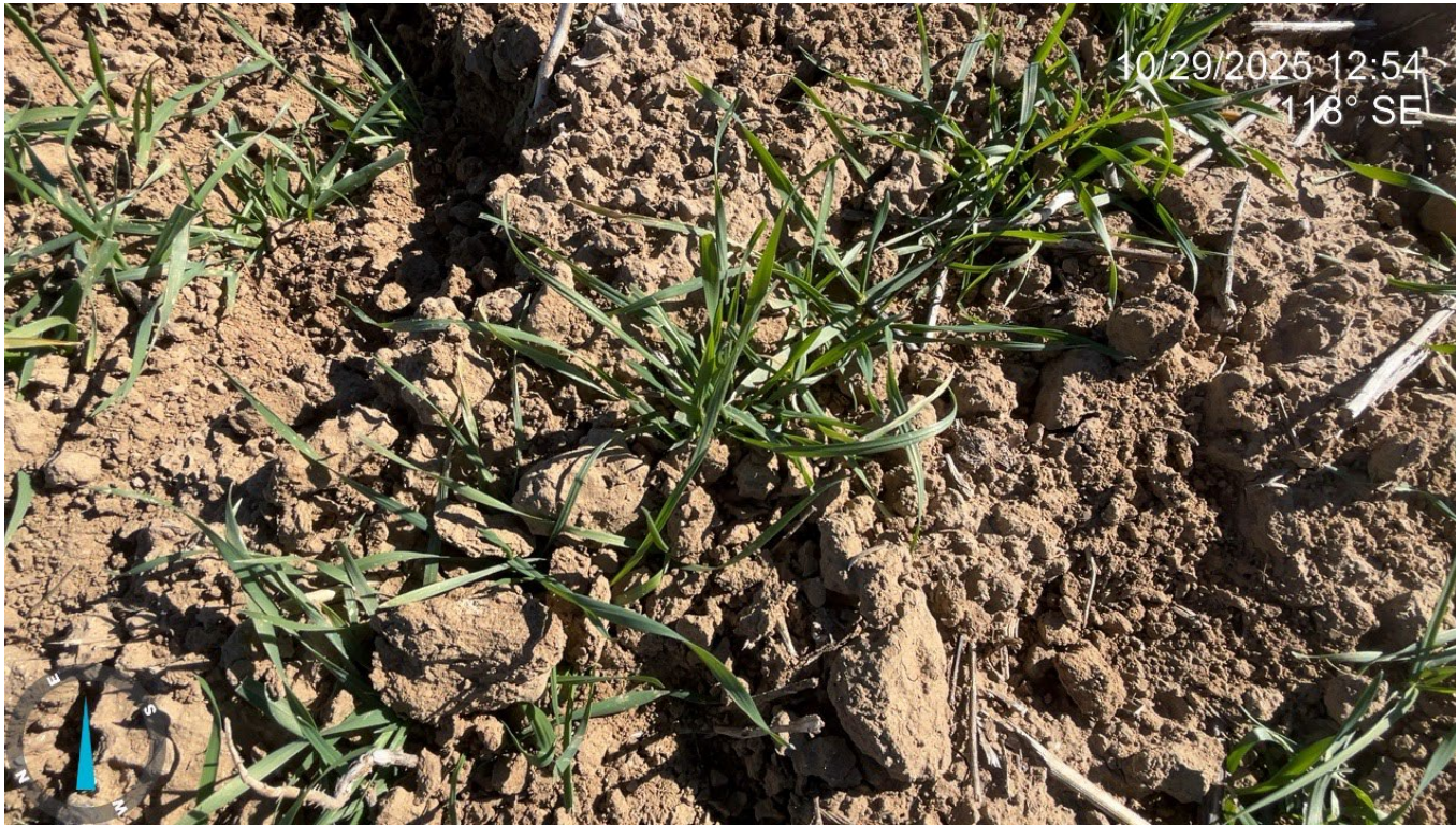
Photo 3: Photo shows an example of crop plantings at the location; crop appears to be winter wheat.