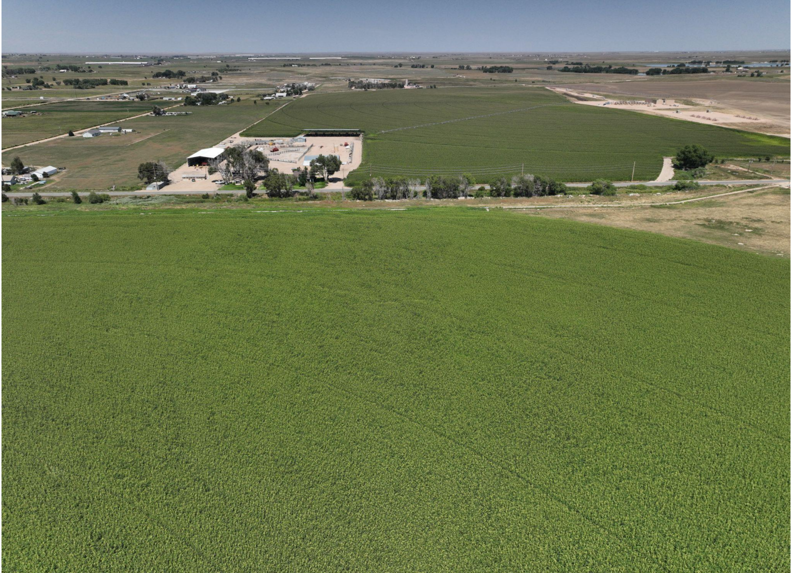
Photo 2. Aerial view of the well pad and access road taken with a drone at the time of the inspection from the southern edge facing north. Note: Crop vegetation at the well pad and access road appears consistent with adjacent reference areas.