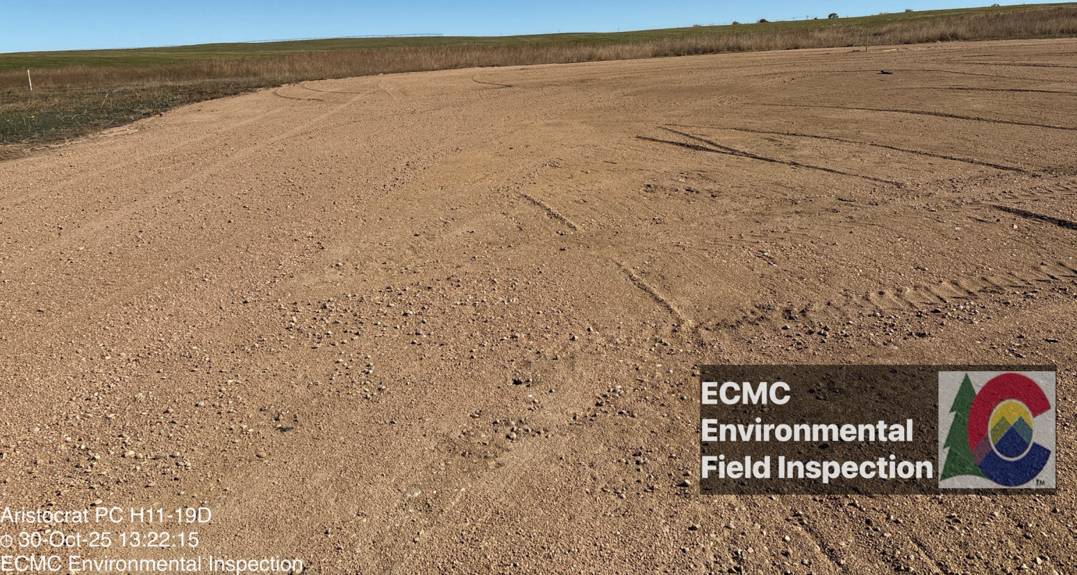
Former Aristocrat PC H11-19D Tank Battery. Surface appears to have been re-scraped/levelled recently.