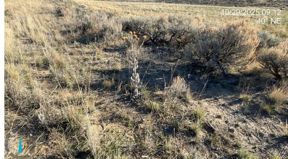
Photo 3: Photos showing an example of Scotch thistle, a List B noxious weed, that is present in tertiary amounts throughout the site. It does not appear as though weeds have been managed in 2025.