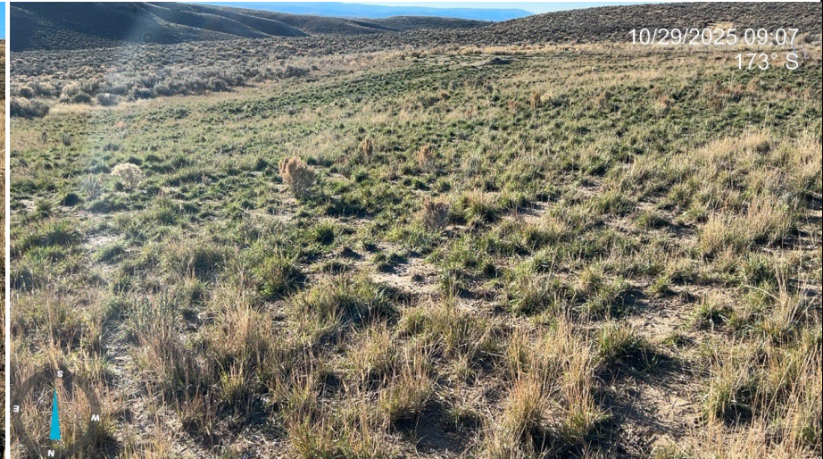
Photo 1: Photos showing an overview of the location looking north and south, respectively.