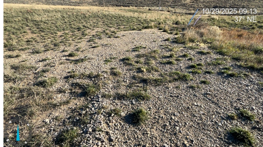
Photo 6: Photos showing the access road leading to the location has not been reclaimed; gravel and compaction is evident.