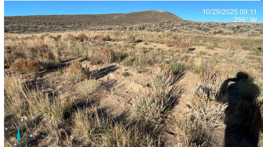
Photo 4: Photos showing an example of western portions of the site that were not reclaimed. Some native vegetation has established; however, the areas appear to have compaction issues and additional seeding may be necessary in some areas.