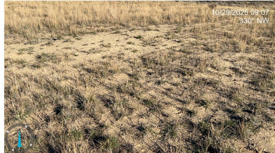
Photo 5: Photos showing an example of areas on the eastern end of the location that were predominantly bare during the 2024 inspection. Desirable, perennial vegetation has established; however, uniformity has not yet been achieved. Vegetation needs more time to develop.