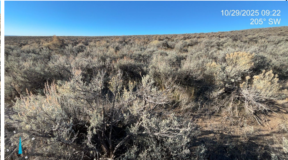
Photo 8: Photos showing an example of the reference area, located to the south of the location. Reference areas are characterized by big sagebrush shrublands, and big sagebrush is dominant.