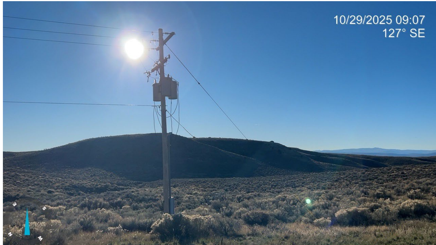
Photo 7: Photos showing an example of utility equipment that remains at the location and requires removal.