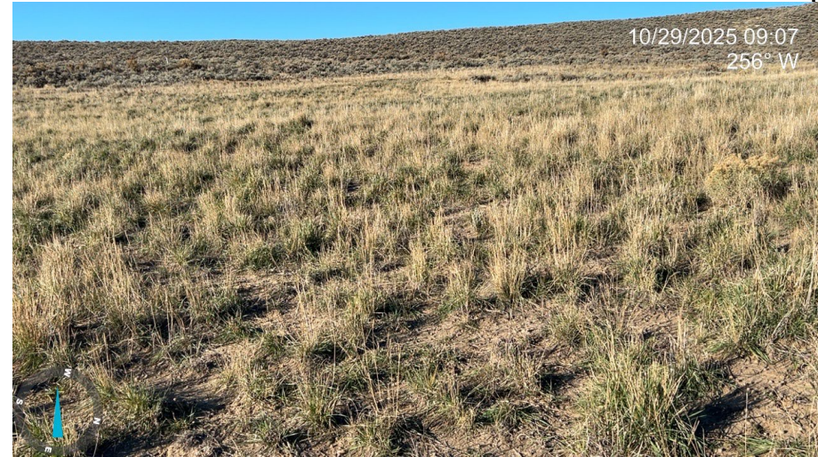
Photo 2: Photos showing an overview of the location looking east and west, respectively.