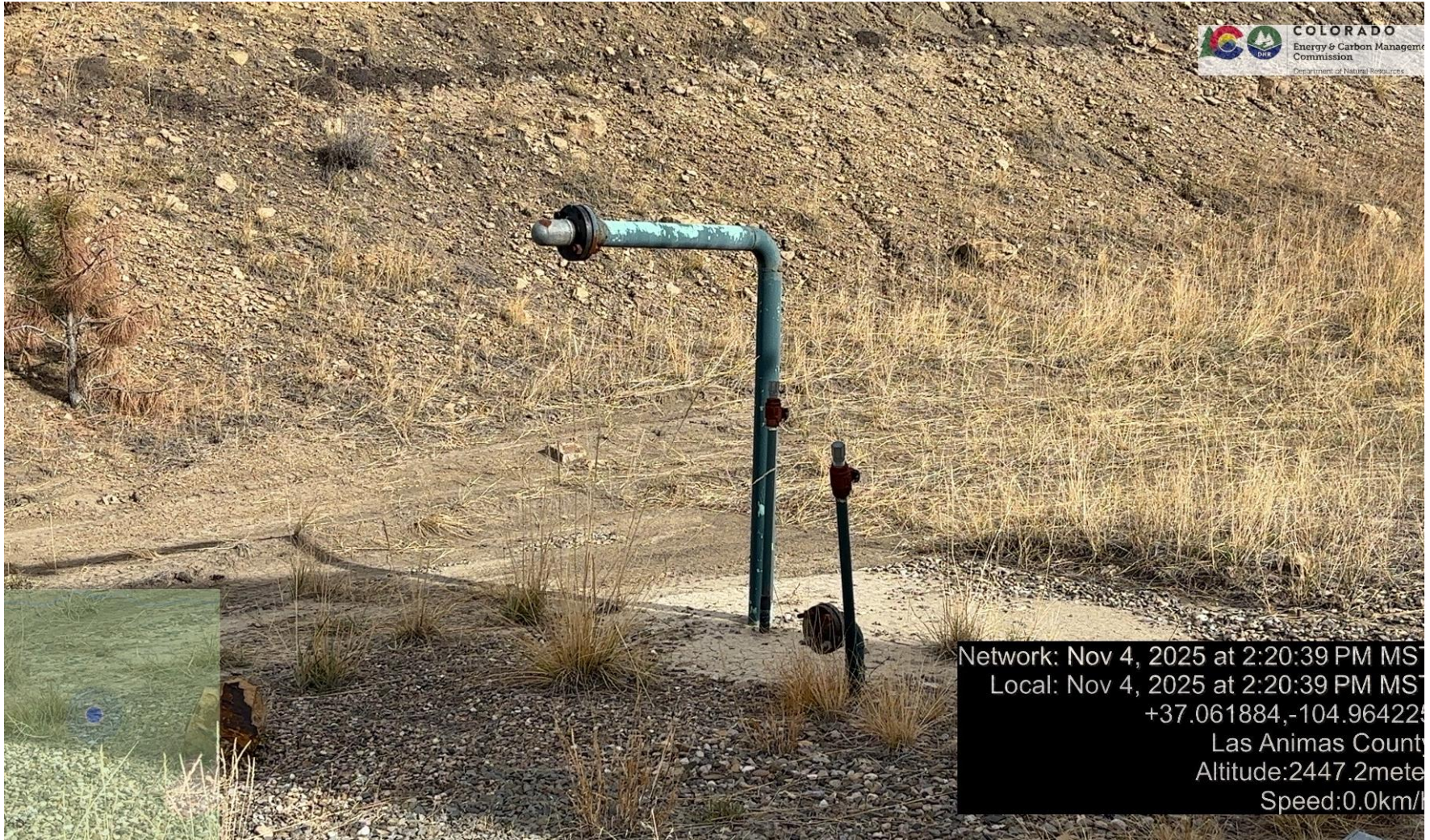
PHOTO 4: UNUSED EQUIPMENT (1-2" RISER AND 1-1" RISER NEAR METER HOUSE). REMOVE OR MARK UNUSED RISERS PER RULE 606. CA DATE 11-14-2025.