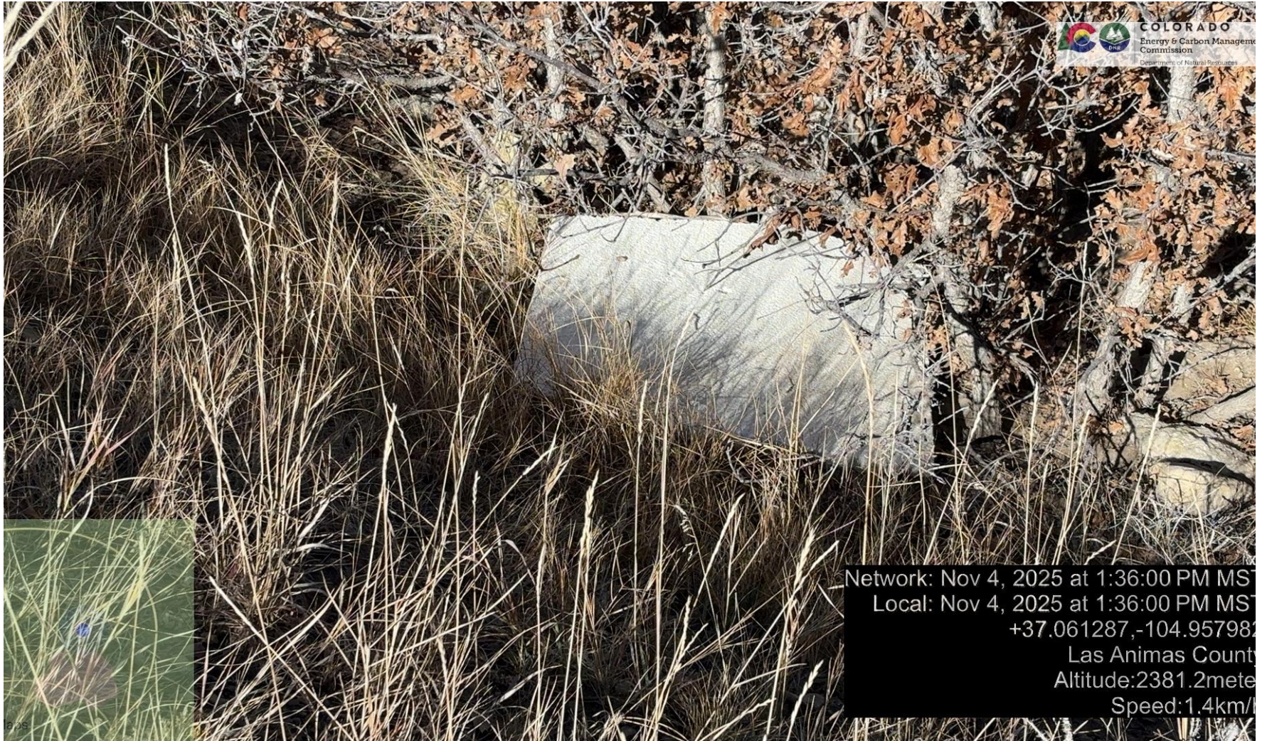
PHOTO 3: TRASH OFF THE NORTH END OF LOCATION. REMOVE ALL TRASH FROM LOCATION PER RULE 606. CA DATE 11-14-2025.