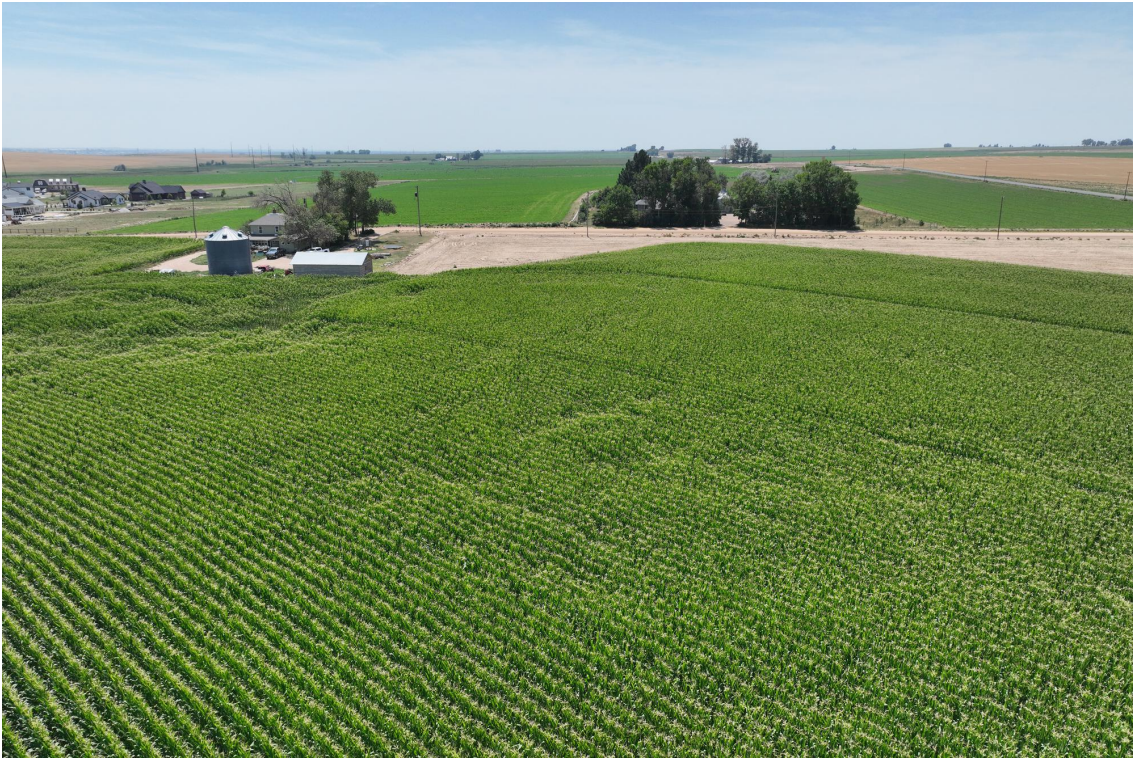
Photograph 3: View facing south as required in Energy and Carbon Management Commission (ECMC) Rule 1004. Photo Taken from GPS 40.307264, -104.884034