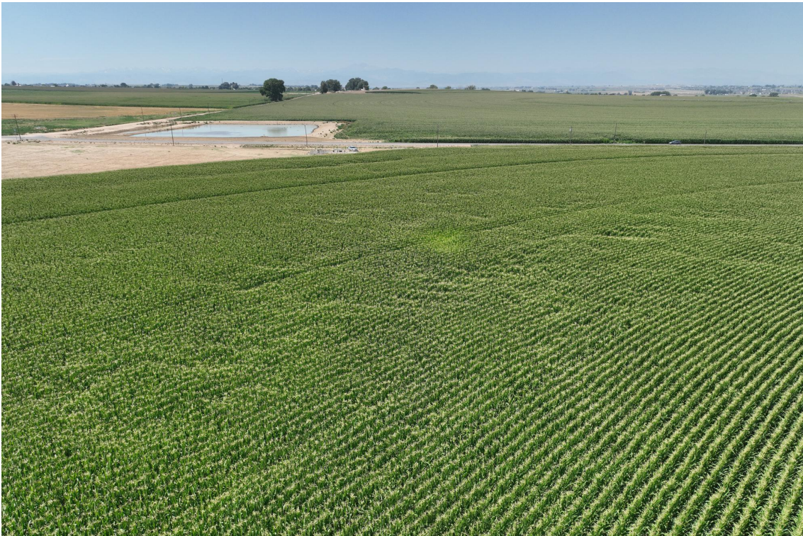
Photograph 4: View facing west as required in Energy and Carbon Management Commission (ECMC) Rule 1004. Photo Taken from GPS 40.306915, -104.883623