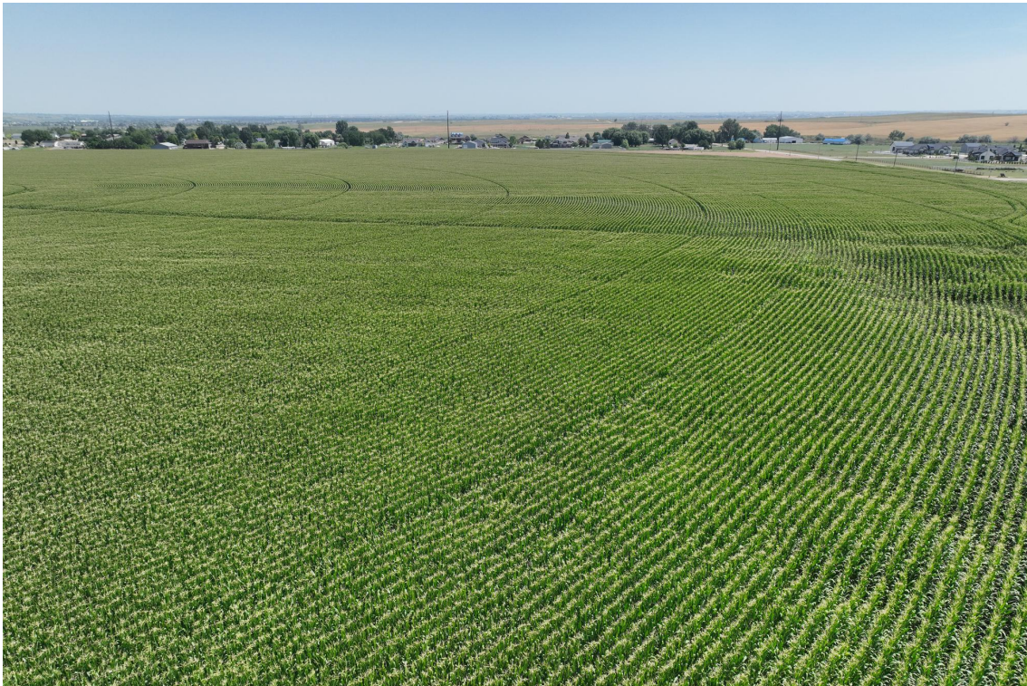
Photograph 2: View facing east as required in Energy and Carbon Management Commission (ECMC) Rule 1004. Photo Taken from GPS 40.306915, -104.884444