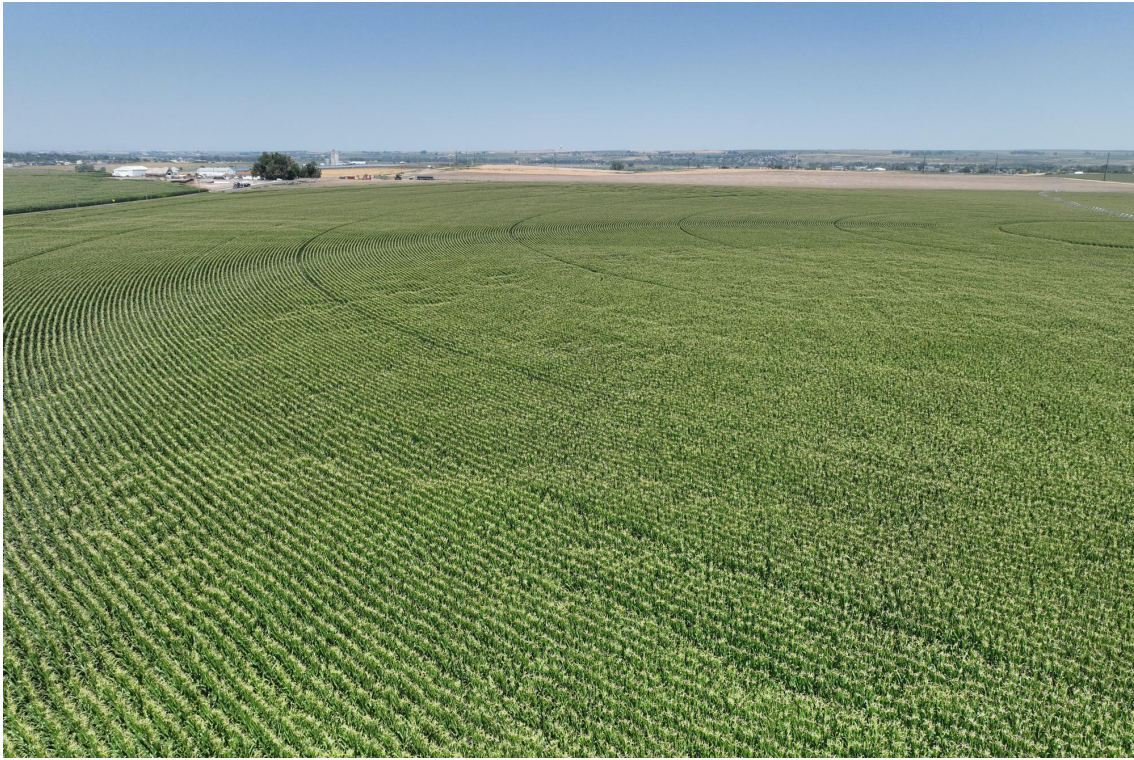
Photograph 1: View facing north as required in Energy and Carbon Management Commission (ECMC) Rule 1004. Photo Taken from GPS 40.306565, -104.884034