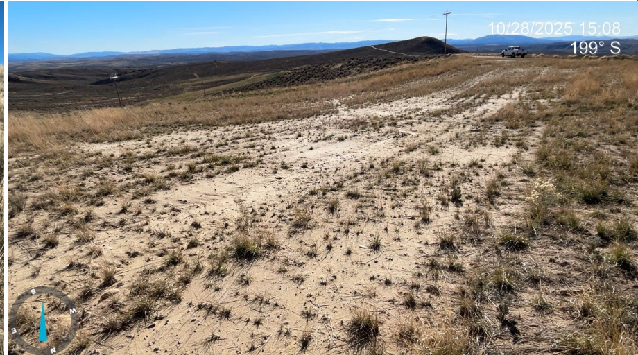
Photo 1: Photos showing an overview of the location looking north and south, respectively. Vegetation is not progressing towards 1004 reclamation requirements in some areas; uniformity is not evident.