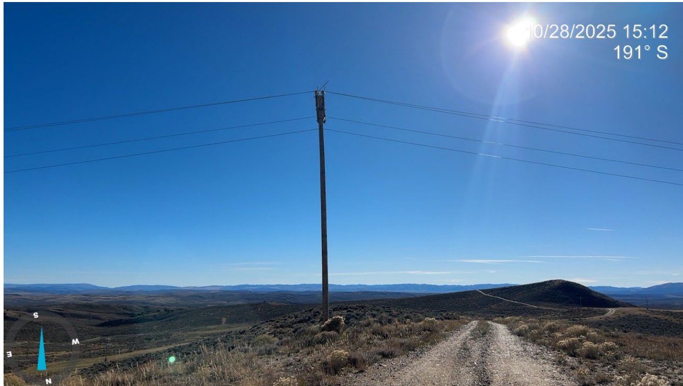
Photo 6: Photo showing utility equipment associated with the location that requires removal and the access road on the western portion of the location looking south. The access road remains unreclaimed; gravel and compaction is evident.