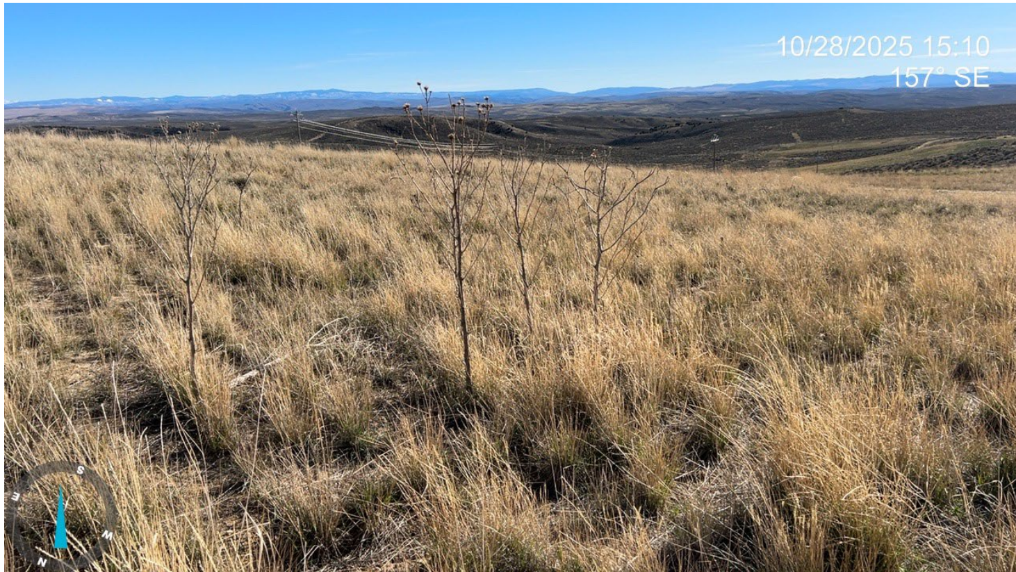
Photo 4: Photo left showing an example of Scotch thistle, a List B noxious weed, that is scattered throughout the location. Weeds do not appear to have been managed in 2025.