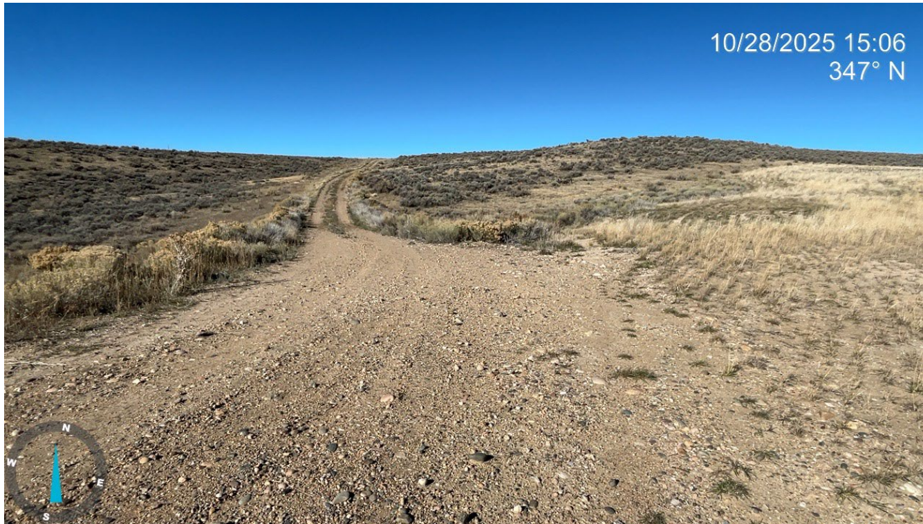
Photo 5: Photo showing the access road on the western portion of the location looking north. The access road remains has not been reclaimed; gravel and compaction is evident.