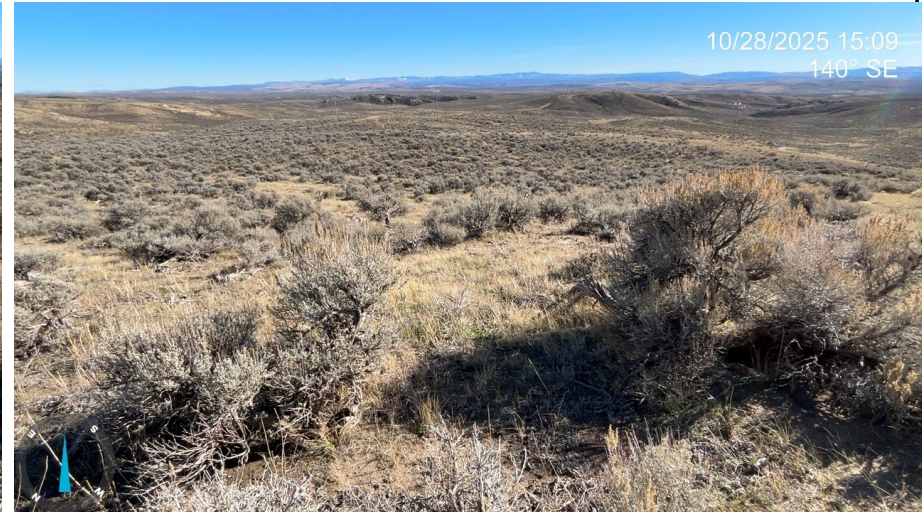
Photo 9: Photos showing an example of the reference area, located to the east of the location. Reference areas are characterized by big sagebrush shrublands; big sagebrush is dominant.