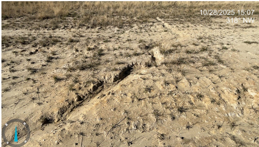
Photo 3: Photos showing example of rilling and erosion that is occurring in portions of the location that are predominantly bare and are not progressing towards 1004 reclamation requirements.