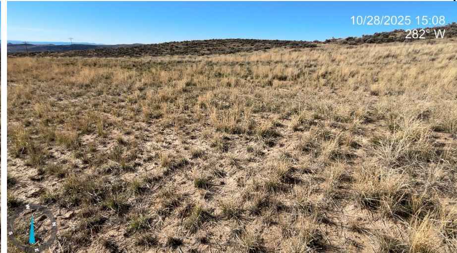
Photo 2: Photos showing an overview of the location looking east and west, respectively.