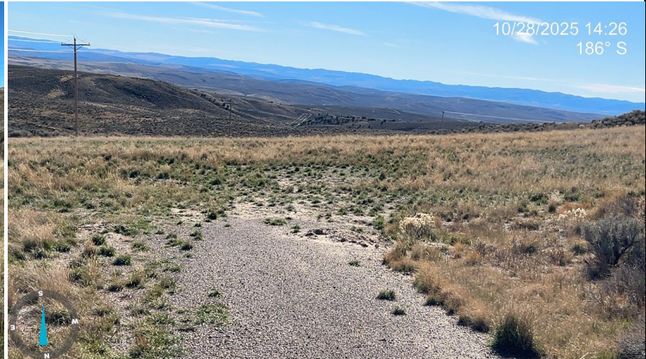
Photo 6: Photos showing the northern access road leading to location has not been reclaimed; gravel and compaction is evident.