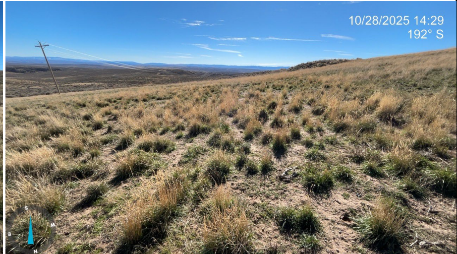
Photo 1: Photos showing an overview of the location looking north and south, respectively.