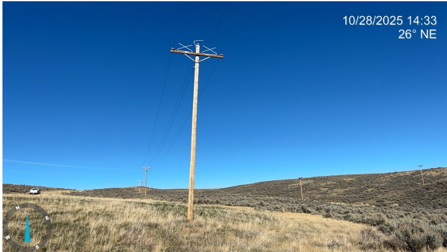
Photo 5: Photos showing an example of utility equipment that remains at the location and requires removal.