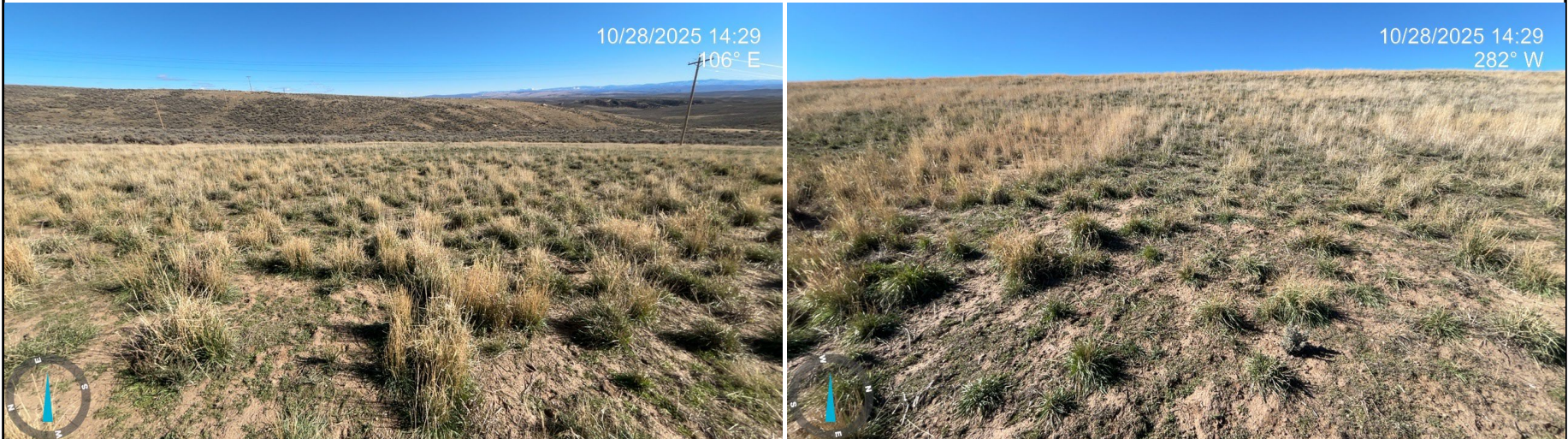
Photo 2: Photos showing an overview of the location looking east and west, respectively.