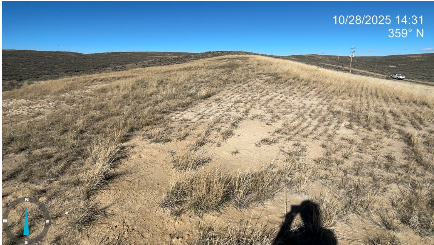
Photo 4: Photos showing the western hillside of the location that is not progressing towards 1004 reclamation requirements; uniformity is not evident.