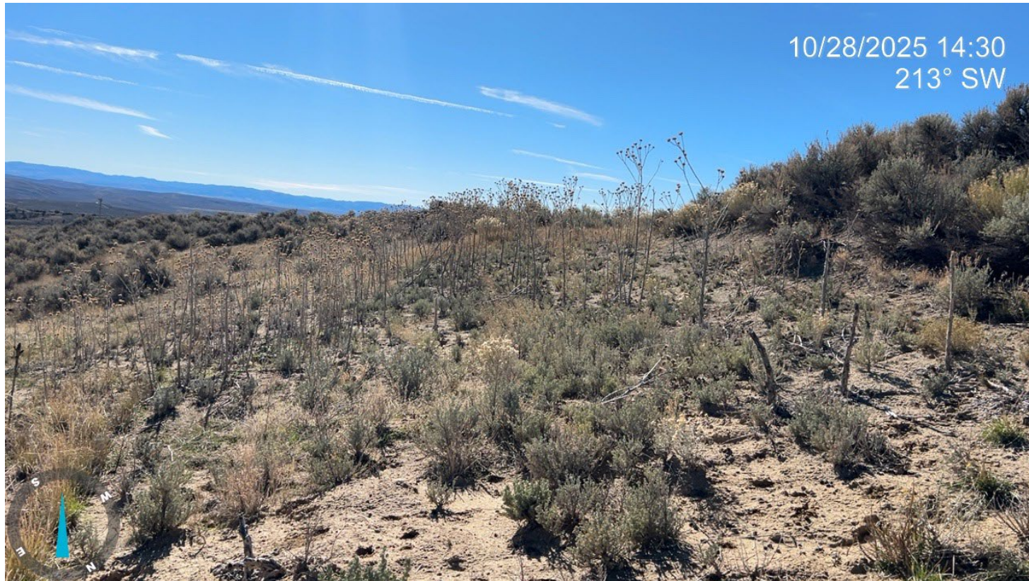
Photo 3: Photos showing a dense patch of Scotch thistle, a List B noxious weed species, that is present on the southwestern hillside of the location.