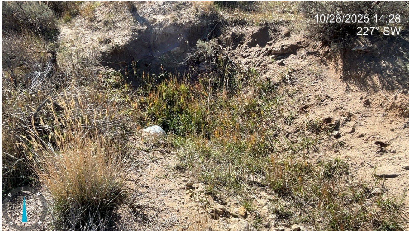
Photo 7: Photo showing an example of a culvert that remains along the unreclaimed northern access road.