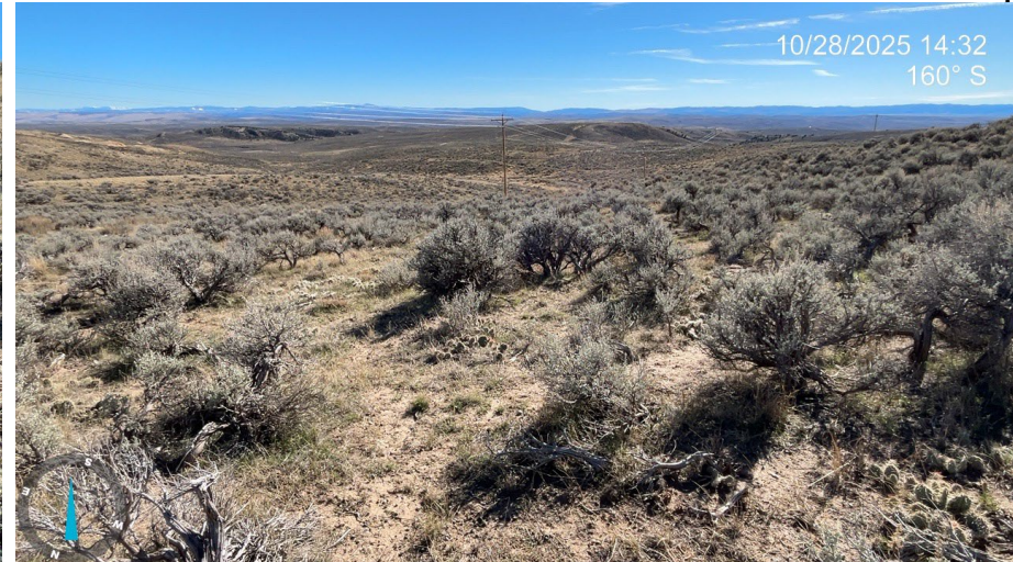
Photo 9: Photos showing an example of the reference area, located to the south of the location. Reference areas are characterized by big sagebrush shrublands, and big sagebrush is dominant.