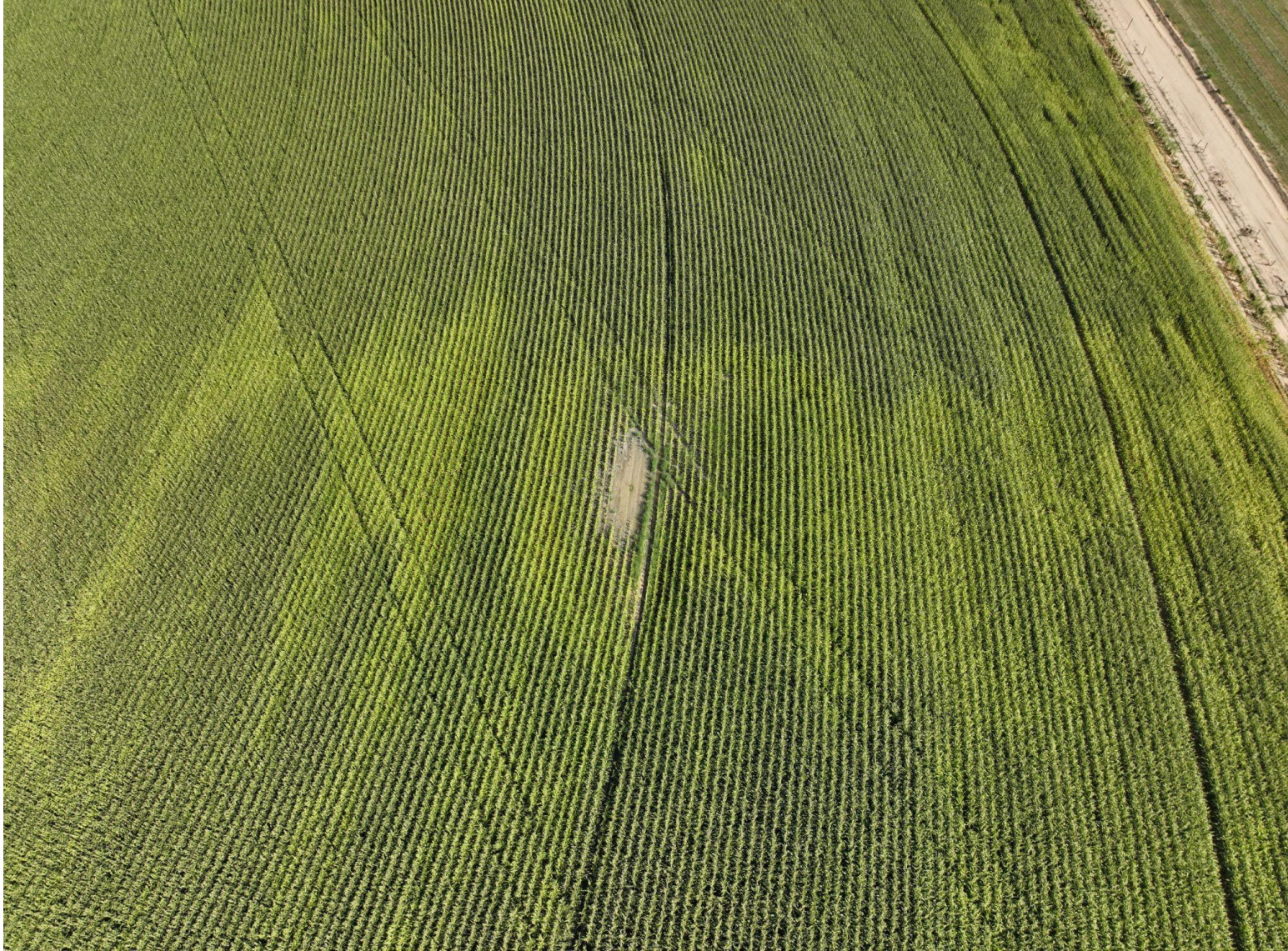
Photo 2. Aerial view of the well pad and access road taken during the time of the inspection with a drone from the southern edge facing north. Note: obvious stunting and lack of crop establishment issues were observed. Area does not appear consistent with adjacent reference areas.